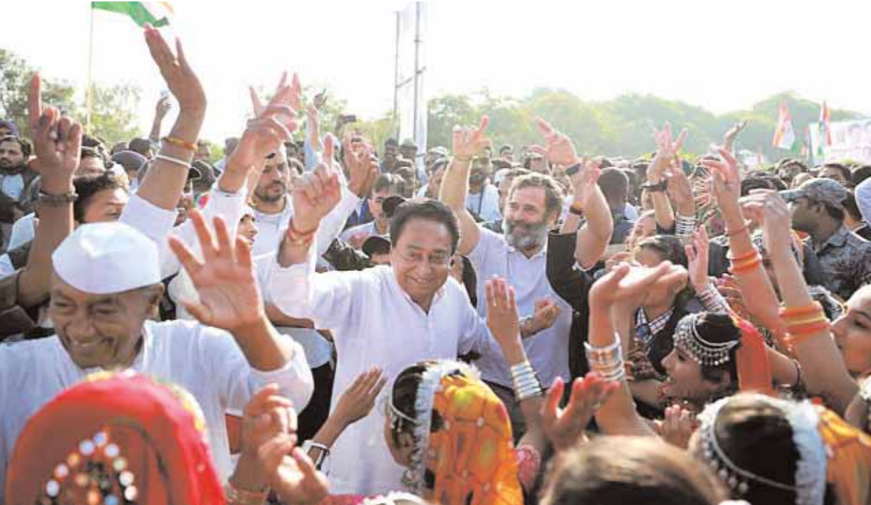
Congress leader Rahul Gandhi with Congress State President Kamal Nath and senior leader Digvijay Singh during the Bharat Jodo Yatra in Ujjain, Madhya Pradesh on Tuesday.