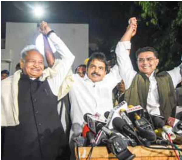
Congress general secretary KC Venugopal raises his hands with Rajasthan Chief Minister Ashok Gehlot and party leader Sachin Pilot during the State-level coordination committee meeting on 'Bharat Jodo Yatra' at party headquarters in Jaipur on Tuesday

"When Rahul Gandhi has said that our leaders are assets then we are assets... Where is the dispute then," Gehlot said when asked about Rahul's observation.