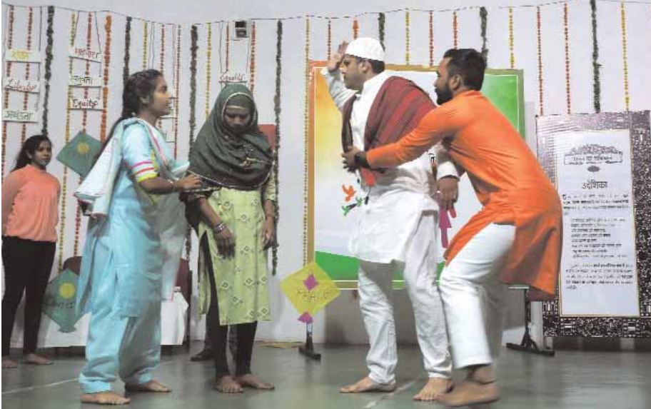
Participants take part in a street play competition 'Rang-e-Samvidhan' organised by an NGO Youngshala at State Museum in Bhopal on Tuesday.

In Madhya Pradesh & Chhattisgarh, Bank of Baroda has 271 semi-urban/rural branches. Advances to the agriculture sector in Madhya Pradesh & Chhattisgarh have grown to over Rs 5,600 crore as on September 30, 2022. Under Agriculture advances, the Baroda Kisan Credit Card and Lending to Self Help Groups (SHG) are the key growth sectors.