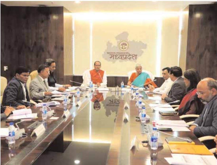
Union Finance Minister Sitharaman said this after watching the presentation by the Finance Department at Mantralaya on Tuesday.

own financial resources is being done by me. There has been an increase in the revenue of the state. The Chief Minister said that in the financial year 2021-22, it is estimated that there will be a situation of revenue surplus. The state government has maintained its fiscal deficit within the prescribed limit. Along with this, important steps have been taken to increase the revenue resources. Chouhan said that the Public Asset Management Department has been formed in the year 2020 for disposal and management of unusable government assets in the state. 8 confiscated assets were released by paying Rs 14.50 crore to EPFO. As a result of disposal and disinvestment of government assets, a target of Rs 600 crore has been set for this financial year.