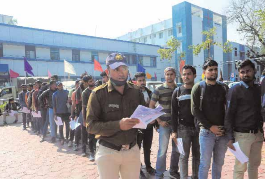
Qualified candidates in the written exam for police constable recruitment wait to get their medical check up at Government JP hospital in Bhopal on Tuesday.