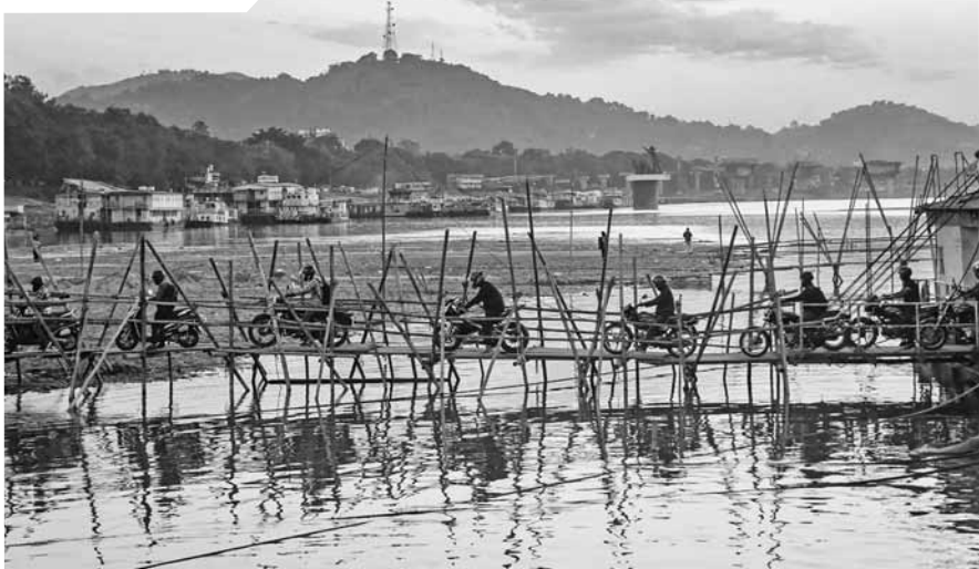
Two-wheeler riders cross on a bamboo bridge constructed over the River Brahmaputra, in Guwahati