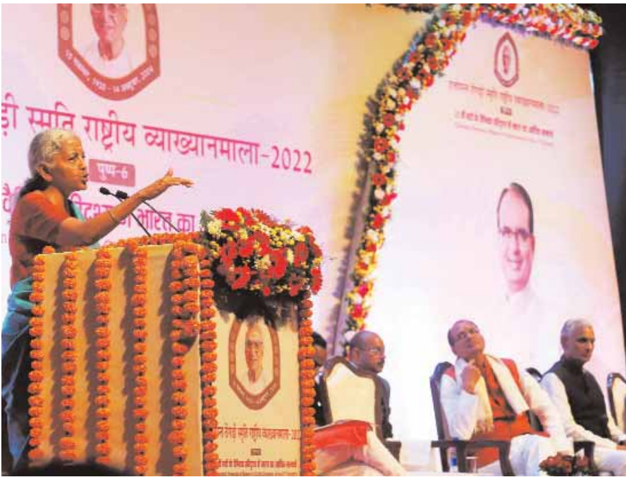
Union Finance Minister Nirmala Sitharaman speaks on "Economic Potential of India in Global Scenario of the 21st Century" during a lecture organised by Dattopant Thengadi Research Institute, at Ravindra Bhawan on Tuesday.