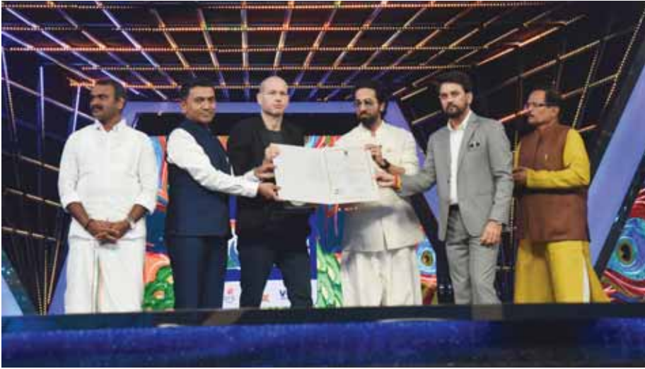
Israeli filmmaker and IFFI jury chairperson Nadav Lapid, third left, being honoured at the closing ceremony of the International Film Festival of India in Goa on Monday

"That felt to us like a propaganda, vulgar movie, inappropriate for an artistic competitive section of such a prestigious film festival," he said.