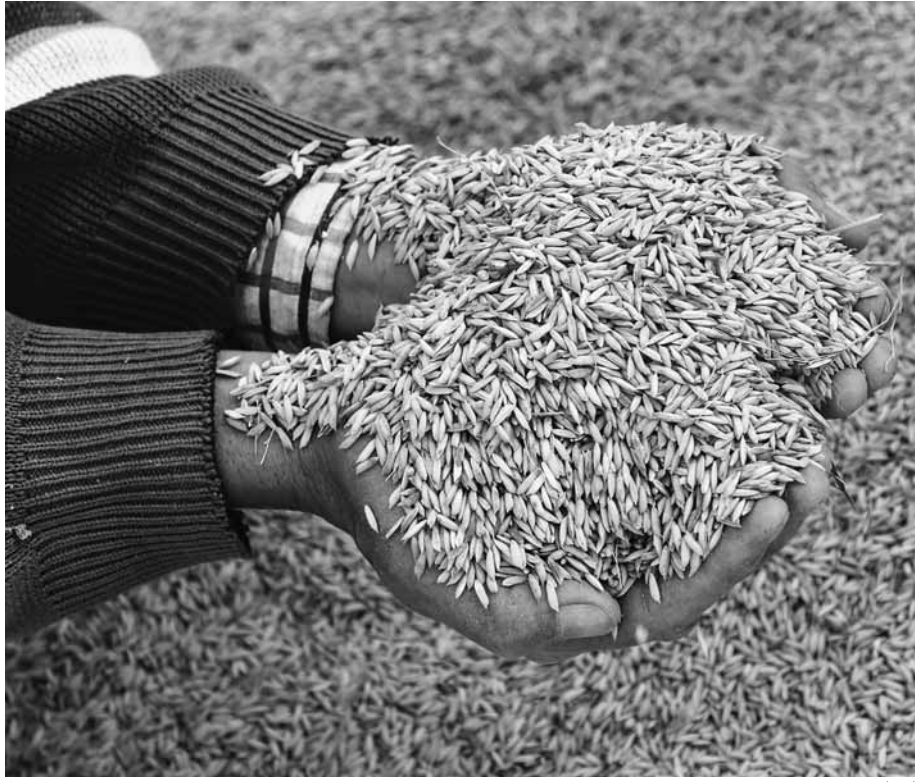
A labourer holds rice grain as he spreads it to dry, at a field on the outskirts of Jammu on Tuesday.