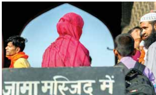
A woman leaves the Jama Masjid in New Delhi on Thursday. The administration of Jama Masjid had put up notices outside the main gates banning the entry of 'girls', whether alone or in groups

Earlier, the Jama Masjid also posted signs outside the