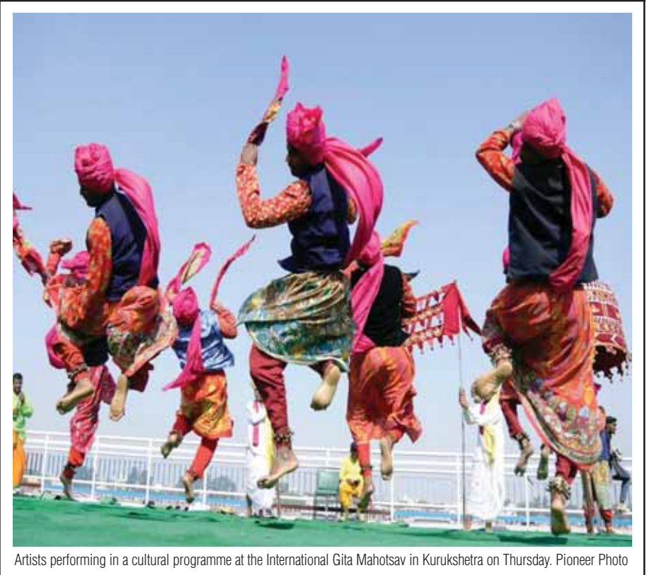
Artists performing in a cultural programme at the International Gita Mahotsav in Kurukshetra on Thursday.

Chandigarh: Nexus Elante Mall is hosting a 4-day Korea Fair to showcase the culture of Korea to its patrons. The mall has collaborated with the Embassy of the Republic of Korea and the Korea Trade Investment Promotion Agency (KOTRA) to offer unique experience to the visitors from 24th to 27th November. The exhibition has been organized in the main atrium at the mall. The exhibition was inaugurated by Korean Ambassador to India,