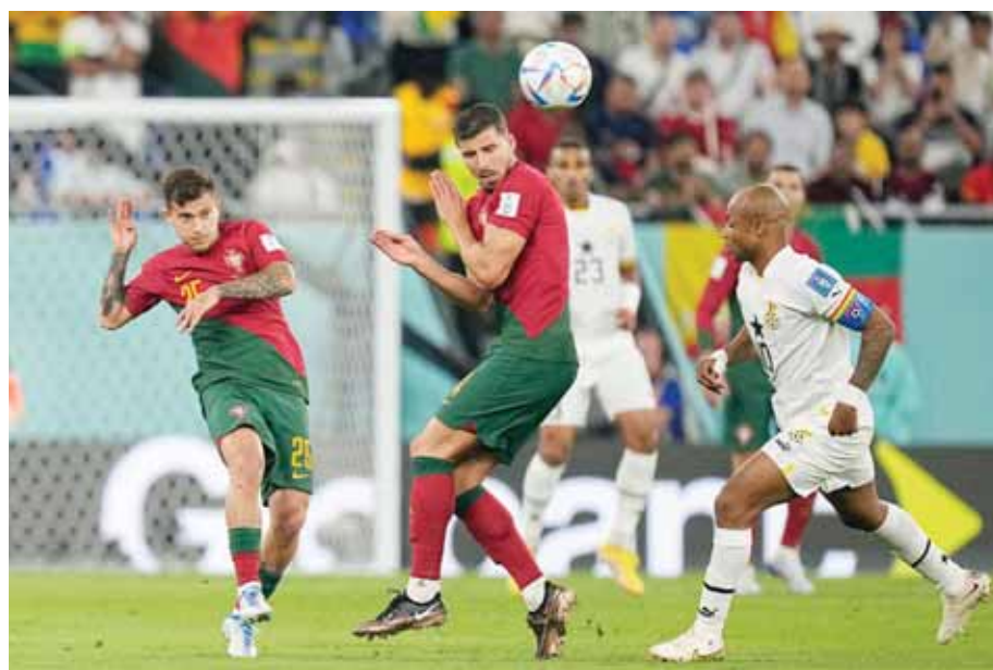
Portugal's Otavio, left, chases the ball during the World Cup group H soccer match between Portugal and Ghana, at the Stadium 974 in Doha on Thursday