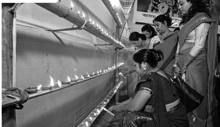
People light earthen lamps on 400th birth anniversary of Ahom Commander Lachit Borphukan in Nagaon