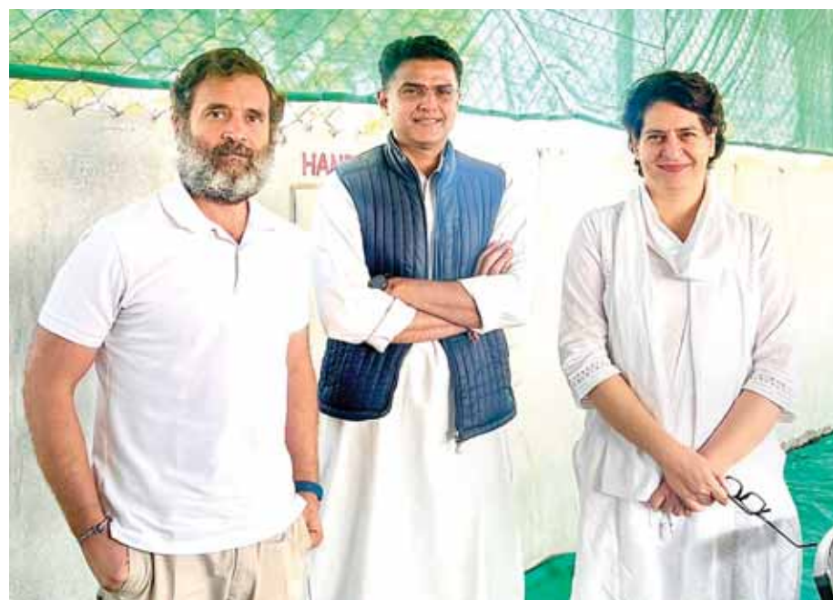
Congress leader Rahul Gandhi with his sister and the party's general secretary Priyanka Gandhi Vadra and party leader Sachin Pilot during the Bharat Jodo Yatra in Khandwa in Madhya Pradesh on Thursday

This is the second time in a month that Gehlot vented his anger against Pilot in public. But today he virtually challenged the high command by indicating he would not accept Pilot as his replacement at any