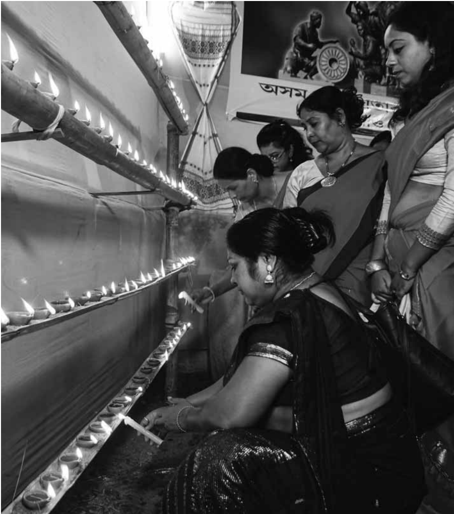
People light earthen lamps as part of celebrations for 400th birth anniversary of Ahom Commander Lachit Borphukan in Nagaon district on Thursday

Tension brewed in border areas in the aftermath of the incident, with an Assam forest office being burnt down by angry villagers as well as some vehicles from neighbouring states.