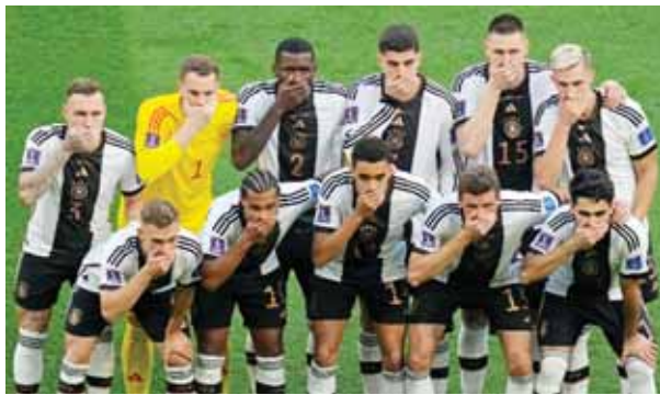
Germany's soccer team players cover their mouths as they pose for a group photo before the World Cup group E soccer match between Germany and Japan, at the Khalifa International Stadium in Doha on Wednesday

The match was played a day after Argentina's 2-1