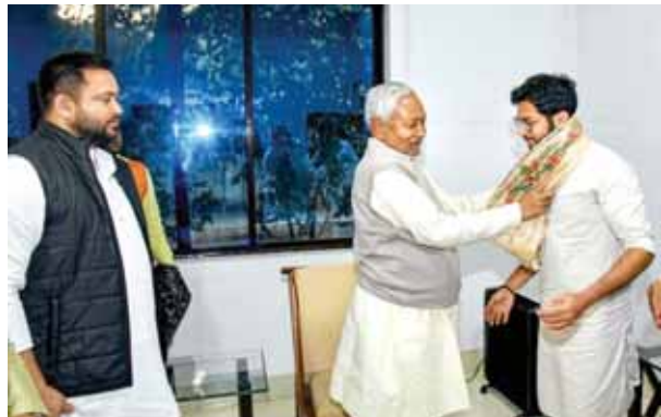
Bihar Chief Minister Nitish Kumar presents a 'shawl' to Shiv Sena (Uddhav Balasaheb Thackeray) leader Aaditya Thackeray during a meeting, in Patna on Wednesday. Bihar Deputy Chief Minister Tejashwi Yadav is also seen

after the meeting, Aaditya said, "We've been in touch with each other but could not meet due to Covid. We discussed various topics but did not discuss politics. Sure this friendship will continue."