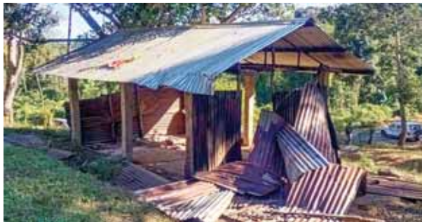
Remains of a temple after it was vandalised by miscreants following violence at a disputed Assam-Meghalaya border location that killed six people, in West Karbi Anglong district, on Wednesday

Mukroh village, 30 km east of West Jaintia Hills district headquarters of Jowai, is located around 10 km from the interstate border inside