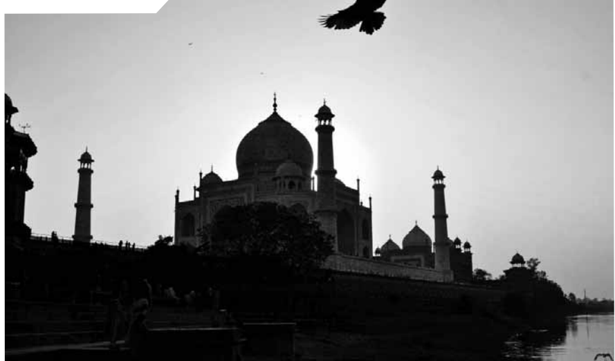
Taj Mahal during sunset in Agra,