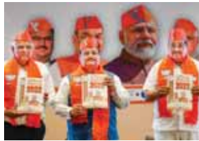
Gujarat Chief Minister Bhupendra Patel, BJP national president JP Nadda and State party chief CR Patil during release of the party manifesto for Gujarat polls, in Gandhinagar, on Saturday

Setting up an anti-radicalisation cell is another promise of the BJP.