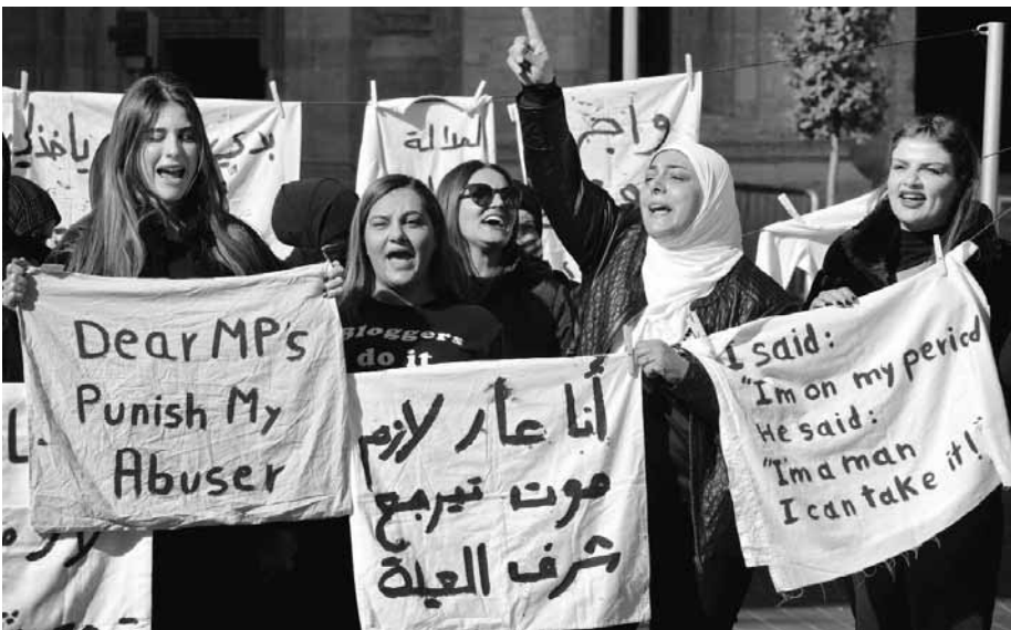
Activists from Lebanese NGO Abaad and sex abuse survivors chant slogans during a protest against sexual harassment, rape and domestic violence, in front of parliament building in Beirut: downtown Beirut, Lebanon on Saturday. The activists are protesting a Lebanese law that allows a rapist to get away with his crime if he marries the survivor. The law, in place since late 1940s. The Arabic banner, center, reads: "I am a disgrace, I should die so my family can retain their honor."

military wing of the elite Revolutionary Guard, and reiterated unsupported claims that protesters demonstrating countrywide are "tools" of the U.S. And its "mercenaries." "(The) Basij should not forget that the main clash is with global arrogance, or the U.S.," Khamenei said in address marking Basij week in Iran. (AP)