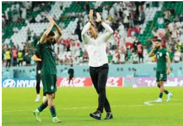
Saudi Arabia players and their head coach Herve Renard applaud fans at the end of the World Cup soccer match against Poland, at the Education City Stadium in Al Rayyan, Qatar, on Saturday. Poland beat Saudis 2-0

start even with the Arabic language. Spoken Arabic changes regionally, with the Berber-infused Arabic of North Africa, the rapid-fire Egyptian heard in movies and television comedies, the soft Levantine drawl and the guttural dialect of the Gulf Arabs.