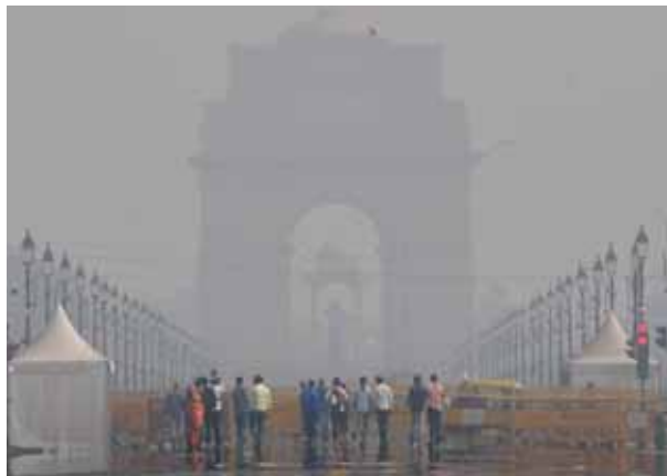
A fuzzy sight of India Gate amid heavy smog in New Delhi on Sunday

However, the Ghaziabad administration ordered to ban all private construction activities and close schools due to worsening air pollution.