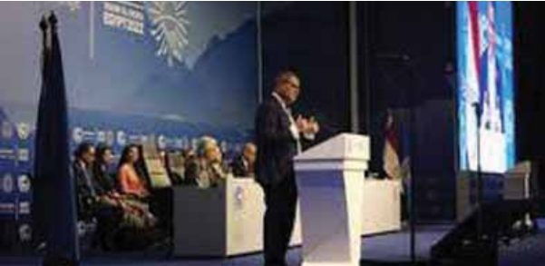
Damage’ at COP27,” the minister said.

“India welcomes adoption of agenda item ‘Loss and