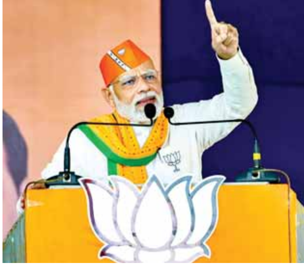
Prime Minister Narendra Modi addresses during a BJP election campaign rally for Gujarat Assembly elections, in Valsad on Sunday

"Whoever had tried to defame and insult Gujarat in the past have been wiped out of Gujarat by the people. In this election too, such people will