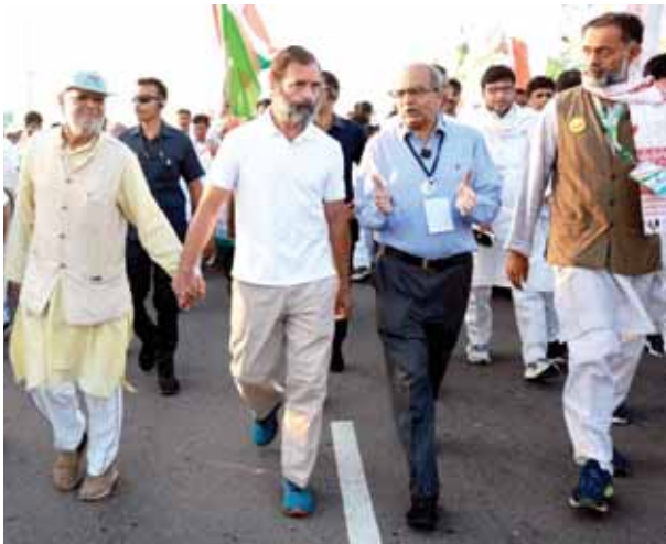
Congress leader Rahul Gandhi with lawyer Prashant Bhushan and activist Yogendra Yadav during the party's 'Bharat Jodo Yatra' in Medak district on Sunday

Elections to the 182-member Gujarat Assembly will be held in two phases on December 1 and 5 and the