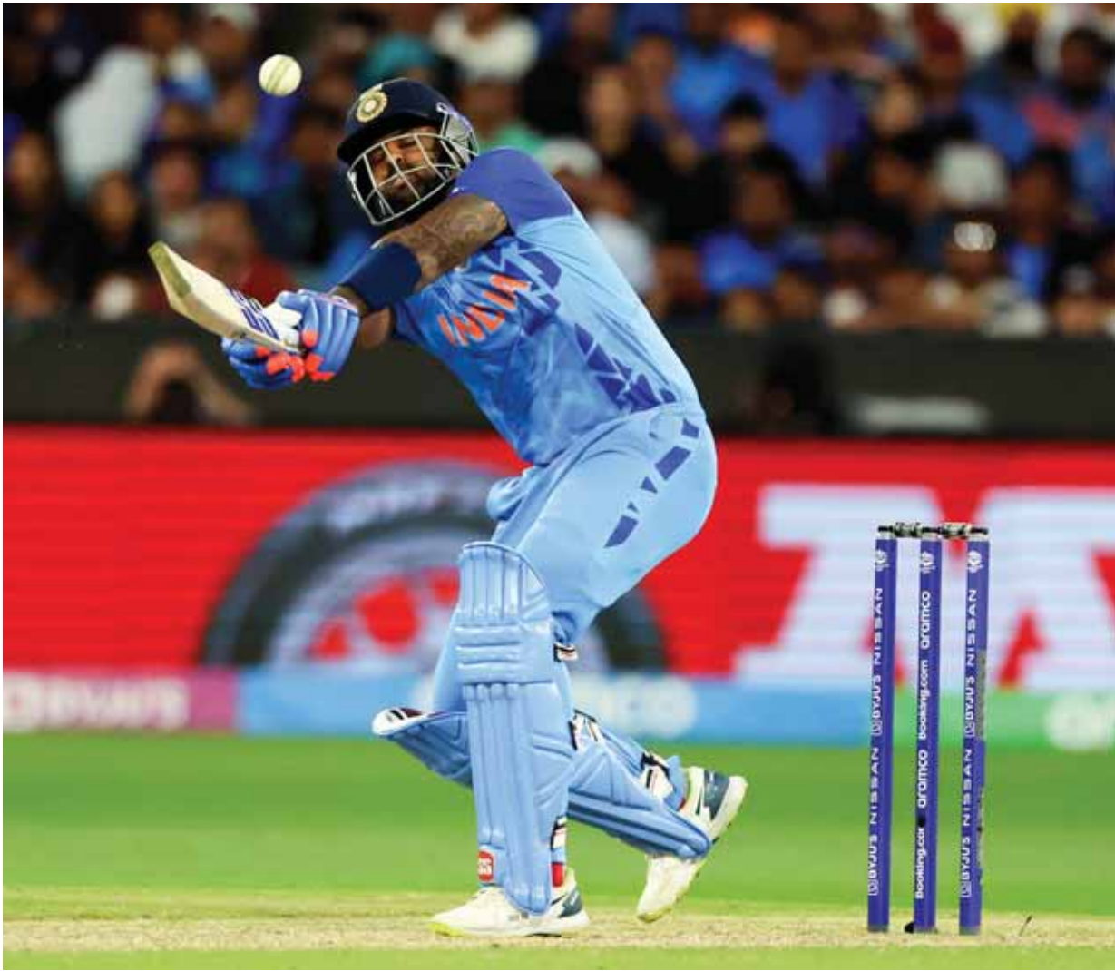
Suryakumar Yadav bats during the T20 World Cup cricket match between India and Zimbabwe in Melbourne, Australia, on Sunday. Suryakumar reaffirmed his status as a short-format magician with another magnificent effort as India crushed Zimbabwe by 71 runs to set up a T20 World Cup semifinal date with the mighty England. Surya, who has matched the peerless Virat Kohli stroke-for-stroke in this World Cup, smashed an unbeaten 61 off 25 balls in India's imposing total of 186 for 5. Zimbabwe's batting depth was never enough to surpass that score and they were shot out for 115 in 17.2 overs with Ravichandran Ashwin (3/22) enjoying a good day at the office