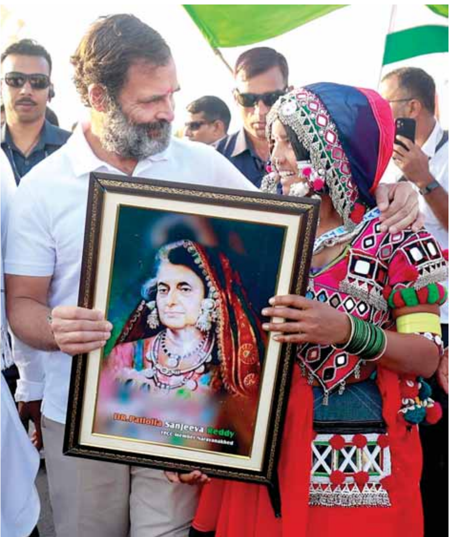
Congress leader Rahul Gandhi with supporters during "Bharat Jodo Yatra" in Medak district

"You only remember lotus. I have come to you with lotus. When you go to vote and see lotus, you should know that the BJP and Modi have come to you. Your every vote to lotus, will be your blessings to Modi," he had said.