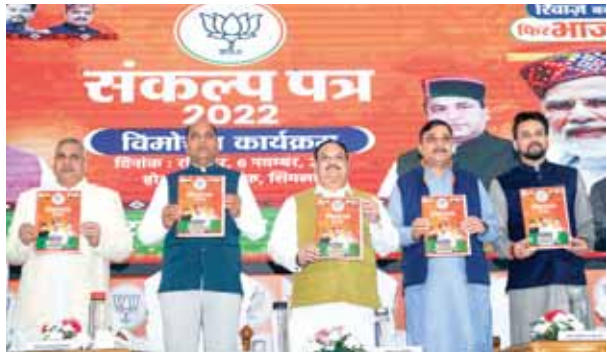
BJP national president JP Nadda, along with Union Minister Anurag Thakur, Himachal Pradesh Chief Minister Jai Ram Thakur and others, releases BJP's manifesto for the upcoming Himachal Pradesh Assembly elections, in Shimla on Sunday

For girl students from Class 6 to Class 12, a bicycle will be given to each to go to school. In every district, two girls' hostels would be set up.