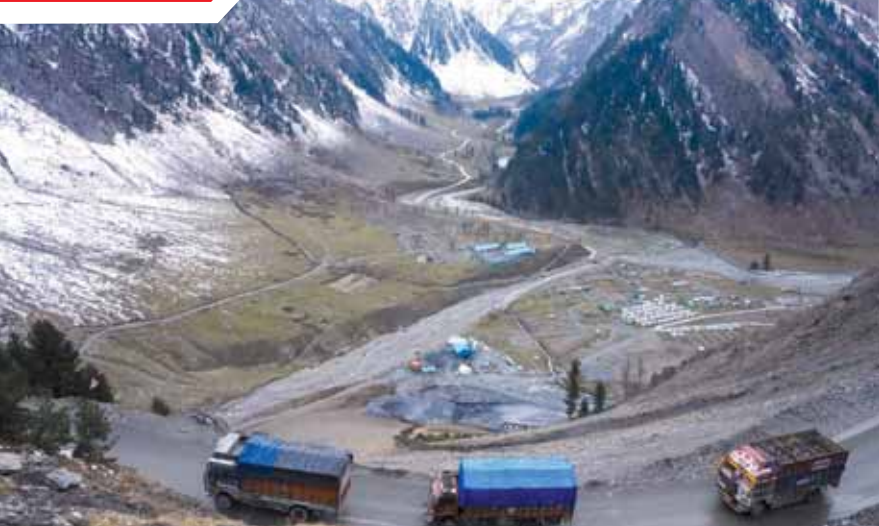
Vehicles cross the Zojila Pass after a fresh spell of snowfall in Sonamarg, Ganderbal district