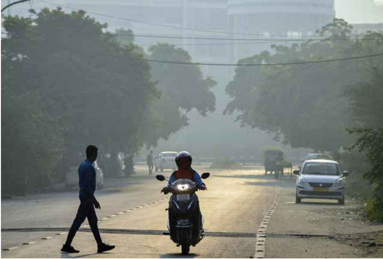
A person rides a scooter on a road amid low visibility due to a thick layer of smog, in Gurugram on Sunday

Delhi Environment Minister Gopal Rai will chair a high-level meeting Monday to discuss the new directions by the Centre's air quality panel about revoking curbs imposed under the final stage of Graded Response Action Plan (GRAP). Sources in the Government said that a decision on reopening primary schools and revocation of order asking 50 per cent of the Government staff to work from home is likely to be taken at the meeting. Sources further added that as the curbs have been lifted now the government may allow to run diesel cars that are not BS VI compliant on Delhi roads again, trucks carrying non-essential items can enter the city and commercial goods vehicles carrying non-essentials items can run inside the city. As Delhi's air quality index spiralled to 450, just a notch short of the 'severe plus' category, on Thursday, the Commission of Air Quality Management had directed authorities to ban the plying of non-BS VI diesel light motor vehicles in the city and adjoining NCR districts and the entry of trucks into the national capital as part of anti-pollution measures under stage IV of GRAP. The restrictions were imposed three days ago. The