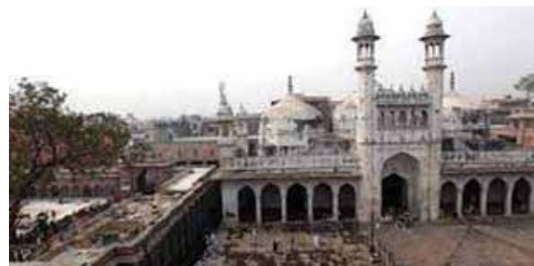
PIONEER NEWS SERVICE ■ NEW DELHI

The Supreme Court agreed to set up a Bench on Friday to hear the Gyanvapi-Kashi Vishwanath case in which the Hindu side has sought extension of an order by which protection of an area where a "Shivling" was found in Gyanvapi premises was ordered.