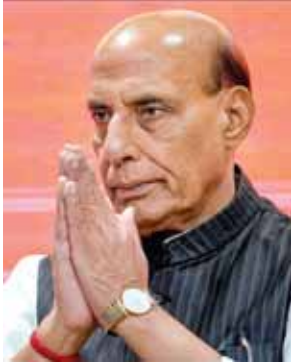
Defence Minister Rajnath Singh during the convocation ceremony of National Defence College, in New Delhi on Thursday

fuelled an energy crisis in the world. In Europe, oil and gas supply has been dwindling. India has also been affected as the Russia-Ukraine war led to a disruption in international energy supply, making the energy import much more expensive," he said.