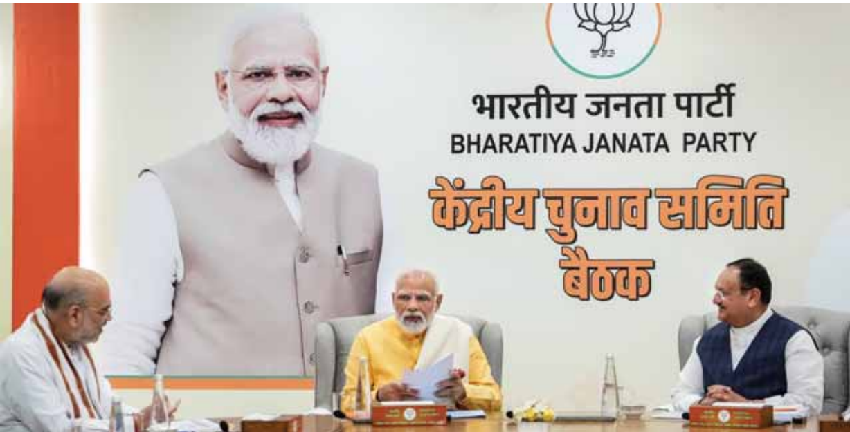
Prime Minister Narendra Modi with Union Home Minister Amit Shah and BJP national president JP Nadda during the Central Election Committee meeting of the BJP, at the party headquarters in New Delhi on Wednesday

New Delhi: NSA Ajit Doval has been conferred with the 'Scroll of Honour' by the NDC. Doval received the award when he visited the institute in the national Capital on Wednesday. He is an alumnus of the NDC. Doval spoke on the subject 'India@2050: Potential & Relevance'. PNS