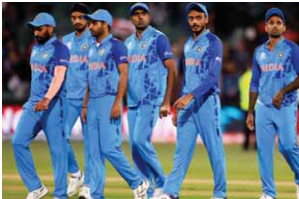
Indian players walk from the field after the T20 World Cup cricket semifinal between England and India in Adelaide, Australia, on Thursday. England defeated India by ten wickets