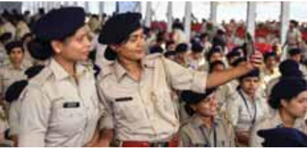
Newly appointed police personnel click a selfie during their appointment letters distribution function, at Gandhi Maidan in Patna on Wednesday

The chief minister said the overall appointment process in police force need to be accel-