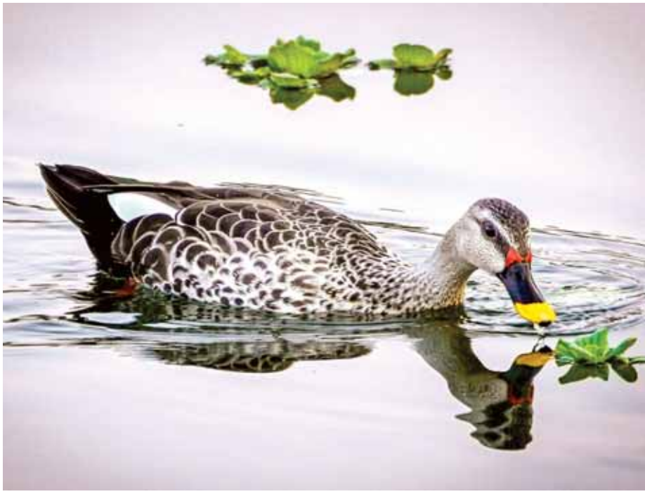
A spot-billed duck swims in the Ana Sagar Lake in Ajmer on Wednesday

In a tweet on Wednesday, Mayawati said, “The concern of the BJP and RSS towards the Pasmanda Muslim community is a new deceit. Their thinking, intention and outlook towards the community is not hidden from anyone. The BJP held a Labharthi Sammelan, attended by Pasmanda Muslims, last week ahead of the by-elections to the assembly constituency in Rampur. “The result of the BJP’s negative outlook towards the Muslim community is that even under their government, they are still as poor and backward as in Congress rule,” Mayawati said in another tweet.