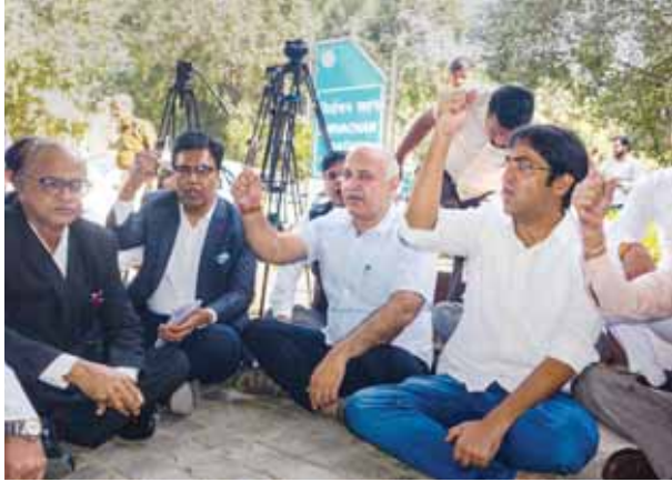
Delhi Deputy Chief Minister and AAP leader Manish Sisodia with supporters raises slogans during a protest outside the Election Commission of India's office, at Nirvachan Sadan in New Delhi on Wednesday