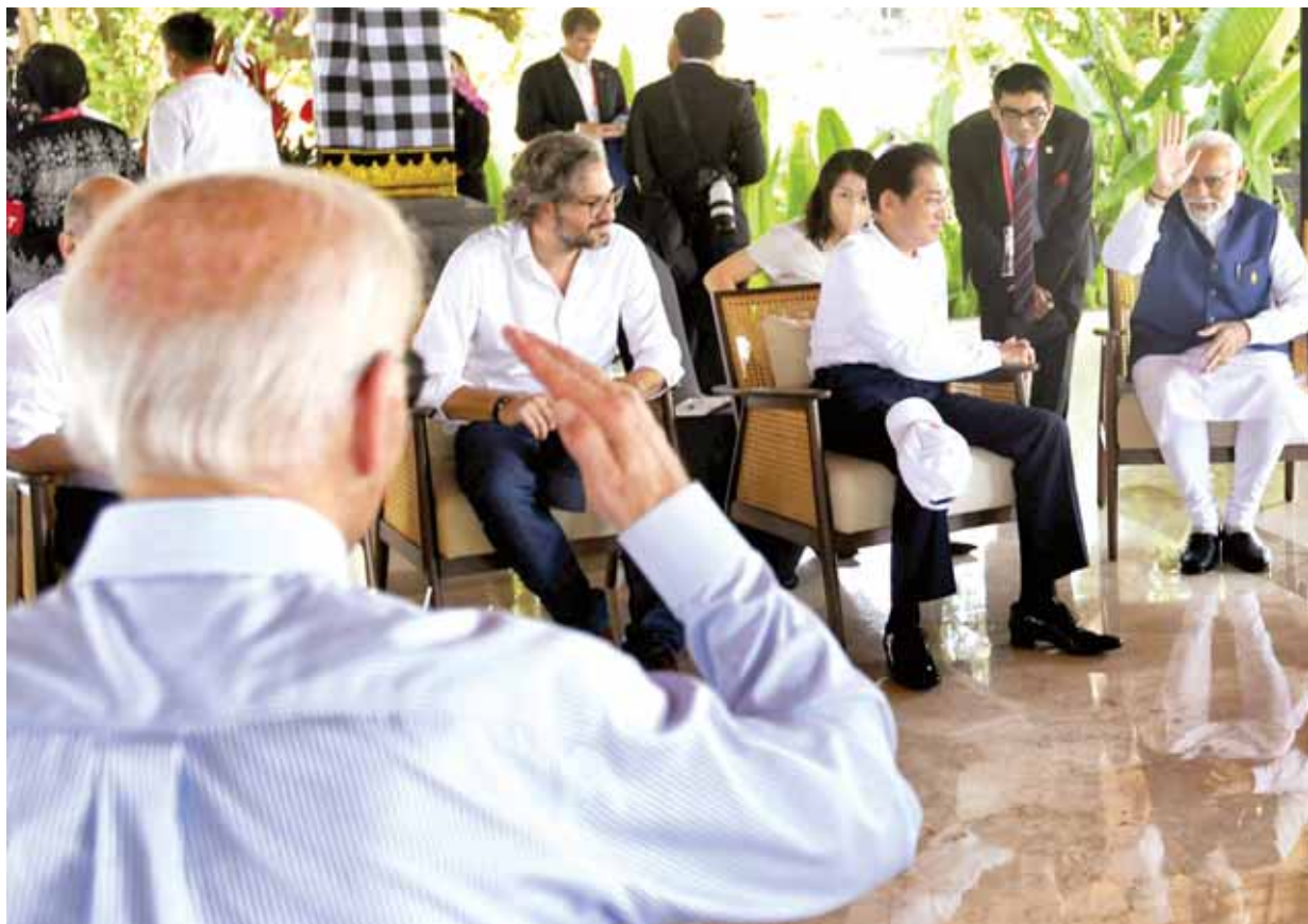
Prime Minister Narendra Modi and US President Joe Biden exchange greetings during an event at the Taman Hutan Raya Ngurah Rai Mangrove Forest, on the sidelines of the G20 Summit, in Bali on Wednesday

"Naturally, the outcome document was being negotiated in a particular global context and that global context did find mention in the outcome document also during negotiations, and there I would say the Prime Minister's message that this is not the era of war, and the best way to return to the path of dialogue and diplomacy, to resolve the conflict resonated very deeply across all the delegations and helped bridge the gap across different parties and contributed to the successful outcome of the document."