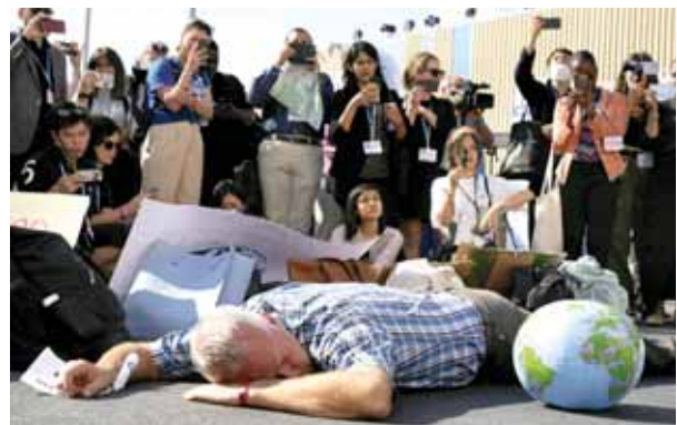
A demonstrator participates in a 'die-in' advocating for the 1.5 degree warming goal to survive at the COP27 UN Climate Summit in Sharm el-Sheikh, Egypt, on Wednesday