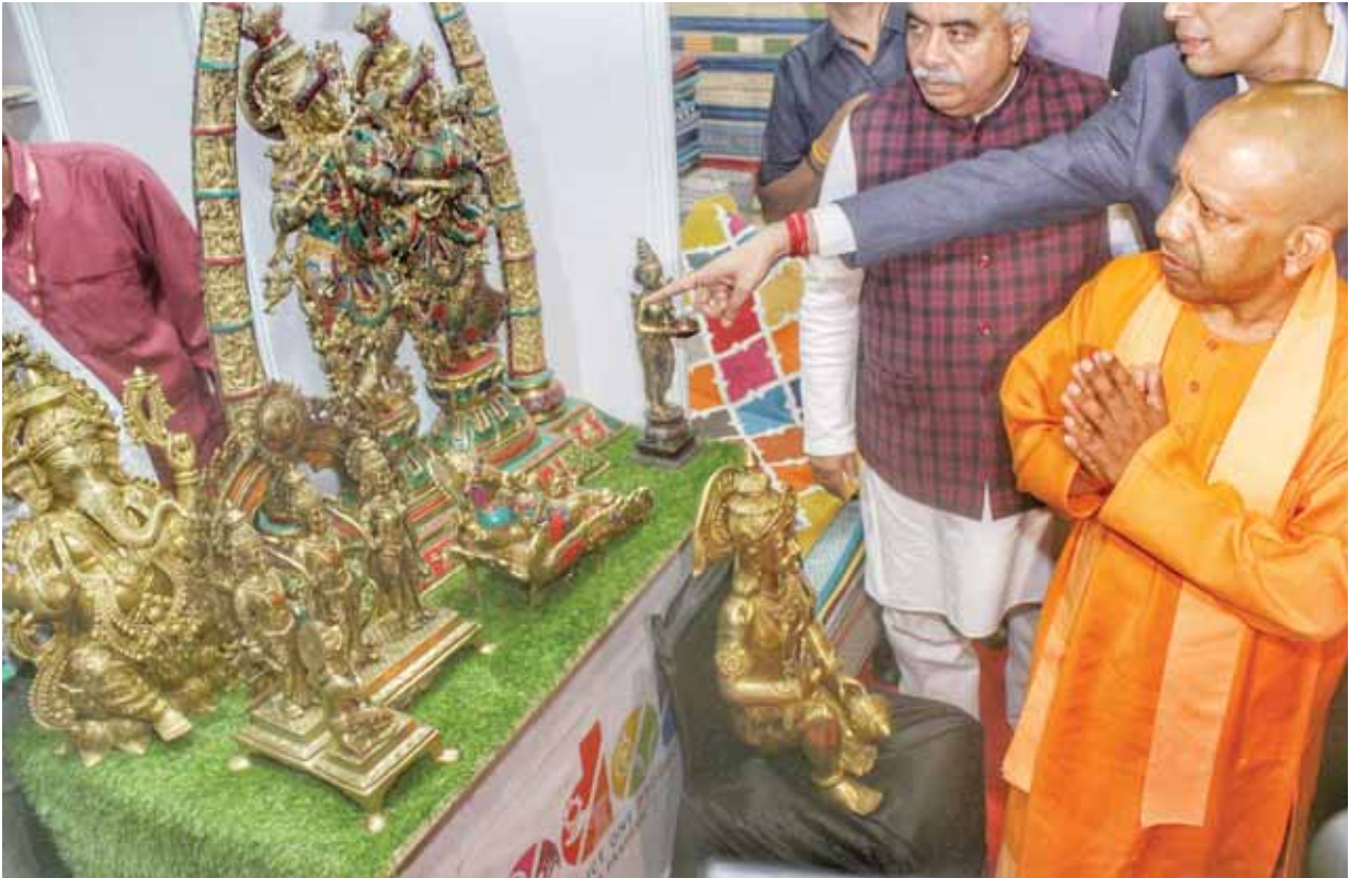
Uttar Pradesh Chief Minister Yogi Adityanath inaugurated the State's stall at the 41st India International Trade Fair (IITF) at Pragati Maidan, in New Delhi on Wednesday

Sources added that the Lokayukta had time and again pointed out that "most importantly the Lokayukta in Delhi is not provided with any investigating agency and a single man posted as Assistant Director (Investigation) is the only means of investigation available with the Delhi Lokayukta."