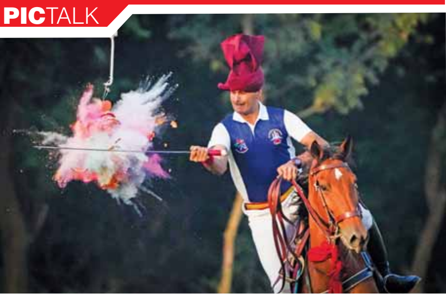
A President's Body Guard performs a stunt after the President's Polo Cup exhibition match, in New Delhi