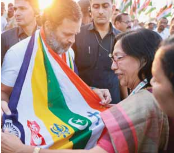
Congress leader Rahul Gandhi with supporters during the party's 'Bharat Jodo Yatra', in Washim district on Wednesday