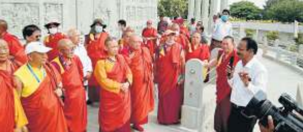
Bhutanese Buddhist monks visiting Bhuddhavanam in Nagarjunasagar on Thursday