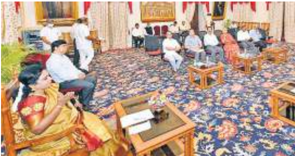
Governor Dr Tamilisai Soundararajan interacting with eminent medical professionals on health issues and initiatives at Raj Bhavan on Thursday

Highlighting the importance of sustained initiatives to prevent