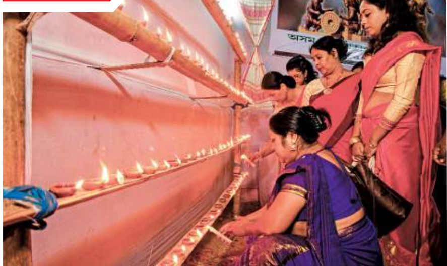
People light earthen lamps on 400th birth anniversary of Ahom Commander Lachit Borphukan in Nagaon