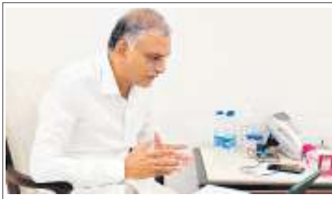
Minister for Health T Harish Rao launching TIFFA scanning machines virtually in Hyderabad on Saturday

"With the efforts of the medical staff, TIFFA were established in the hospitals within two months. They worked with the aim of providing free scanning services to pregnant women for regular monitoring". (Targeted Imaging for Fetal Anomalies Scan) helps in detecting defects in the unborn child while still in the womb. There are already 155 ultra sound scanning machines in government hospitals. An average of 11,000 to 12,000 tests are conducted per month.