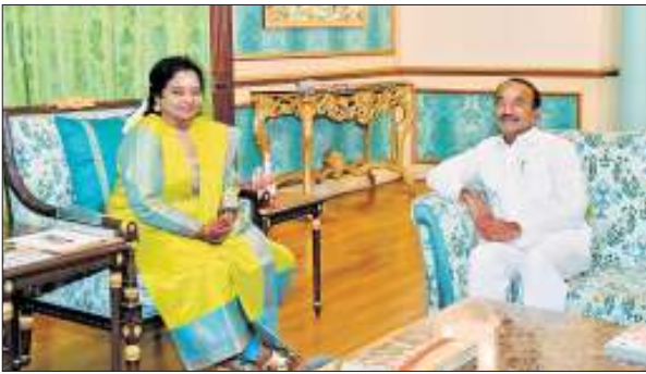
BJP MLA Eatala Rajender meeting with Governor Tamilisai Soundararajan in Hyderabad on Saturday

dition of holding review meetings with all departments before introducing the budget, be it the Central government or the State government. The