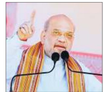
Participating in Times Now Summit-2022 held in New Delhi

er of democracy is strengthening its ancient ideals and the spirit of the Constitution, and pro-people policies are empowering the poor and women of the country. "The first three words of the Preamble of the Constitution 'We the people' are a call, trust and oath. This spirit of the Constitution is the spirit of India that has been the mother of democracy in the world. In the modern time, the Constitution has embraced all the cultural and moral emotions of the nation," Modi said. The prime minister said that defying initial apprehensions about its stability, India is moving ahead with full force and taking pride in its diversity.