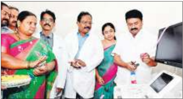
Minister for Animal Husbandry Talasani Srinivas Yadav inaugurating tiff scan at Gandhi Hospital on Saturday

He said that 56 Tiffa scan machines have been procured at a cost of Rs 20 crore and installed in various government hospitals across the state on a single day on Saturday. The machines help detect the lacunae in devel-