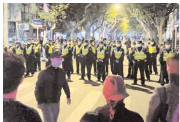
Chinese police officers block off access to a site where protesters had gathered in Shanghai on Sunday