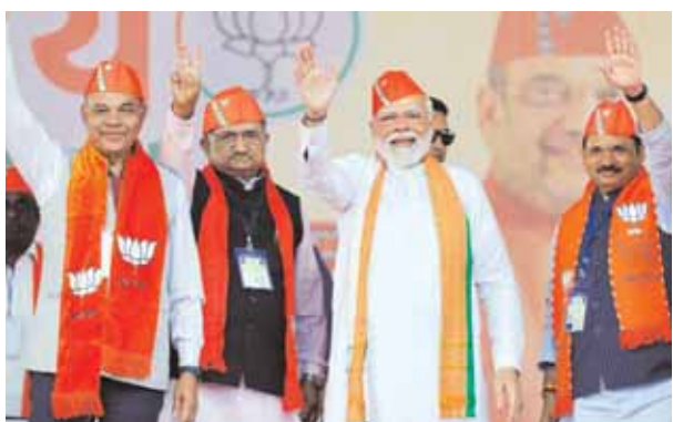
Prime Minister Narendra Modi with other BJP leaders waves at supporters at a rally ahead of the Gujarat Assembly elections, in Kheda district on Sunday

"Gujarat and the country need to be wary of the Congress and like-minded parties, which keep mum on big terror attacks for their vote-bank politics. Gujarat had for a long time been a target of terrorism. People of Gujarat were killed in explosions in Surat and Ahmedabad. Congress was