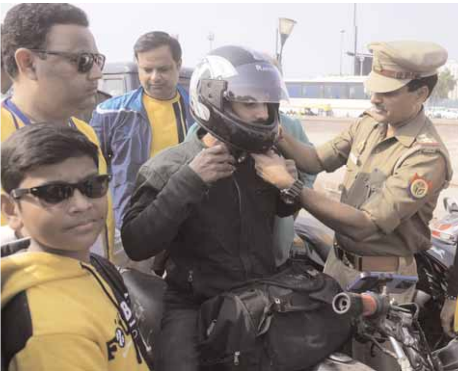
A traffic policeman makes a biker wear helmet at Hazratgani in Lucknow on Sunday

Lucknow (PNS): Aam Aadmi Party leader Sanjay Singh asked the Union government why the fuel price had been kept high when crude oil price had depreciated in the international market. Singh said there was a price drop in crude oil for the last 10 months but the government had not lowered fuel prices in the country. "The crude oil price is 89 dollar per barrel presently and will touch 70 dollar figure in the months to come in view of the current global political situation. But the public is not getting benefit of the drop in crude oil price. The oil companies and Petroleum ministry are silent on the issue," he said. He was reacting to reports of the alleged fuel theft in LMC. Singh said corruption was deep rooted in the municipal corporations and BJP leaders, corporators and municipal corporation officials were behind it.