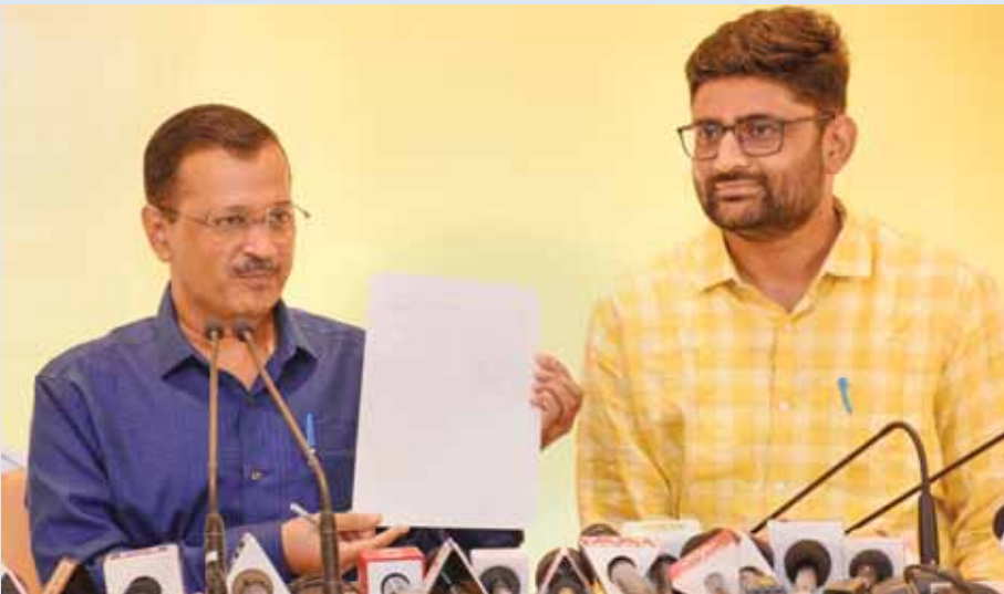
Delhi Chief Minister and Aam Aadmi Party National Convener Arvind Kejriwal addresses a press conference, in Surat, Sunday

The common man is scared. Second, the Congress voters are nowhere to be found, and third, the BJP supporters are going to vote for the AAP in large numbers,” he further claimed.