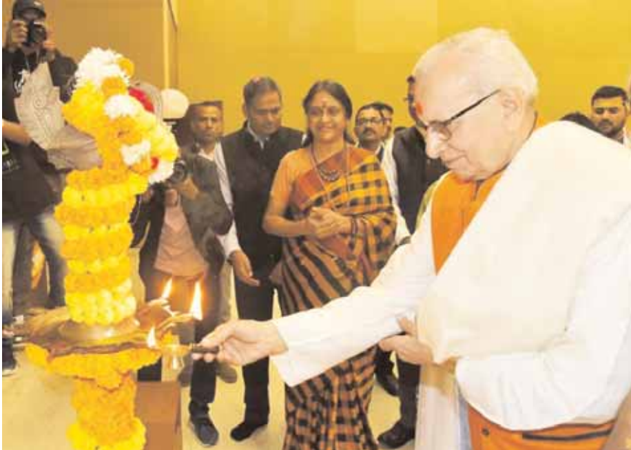
A programme under Kashi Tamil Sangamam being inaugurated at Shri Kashi Vishwanath Dham in Varanasi on Sunday.