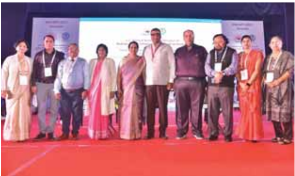
Concluding function of IAPP conference being held in Varanasi on Sunday.