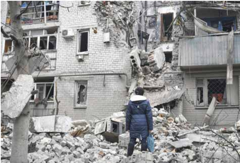
A woman stands among debris of the destroyed house after recent Russian air strike in Chasiv Yar, Ukraine on Sunday. Shelling by Russian forces struck several areas in eastern and southern Ukraine overnight as utility crews continued a scramble to restore power, water and heating following widespread strikes in recent weeks, officials said on Sunday.

grid operator, said Sunday that electricity producers are now supplying about 80% of demand. That's an improvement from Saturday's 75%, the company says.