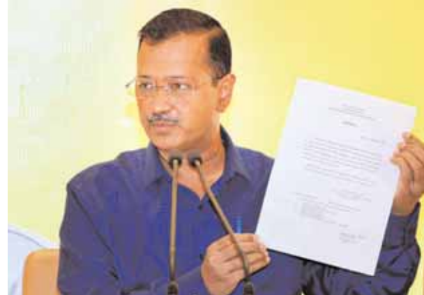
Delhi Chief Minister and Aam Aadmi Party National Convener Arvind Kejriwal addresses a press conference, in Surat on Sunday

"I am going to make a prediction in writing in front of you all. Note down the prediction that the AAP is going to form the Government in Gujarat. After 27 years of misgovernance, the citizens of Gujarat will get relief from these people (BJP)," Kejriwal, AAP's national convener, told media persons in a press conference. He then wrote his prediction on a piece of paper and showed it to media persons and said his predictions for the Delhi and Punjab Assembly elections came true, and the same will happen for Gujarat as well. He claimed people are so