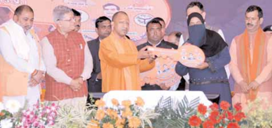
Chief Minister Yogi Adityanath giving the key to a beneficiary of a government scheme in Ayodhya

"Prime Minister Modi's arrival in Deepotsava shows his loyalty and dedication to Ayodhya. The construction of the grand Ram temple is the