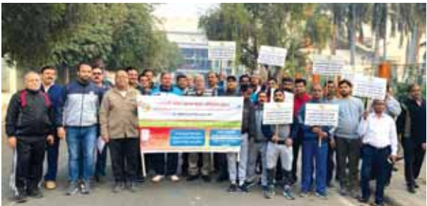
Bank of Baroda taking out awareness rally in Motijheel on Saturday.