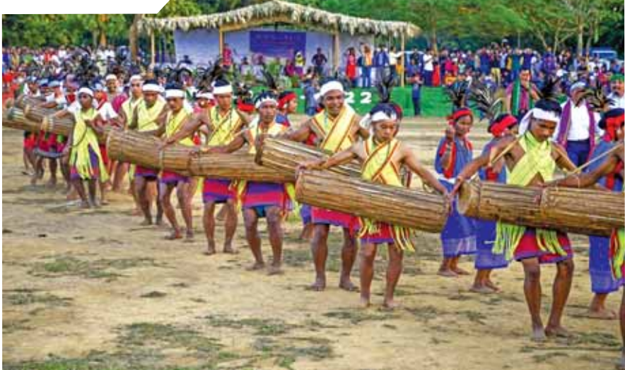
Artists perform a Garo traditional dance during Wangala festival at Chotipara, in Goalpara