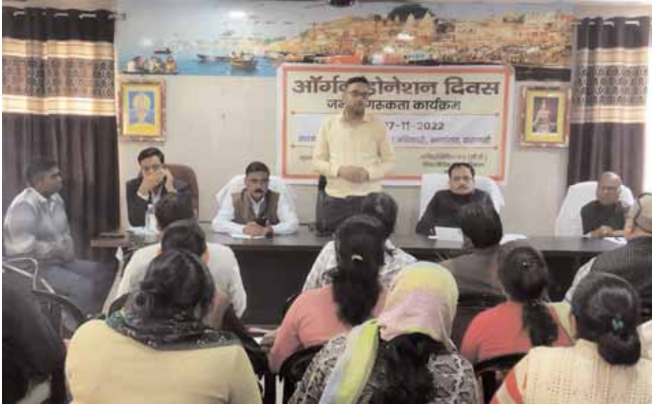
Seminar on organ donation being held in Varanasi on Sunday.