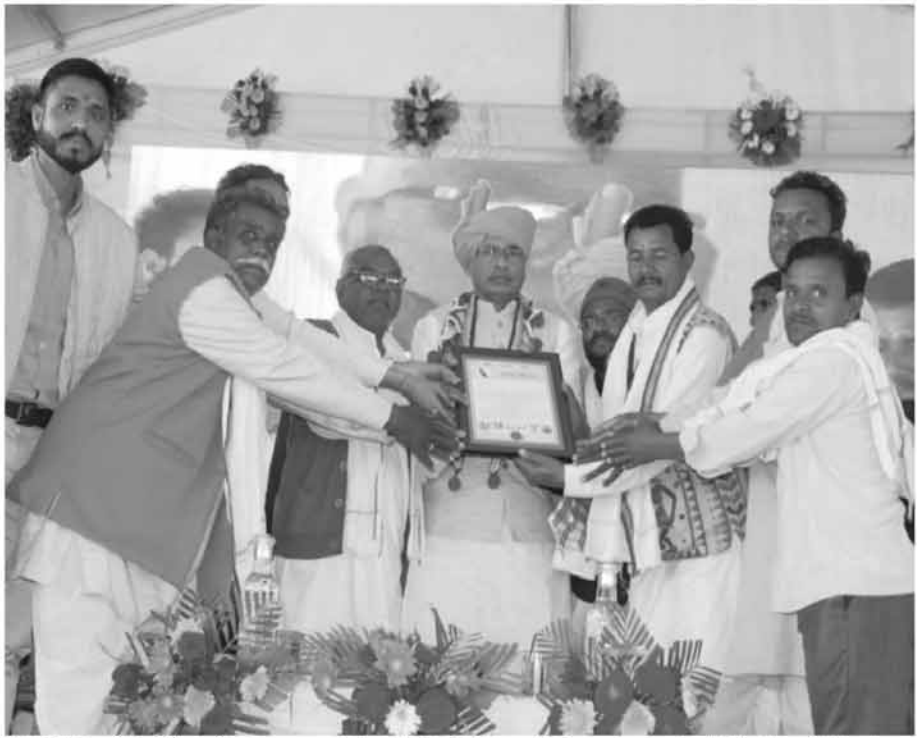
Chief Minister Shivraj Singh Chouhan was participated in the PESA Jagrukta Sammelan organised at Pandhana in Khandwa district on Wednesday.

Gram Sabha will take decisions related to fish farming, Singhada production and pond irrigation. The Gram Sabha will have the right to manage the pond for irrigation in 100 acres of agricultural area. The government will cooperate in this work as per the intention of the Gram Sabha. Whatever income is generated from the pond, will be given to the Gram Sabha. Chief Minister Chouhan said that the state government will no longer collect the forest produce grown in the forest bordering the village. Gram Sabha will do this work. According to PESA Act, now the Gram Sabha will determine the collection, sale and price of forest produce. The State government will cooperate on the recommendation of the Gram Sabha.