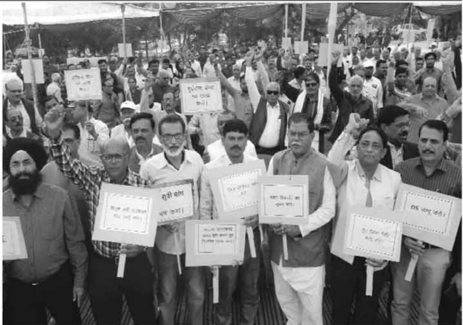
Employees of state electricity department under the banner of United Forum for Power Employees and Engineers stage a protest to oppose electricity amendment bill-2022 and privatisation in Bhopal on Wednesday.