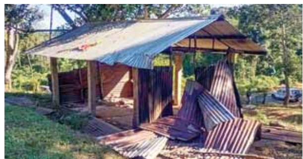
Remains of a temple after it was vandalised by miscreants following violence at a disputed Assam-Meghalaya border location that killed six people, in West Karbi Anglong district, on Wednesday

Mukroh village, 30 km east of West Jaintia Hills district headquarters of Jowai, is located around 10 km from the interstate border inside