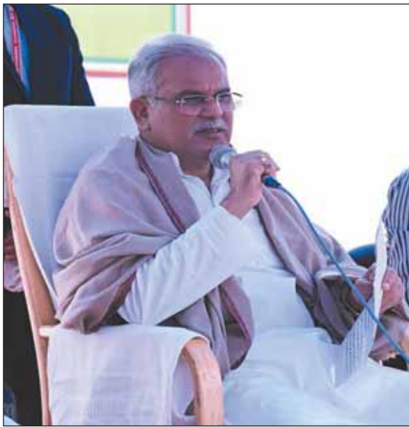
sought action taken vis-a-vis the Bengal Nagpur Cotton (BNC) Mill, which, officials said, belonged to the

"The production of fly ash bricks and poultry farming can also be promoted. Such activity will help large-scale employment generation"