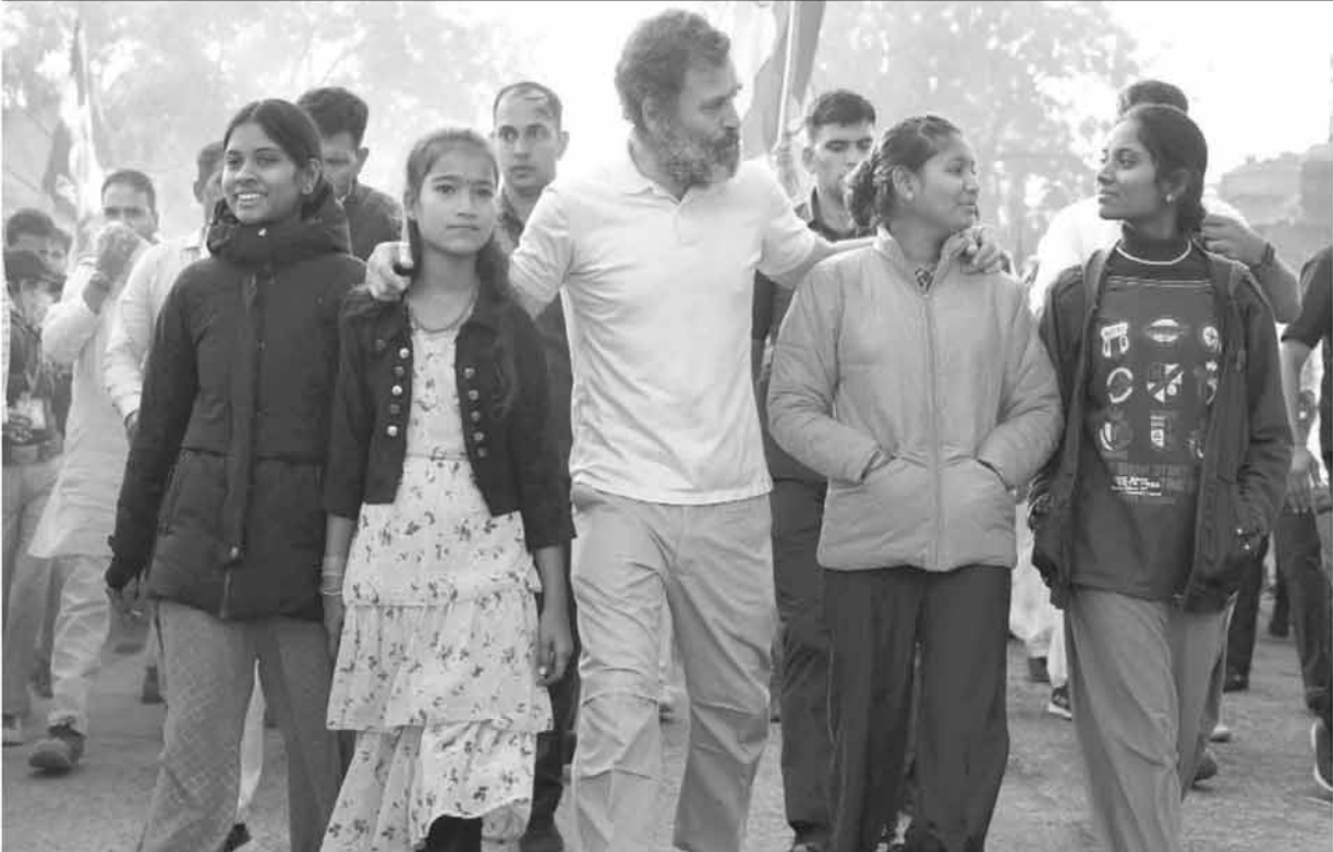
Congress leader Rahul Gandhi during the party's Bharat Jodo Yatra in Burhanpur district Madhya Pradesh on Wednesday.

with this, a fine of Rs 15,000 will be imposed on repetition of this crime. Meanwhile Medical examination of selected candidates in Madhya Pradesh Constable Recruitment Examination 2020 would be conducted on November 28. Units (Indore and Bhopal) have been allotted to 6000 candidates selected in the Madhya Pradesh Constable Recruitment Examination 2020. The list of units and instructions to the candidates can be seen at www.mppolice.gov.in. Candidates must compulsorily appear for medical examination in their allotted unit on November 28, 2022 (on the date given for Indore and Bhopal allotted units). If the candidate wants to present his side in any subject, he can send his representation by e-mail to 6000porex@mppolice.gov.i