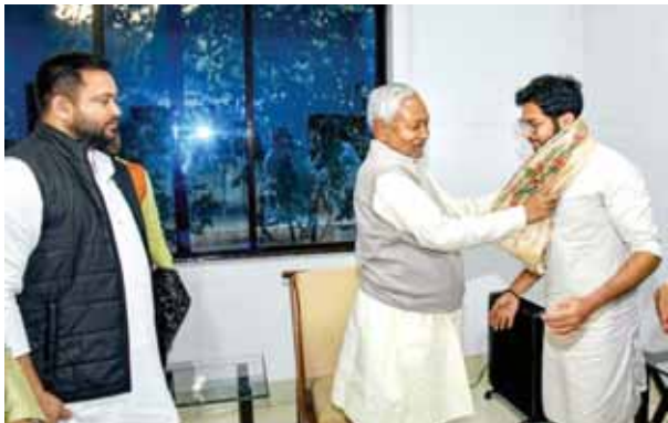
Bihar Chief Minister Nitish Kumar presents a 'shawl' to Shiv Sena (Uddhav Balasaheb Thackeray) leader Aaditya Thackeray during a meeting, in Patna on Wednesday. Bihar Deputy Chief Minister Tejashwi Yadav is also seen

after the meeting, Aaditya said, "We've been in touch with each other but could not meet due to Covid. We discussed various topics but did not discuss politics. Sure this friendship will continue."