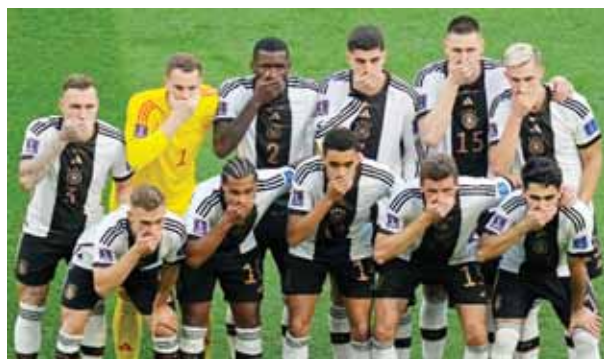
Germany's soccer team players cover their mouths as they pose for a group photo before the World Cup group E soccer match between Germany and Japan, at the Khalifa International Stadium in Doha on Wednesday

The match was played a day after Argentina's 2-1