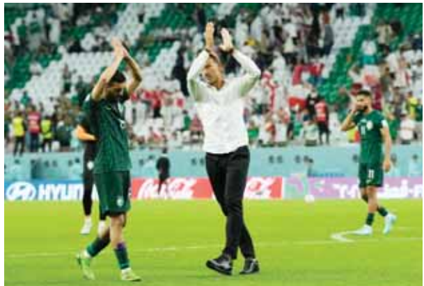
Saudi Arabia players and their head coach Herve Renard applaud fans at the end of the World Cup soccer match against Poland, at the Education City Stadium in Al Rayyan, Qatar, on Saturday. Poland beat Saudis 2-0

start even with the Arabic language. Spoken Arabic changes regionally, with the Berber-infused Arabic of North Africa, the rapid-fire Egyptian heard in movies and television comedies, the soft Levantine drawl and the guttural dialect of the Gulf Arabs.