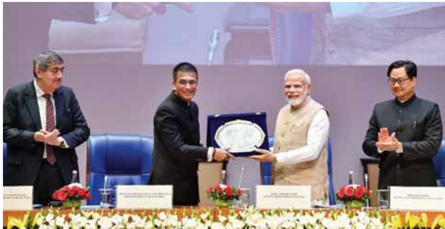
Prime Minister Narendra Modi with Chief Justice of India Justice DY Chandrachud at the launch of the new initiatives under e-court project, during the Constitution Day celebrations in the Supreme Court, in New Delhi on Saturday. Union Law Minister Kiren Rijiju is also seen

Modi launched new initiatives under the e-court project, which provides services to lit-