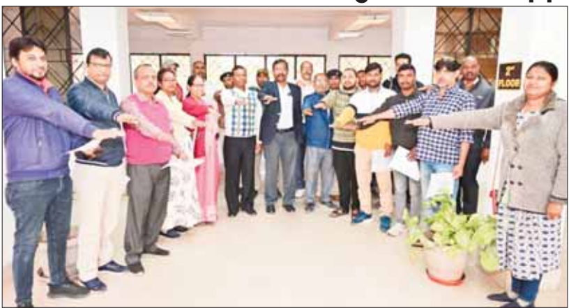
IPRD officers and staff during Constitution Day celebrations in Ranchi on Saturday. Constitution Day is observed on Nov 26.