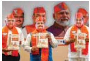
Gujarat Chief Minister Bhupendra Patel, BJP national president JP Nadda and State party chief CR Patil during release of the party manifesto for Gujarat polls, in Gandhinagar, on Saturday

Setting up an anti-radicalisation cell is another promise of the BJP.