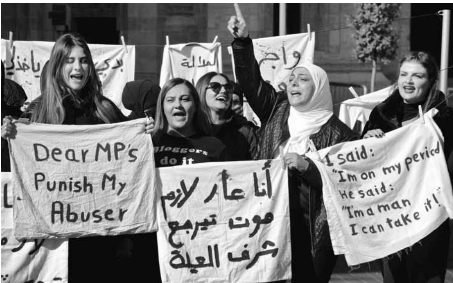
Activists from Lebanese NGO Abaad and sex abuse survivors chant slogans during a protest against sexual harassment, rape and domestic violence, in front of parliament building in Beirut: downtown Beirut, Lebanon on Saturday. The activists are protesting a Lebanese law that allows a rapist to get away with his crime if he marries the survivor. The law, in place since late 1940s. The Arabic banner, center, reads: "I am a disgrace, I should die so my family can retain their honor."

military wing of the elite Revolutionary Guard, and reiterated unsupported claims that protesters demonstrating countrywide are "tools" of the U.S. And its "mercenaries." "(The) Basij should not forget that the main clash is with global arrogance, or the U.S.," Khamenei said in address marking Basij week in Iran. (AP)