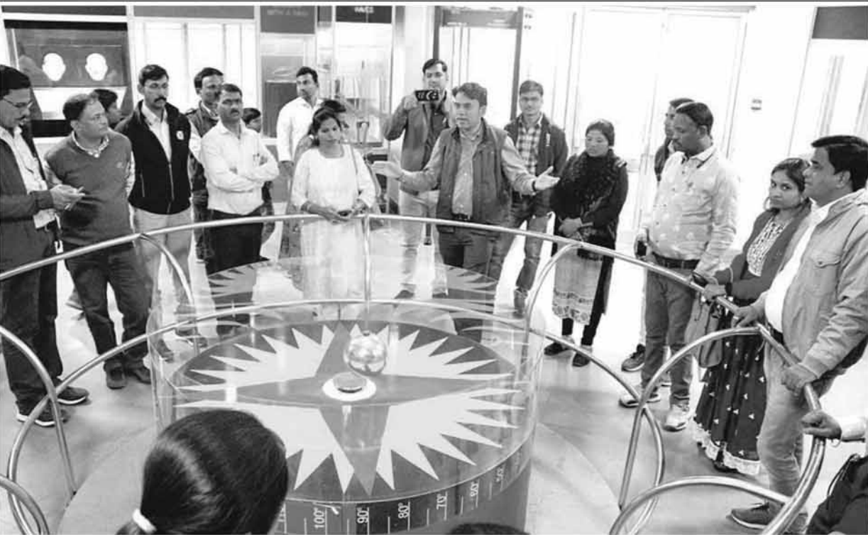
Teachers from all over the State of CM rise schools visit Regional Science Center during their ongoing training programme in Bhopal on Saturday.

said that just as a lion becomes the king of the jungle on the strength of his hard work, no one crowns him, in the same way, advocates also have to make their place on the strength of their knowledge and skills. He said that in Indian philosophy, the set of culture, thought, tradition and philosophy has been called nation, whereas in western philosophy, nation is bound only by geographical boundaries. The nation has been defined in our Vedas as well. Culture is created by rituals and our rituals are Vasudhaiva Kutumbakam. Atithi Devo Bhava. That is why our culture is unique in the whole world.