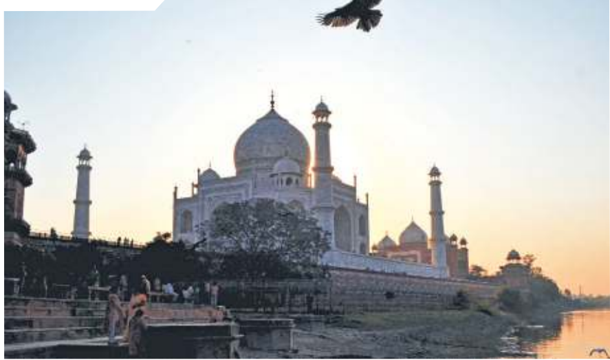
Taj Mahal during sunset in Agra,