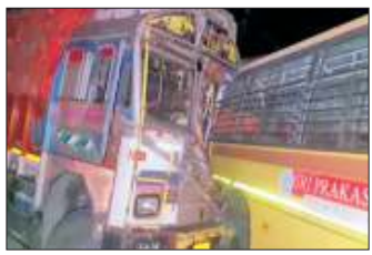
PNS ■ VISAKHAPATNAM

As many as 40 schoolchildren had a miraculous escape when a lorry rammed their school bus at Nakkapalli in the Anakapalli district on the national highway on Friday.