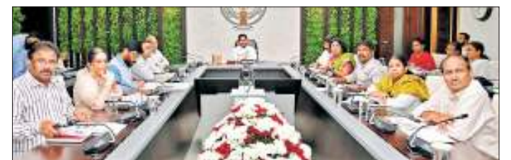
PNS ■ AMARAVATI

Officials directed to extend services of APCMMS App to villages