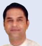
RAJYOGI BRAHMAKUMAR NIKUNJ JI

Stress must be dealt with awareness of actions, results