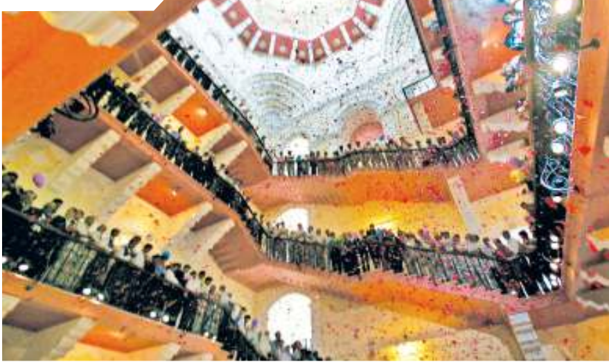
Employees of the Taj Mahal hotel shower flower petals in Mumbai