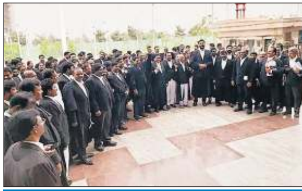
The Supreme Court collegium headed by Chief Justice of India DY Chandrachud on Thursday recommended the transfer of seven High Court Judges, including two from Andhra Pradesh High Court, three from Telangana, and two from Madras High Court.