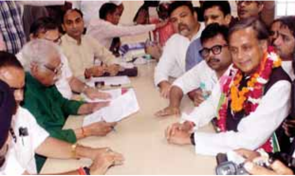
Left: Senior Congress leader Shashi Tharoor, Senior Congress leader Mallikarjun Kharge file thier nomination papers separately for the post of party President, at AICC headquarters in New Delhi on Friday, Congress leaders Digvijaya Singh, Bhupinder Singh Hooda, Ashok Gehlot and others are also seen

With the Group of 23 Congress leaders, who had been seeking a complete rehaul of the party and a non-Gandhi as the president given Rahul Gandhi’s reluctance, backing his nomination for the top post publicly, it is expected to give the experienced leader breathing space to put the disarrayed house in order that led to the exit of the likes of Ghulam Nabi Azad, Kapil Sibal, Himanta Biswa Sarma, Sushmita Dev, Jyotiraditya Scindia, Jitendra Prasad and Amariinder Singh