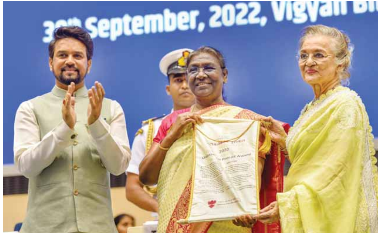
President Droupadi Murmu presents Dadasaheb Phalke Award to film actor Asha Parekh during the 68th National Film Awards presentation ceremony, at Vigyan Bhawan in New Delhi, on Thursday. Union Minister Anurag Thakur is also seen