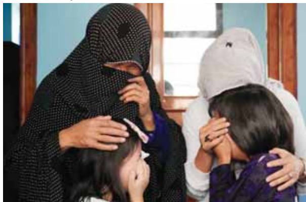
The family of a 19-year old girl who was victim of a suicide bomber mourns in Kabul on Friday. The fidayeen hit while hundreds of teenage students inside an education centre were taking practice entrance exams for university

The ISIS has carried out repeated, horrific attacks on