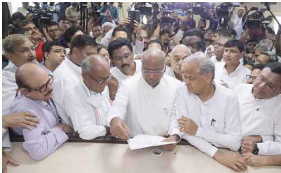
Senior Congress leader Mallikarjun Kharge files his nomination papers for the post of party president at AICC headquarters in New Delhi on Friday. Congress leaders Digvijaya Singh, Ashok Gehlot and others are also seen

The candidature of Kharge, believed to have been backed by Congress interim chief Sonia Gandhi, has unified the party in a big way. The Leader of the Opposition in the Rajya