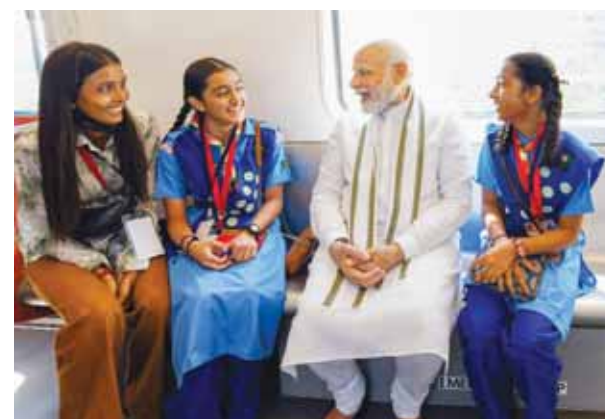
Prime Minister Narendra Modi rides a metro after inaugurating the phase-1 of Ahmedabad Metro rail project in Ahmedabad on Friday