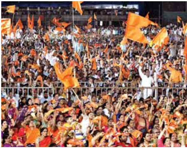
Shiv Sena supporters during their Dussehra Rally at Dadar, in Mumbai on Wednesday

On a day when Shinde paraded three estranged Thackerays — late Bal