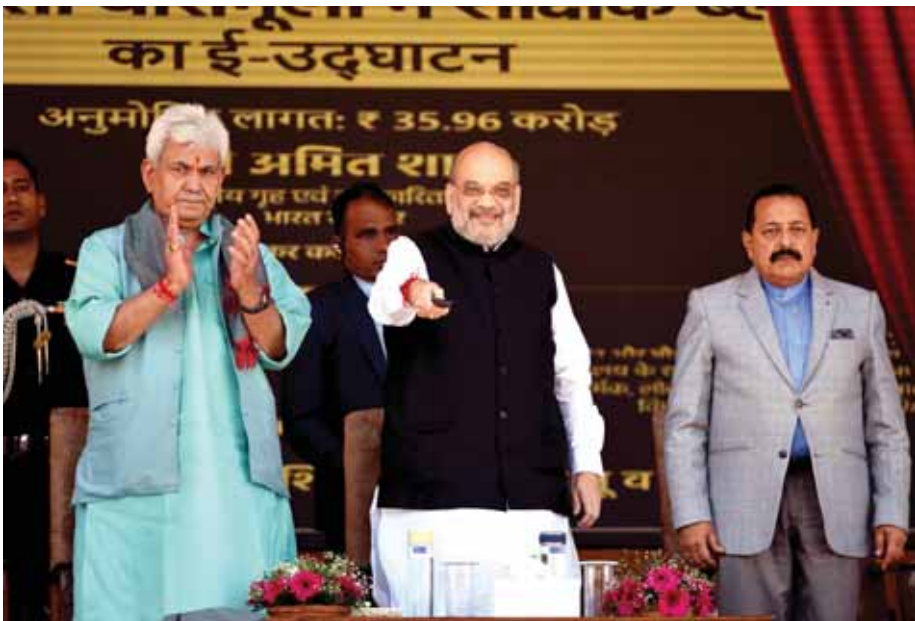
Union Home Minister Amit Shah, with J&K Lt-Governor Manoj Sinha and MoS Jitendra Singh, during a public rally at the Shaukat Ali Stadium in Baramulla district of north Kashmir on Wednesday

Launching a scathing attack on former J&K Chief Ministers Farooq Abdullah and