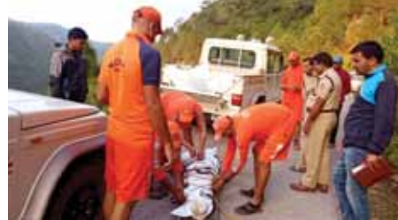
NDRF personnel shift the body of a victim during a search and rescue operation after a bus carrying members of a marriage party fell into a gorge, in Pauri Garhwal district on Tuesday evening

A rescue operation was launched soon after the incident on Tuesday evening. However, efforts of the rescuers were hampered by dark-