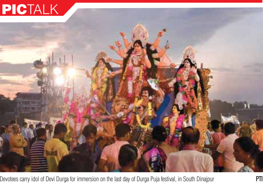
Devotees carry idol of Devi Durga for immersion on the last day of Durga Puja festival, in South Dinajpur

In June, he had also tried to rein in the saffron zealots not to "look for a Shivling in every mosque (har masjid me Shivling kyun dekhna)." This statement was made as the controversy over the Gyanvapi mosque raged. In a nutshell, Bhagwat should avoid making statements which may further anger the excitable saffron enthusiasts. As it is, their words and actions have had a chilling effect on Muslims. Government machinery, especially those who are expected to uphold the law, doesn't make things easier. A video doing the rounds on social media is that of cops in full public view thrashing a few men, said to be Muslims, in Gujarat's Kheda district. The men, who allegedly attacked a Garba event, were held against an electric pole in the village square and beaten. Worse, the cops were cheered on by the onlookers. Human dignity, civil rights, innocent until proven guilty, the rule of law—such concepts seem to be vanishing. The RSS website talks about "keeping aflame the spirit of freedom." Accordingly, it should condemn the Kheda incident. Also, it must regularly focus on such real issues as inflation and unemployment, as its leader Dattatreya Hosabale did, instead of raising the bogeyman of growing Muslim population.