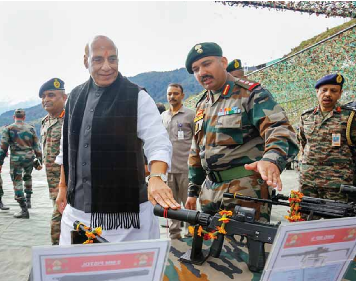
Defence Minister Rajnath Singh performs 'Shastra Pujan' on the occasion Vijayadashmi on Wednesday

In addition to the Army, the Navy and IAF too operate these helicopters. For instance, the IAF has around 120 Cheetah and Chetak and around 18 of the more recent Cheetahs. As reported by The Hindu earlier, the total technical life of these helicopters will start finishing from 2023 onwards which will only further exacerbate the existing deficiencies.