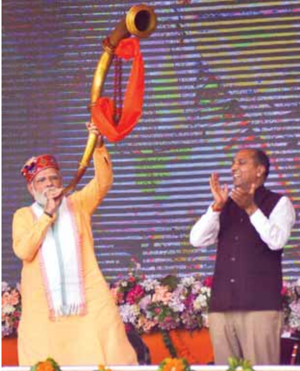
Prime Minister Narendra Modi plays a traditional trumpet 'ransings' during the launch of developmental initiatives at Bilaspur, Himachal Pradesh on Wednesday.