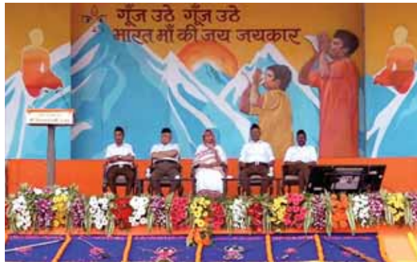
Rashtriya Swayamsevak Sangh (RSS) chief Mohan Bhagwat with mountaineer Santosh Yadav and others during a Vijayadashami function, in Nagpur on Wednesday

Speaking on the importance of the mother tongue, the RSS chief lauded the New Education Policy and said, "It's a myth that English is important for a career. The New Education Policy should lead to students becoming highly cultured, good human beings who are also inspired by patriotism. This is everyone's desire. Society needs to support this activity."