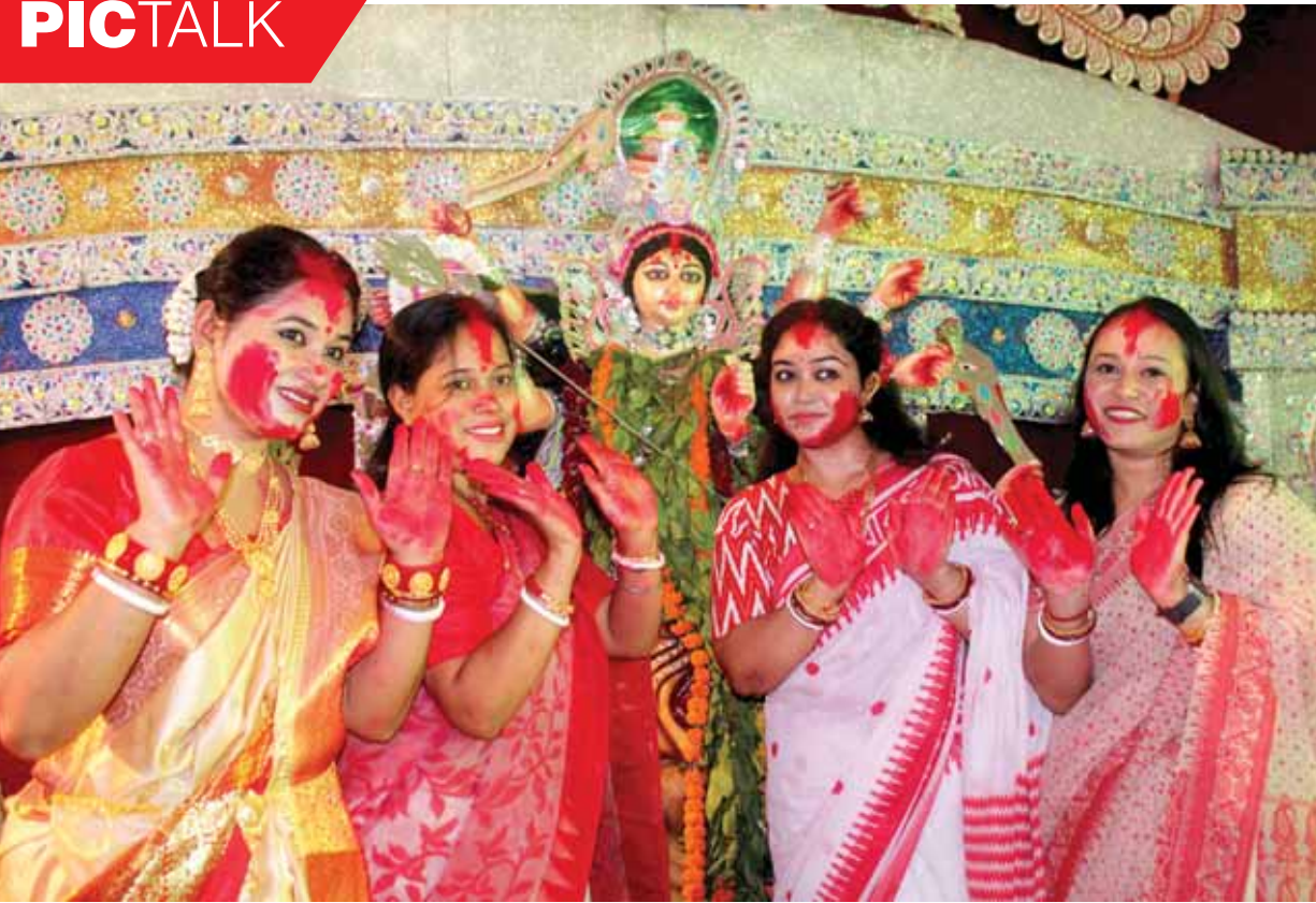
Women greet each other by applying Sindoor to their faces on the occasion of Dussehra-Vijaya Dashami festival in New Delhi on Wednesday