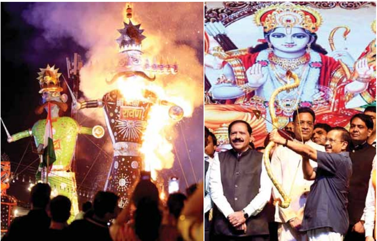
Delhi Chief Minister Arvind Kejriwal on Wednesday attends Dussehra festivities at the historical Red Fort ground. Speaking at the Lav Kush Ramilla Committee's 'Ravan Dahan' programme, Kejriwal wished India to become the "best and strongest nation in the world". He said Ramilla is very important for the people as it connects them to the culture of the country and spreads the message of Lord Rama's life. The Chief Minister also witnessed the burning of the effigies of demon king Ravana, his brother Kumbhkaran and son, Meghnad. Actor Prabhas of 'Baahubali' fame also attended the event