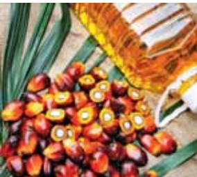
SPTI ■ NEW DELHI

India saw more than two-and-a-half times increase in import of refined palm oil at 17.12 lakh tonne in the last 11 months due to lower prices in Indonesia, industry body SEA said on Thursday. The country had imported 6.28 lakh tonne of refined palm oil (RBD palmolein) in the year-ago period. The oil year runs from November to October, it said. India, the world's leading vegetable oil buyer, imported 130.1 lakh tonne of vegetable oils during the November-September period of the ongoing 2021-22 oil year, 4 per cent higher than the year-ago period. Palm oil shipments comprise 50 per cent of the total vegetable oil imports. According to the Solvent