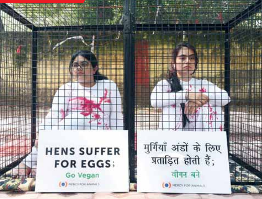
Activists of Mercy for Animals India Foundation lock themselves inside a cage while wearing white, bloodied clothes and holding placards which read 'Hens suffer for Eggs; Go Vegan', during a demonstration, ahead of 'World Egg Day' at Jantar Mantar in New Delhi on Thursday