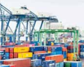
PTI ■ NEW DELHI

India has initiated an anti-dumping probe into import of Chinese glass used in home appliances products following a complaint by a domestic player. The duty is aimed at protecting the domestic industry from cheap imports. The commerce ministry's investigation arm Directorate General of Trade Remedies (DGTR) is probing the alleged dumping of "Toughened