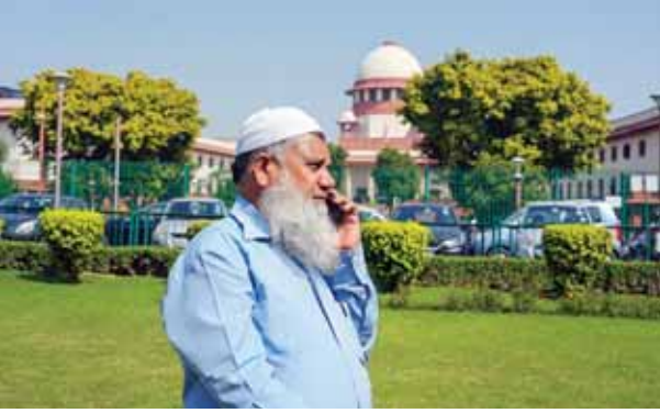
A man at Supreme Court on the day of the verdict of the case regarding the ban on hijab in Karnataka's educational institutions, in New Delhi on Thursday