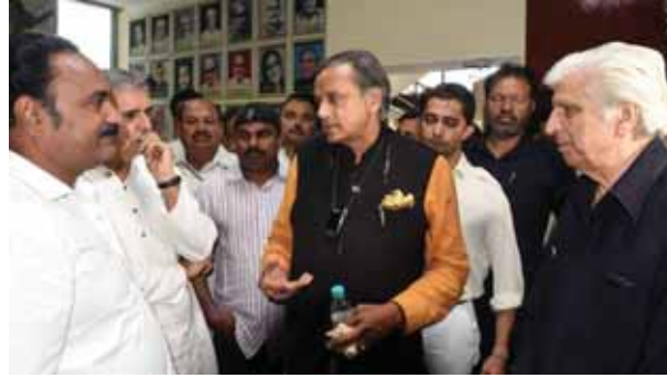
Congress party presidential candidate Shashi Tharoor interacts with leaders at Delhi Pradesh Congress Committee (DPCC) office in New Delhi on Thursday

For instance, the committee has recommended that more than 50 per cent of the budget of government advertisements should continue to be allocated to Hindi language ads," said CPI(M) organ.