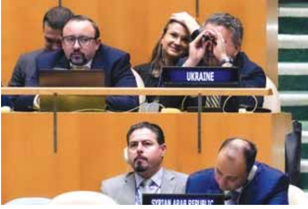
United Nations Ambassador from Ukraine, Sergiy Kyslytsya, far right top, use a binocular in the UN General Assembly, before it voted on a resolution condemning Russia's illegal referendum in Ukraine on Wednesday at UN headquarters

The resolution "Territorial integrity of Ukraine: defending the principles of the Charter of the United Nations" was adopted with 143 nations voting in favour; Russia, Belarus, North