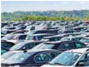
PTI ■ NEW DELHI

Passenger vehicle wholesales in India crossed the 10 lakh quarterly mark for the first time in the September quarter as automakers pushed units to dealers to cater to the festive demand, Society of Indian Automobile Manufacturers said on Thursday. As per the latest data by the Society of Indian Automobile Manufacturers (SIAM), passenger vehicle wholesales in the September quarter increased by 38 per cent to 10,26,309 units, as against 7,41,442 units in the similar period of the last fiscal. "More than half of the overall passenger vehicle dispatches are utility vehicles so there is a strong demand for models in this particular segment," SIAM President Vinod Aggarwal told reporters here. While the utility vehicles