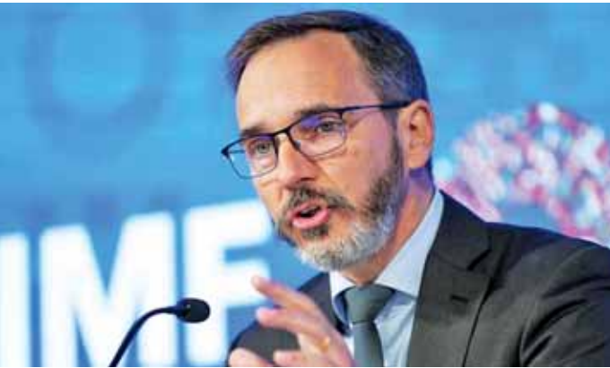
PTI ■ WASHINGTON