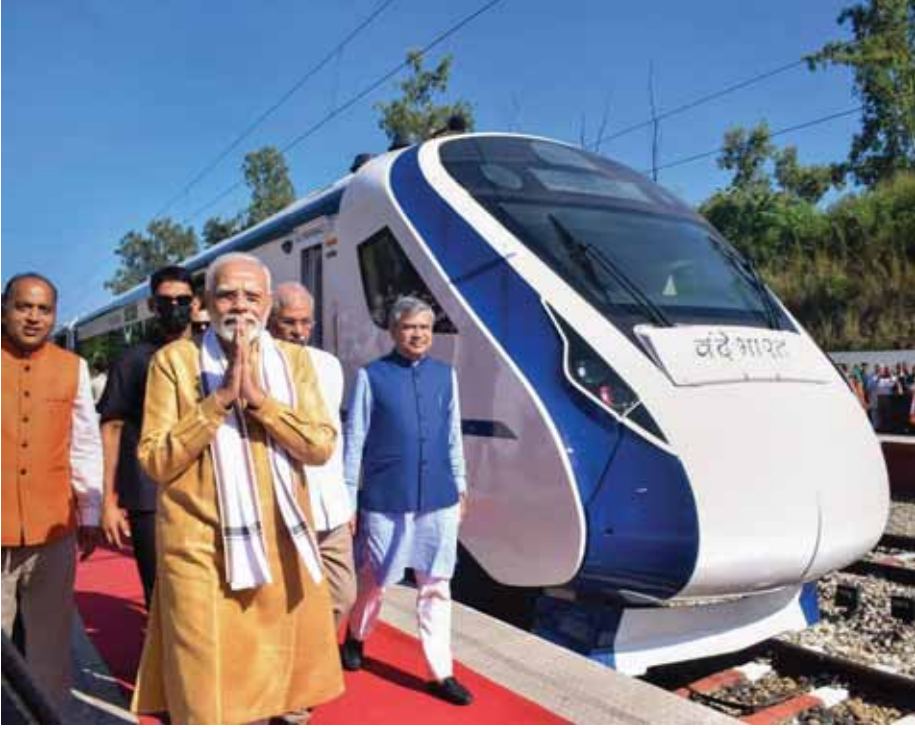
Prime Minister Narendra Modi with Railways Minister Ashwini Vaishnav, Himachal Pradesh Governor Rajendra Arlekar and Himachal Pradesh Chief Minister Jai Ram Thakur during the flagging-off ceremony of Vande Bharat Express train, in Una, Thursday. The train will run six days a week except on Wednesdays, with stops at Ambala, Chandigarh, Anandpur Sahib, and Una. It accelerates to 100 km per hour in just 52 seconds