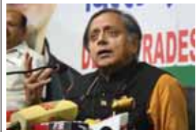
Congress party presidential candidate Shashi Tharoor at Delhi Pradesh Congress Committee office in New Delhi on Thursday

New Delhi: Congress presidential candidate Shashi Tharoor on Thursday lamented that some leaders had openly come out in support of his poll opponent Mallikarjun Kharge and even summoned meetings in his favour, saying it disturbed the level-playing field.