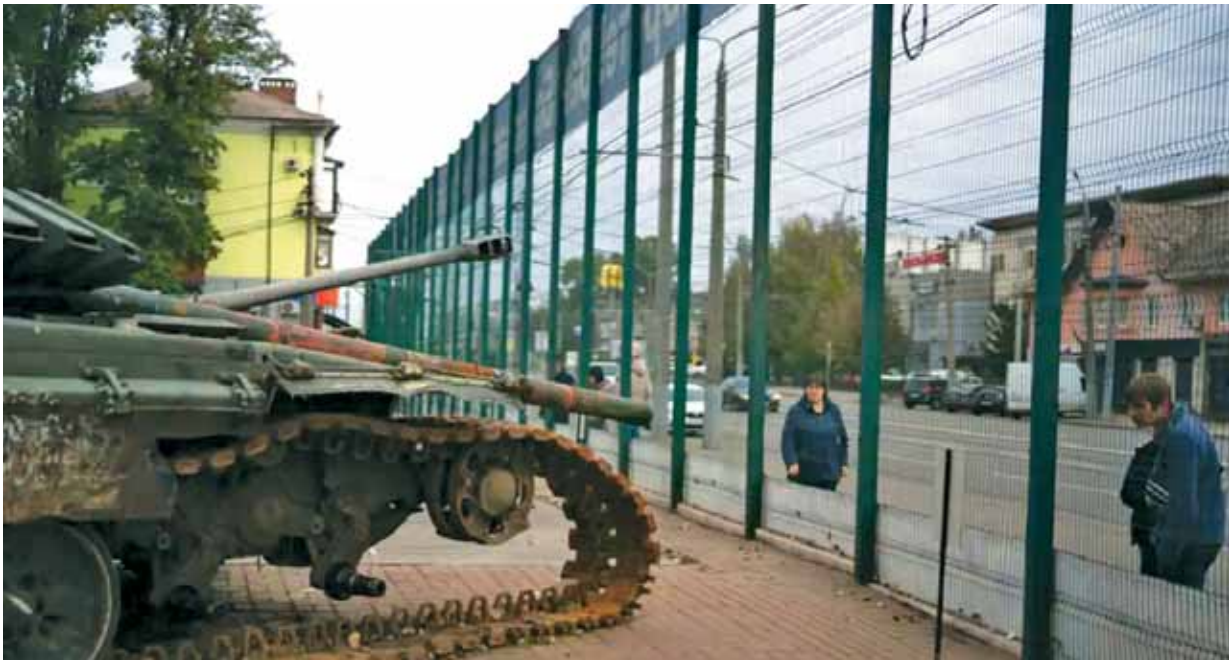
People look at a display of destroyed Russian military vehicles during the Defender of Ukraine Day in Kryvyi Rih, in Ukraine, on Friday

3.1 billion euros the total EU sum in security support being made available for Ukraine. Individual countries are also spending more on top of that. The decisions are set to be announced almost eight months after Russia launched its invasion of Ukraine. Earlier this week, EU foreign policy chief Josep Borrell criticised the 27-nation bloc for being too slow to come to the country's aid. "We had been discussing about the Ukrainian training mission before the war. Before the war. For months, for months before the war," Borrell, who will chair Monday's meeting, told a conference of EU ambassadors.