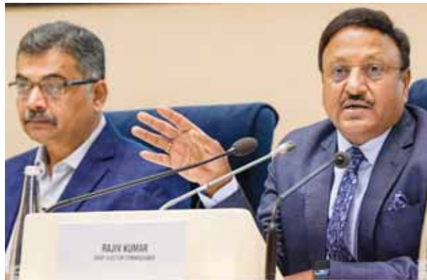
Chief Election Commissioner Rajiv Kumar during a press conference for the announcement of schedule of Assembly elections in Himachal Pradesh, in New Delhi on Friday

“There are a number of factors, such as weather. We want to hold the Himachal elections before the onset of snow, especially in the upper reaches where snowing takes place... There is a gap of 40 days between the ends of the Assemblies of the two States. According to the rules, it