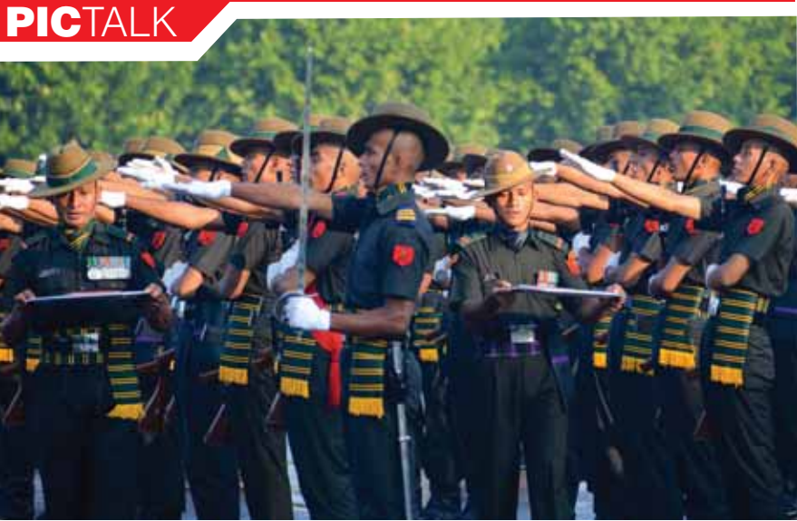
Soldiers take oath after the end of their training at 39 Gorkha Training Centre in Varanasi

When that happens, the rule of law gets replaced with the rule of men and women—that is, the men and women holding high offices. This is the surest sign of descent into medieval horrors, when the law enforcers paid fealty to their feudal masters. The fealty was personal, binding the oath taker to blindly follow the orders of his lord and master. Modern times are different—at least in our country. We have a written Constitution; cops, ministers, etc., take oath to uphold the Constitution, not to protect or further the interests of any person, however powerful they may be. If that oath is not respected in letter and spirit, which might have happened in this case, there can be, in the words of the High Court, departure from the due process of law. This has other consequences as well. It is a well-known fact that Maoists are a threat to internal security; they believe in the violent ideology—political power flows from the barrel of the gun—their ideological guru, Mao Zedong, taught. They have killed thousands of security personnel and citizens over the decades. But when innocent people are victimised in the name of fighting Maoism, the war on Leftwing extremism suffers a setback. For now, action against even real Maoists may appear suspect. Just as political abuse of the Enforcement Directorate can remove the difference between the actual money launderers and political targets. It is time the political class worked to strengthen the rule of law.