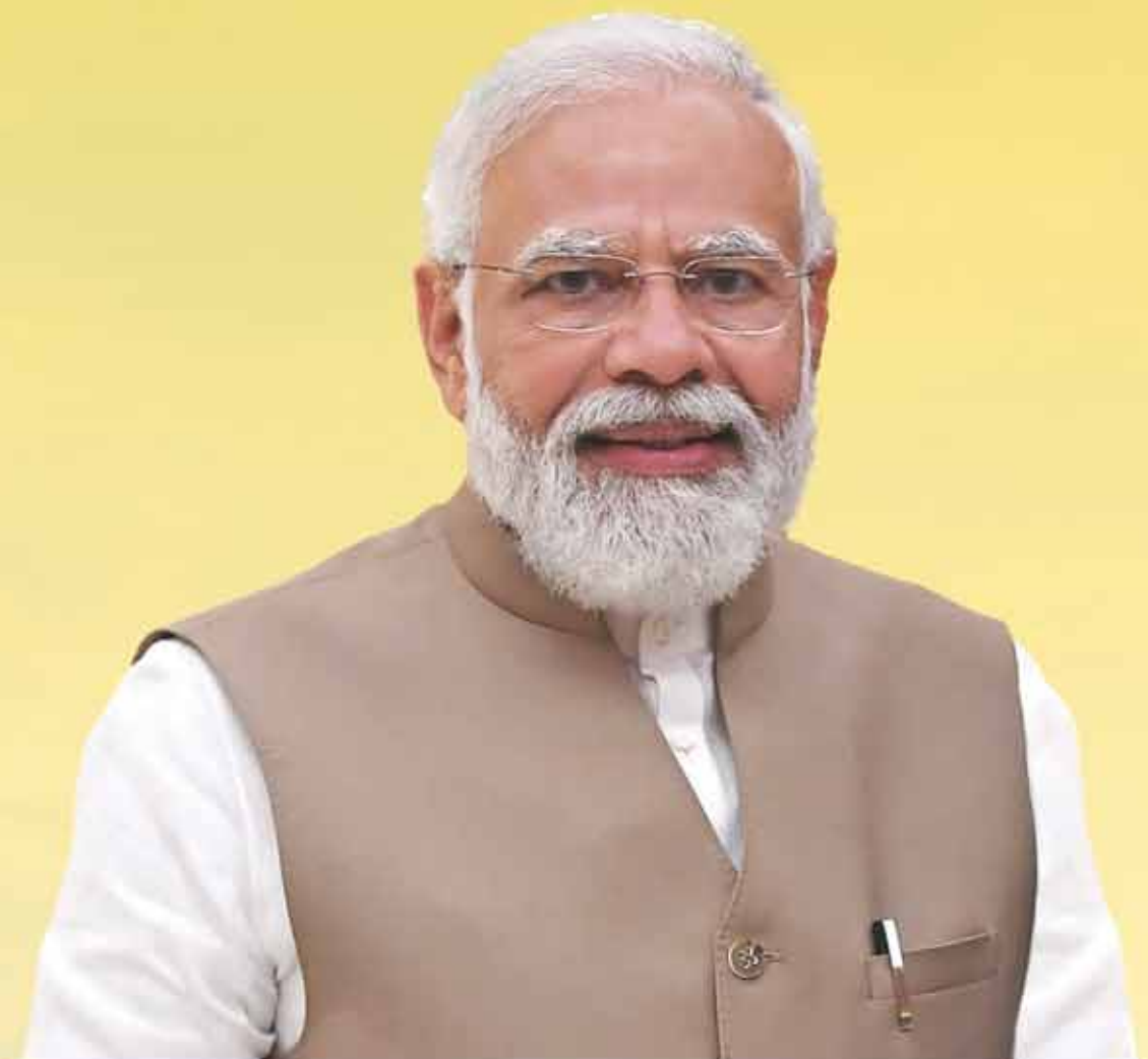
नरेन्द्र मोदी, प्रधानमंत्री