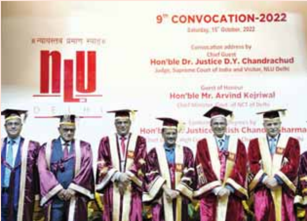
Justice DY Chandrachud and Delhi Chief Minister Arvind Kejriwal at the 9th Convocation of National Law University, in New Delhi on Saturday

Agencies: Pitching for a more inclusive and accessible legal profession, Supreme Court judge Justice DY Chandrachud on Saturday advised young law students to incorporate feminist thinking in the way they deal with law. Addressing the convocation of the National Law University (NLU) here, Justice Chandrachud said students must strive to make the legal profession more inclusive and accessible. “I would particularly advise you to incorporate feminist thinking in the way you deal with the law,” he told the gathering. Recounting his experience as a junior judge in the Bombay High Court, Justice Chandrachud said he used to sit in a criminal roster with Justice Ranjana Desai (now retired) and heard diverse criminal appeals. “Initially, I viewed the matters where women were often subjected to the worst of crimes and violations from a