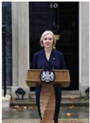
Liz Truss makes a statement outside 10 Downing Street where she announced her resignation as Prime Minister, in London on Thursday

Truss added she had agreed with Sir Graham Brady, chairman of the 1922 Committee — the body that conducts internal elections in the Conservative party — that the leadership election will be completed within a week.