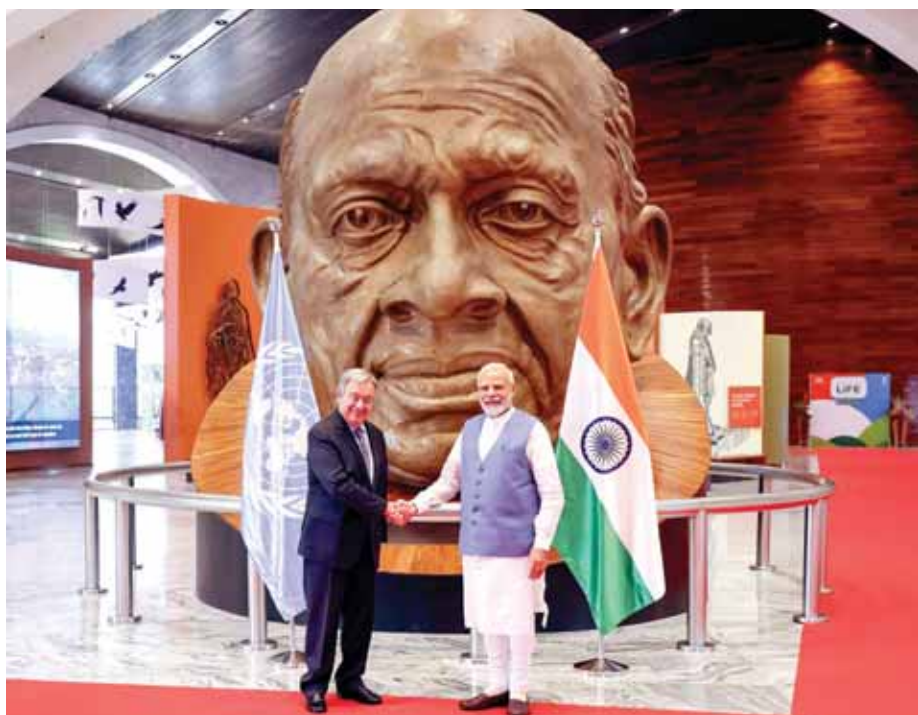
Prime Minister Narendra Modi with United Nations Secretary General Antonio Guterres during the global launch of Mission LiFE, in Kevadia on Thursday

Modi and UN Secretary-General Antonio Guterres