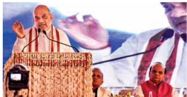
Union Home Minister Amit Shah speaks during the inauguration of 'Waste to Energy' plant, in New Delhi on Thursday

Responding to Shah's accusations, Delhi Chief Minister Arvind Kejriwal asked the BJP not to make "excuses" for its "failure" in running the MCD