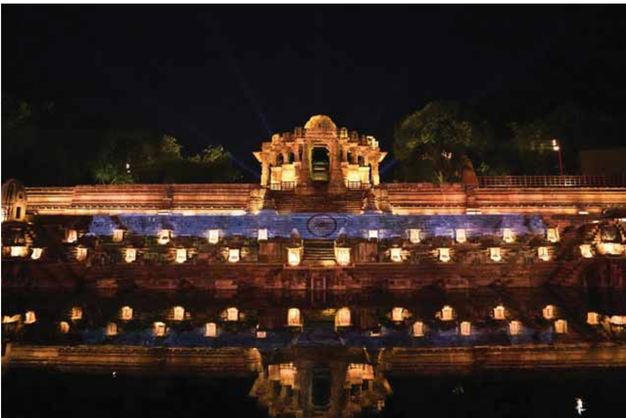
A solar-powered 3D projection mapping and heritage lighting show at Sun Temple in Modhera on Thursday.