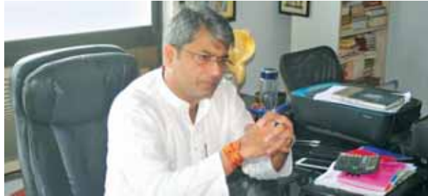
■ KUALA LUMPUR