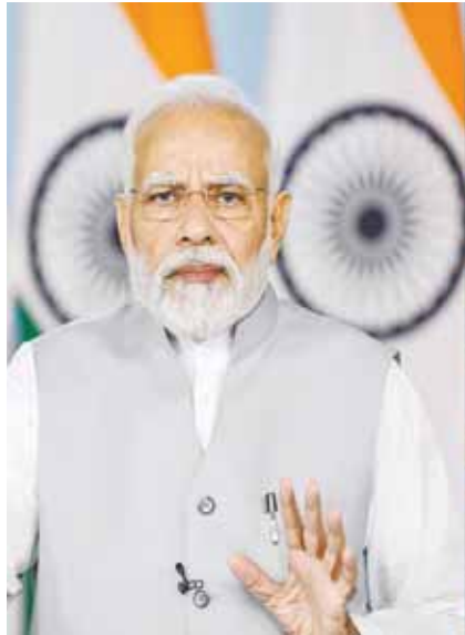
Prime Minister Narendra Modi during Rozgar Mela-recruitment drive for 10 lakh personnel via video conferencing from New Delhi on Saturday

Addressing the appointees via video conferencing, the Prime Minister said, "Today marks the day when a new link in the form of Rozgar Mela is being anchored to the employment and self-employment campaigns in the country that