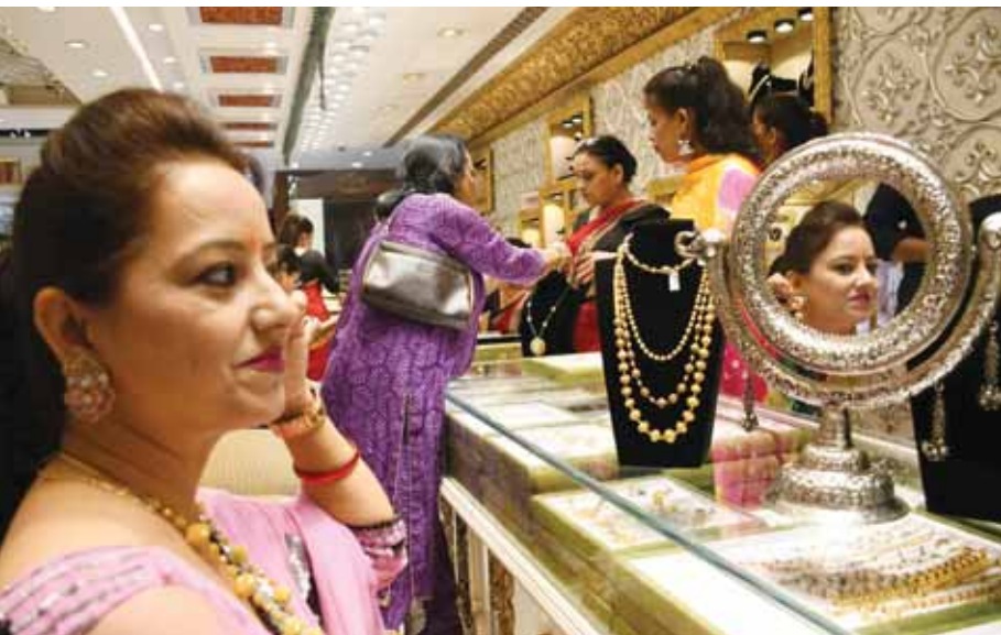
A woman tries gold ornaments on the occasion of Dhanteras festival in New Delhi on Saturday