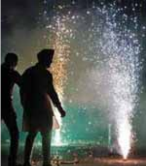
green firecrackers manufactured in the country, it said.

The burning of firecrackers "illegally" imported from China causes air pollution due to mixing of potassium nitrate and sulphur in them, not the