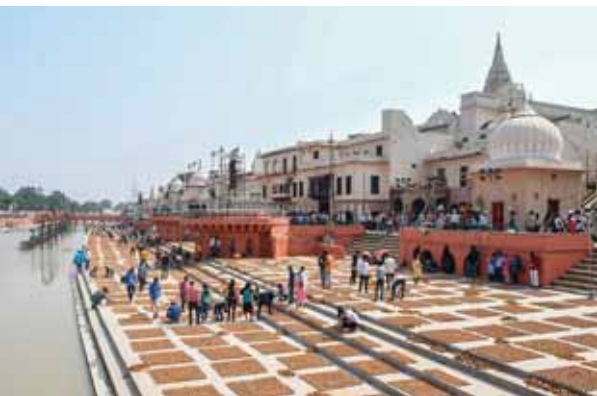
Locals arrange earthen lamps at Ram Ki Pauri in preparation for the 'Deepotsav' celebrations, in Ayodhya on Saturday

The ghats have been decorated. The diyas have been placed at the ghats by over