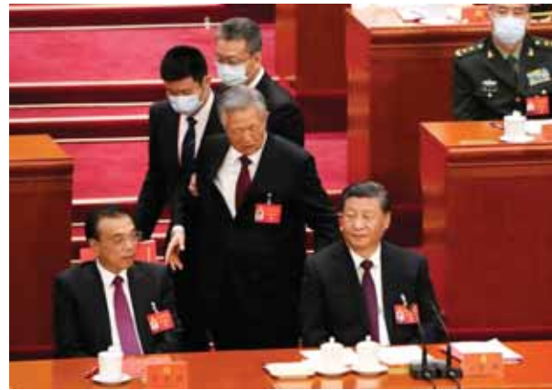
Former President Hu Jintao walks past Chinese President Xi Jinping, right, and Premier Li Keqiang during the closing ceremony of the 20th National Congress of China's ruling Communist Party at the Great Hall of the People in Beijing on Saturday