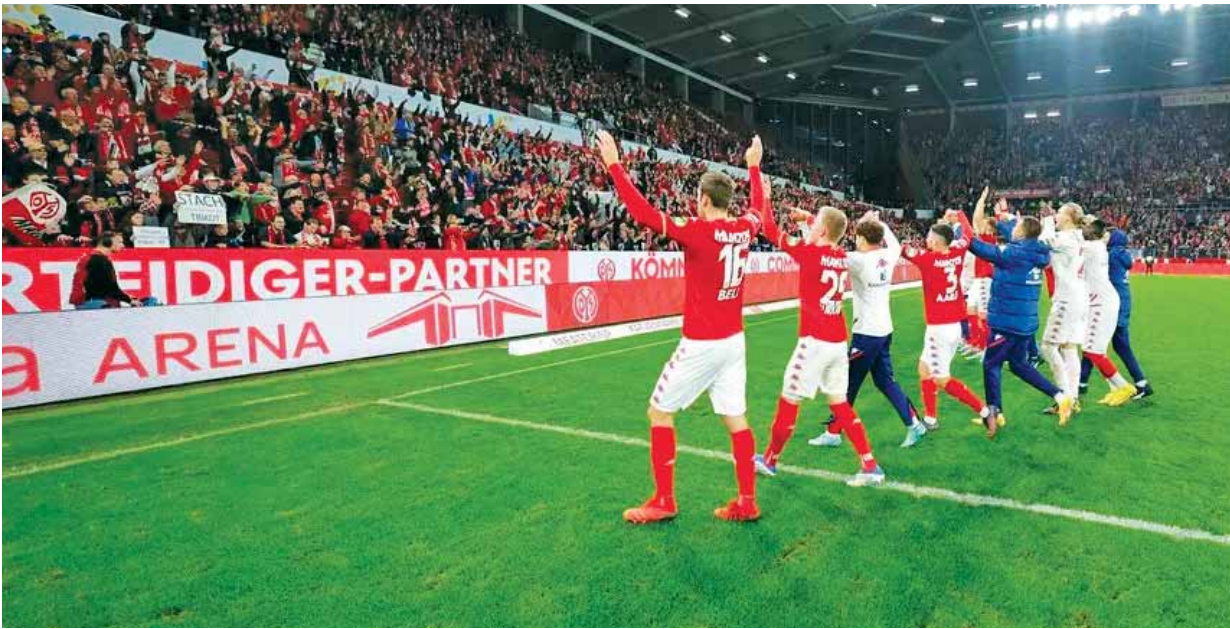
MAINZ (GERMANY)