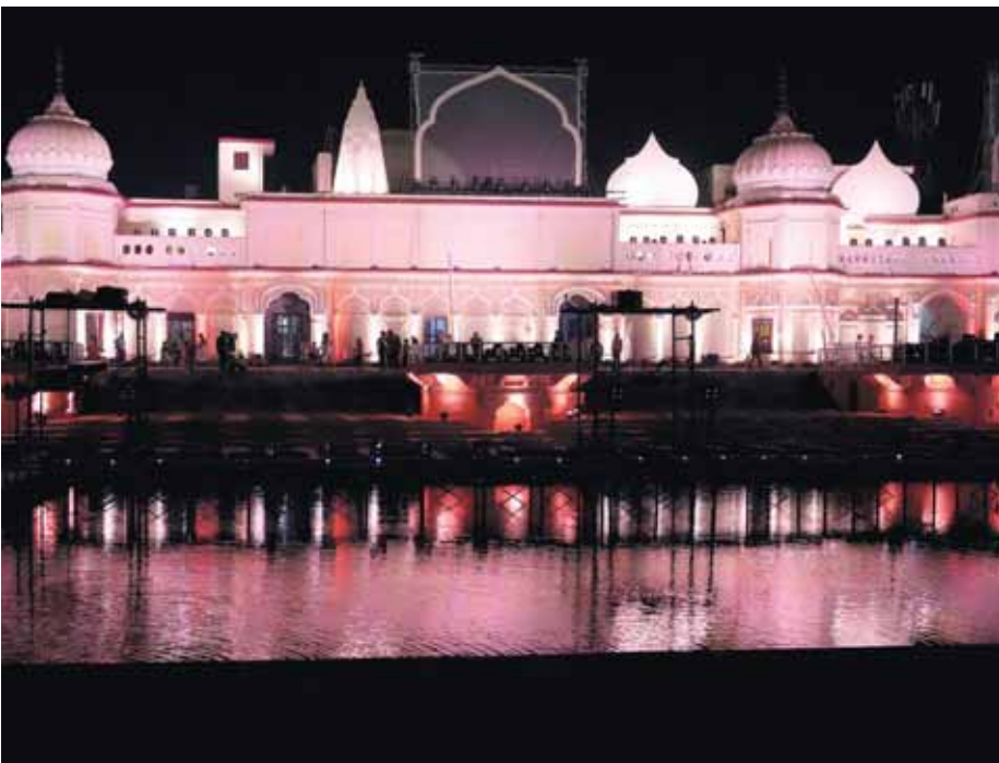
Illuminated Ram Ki Paidi on the banks of Saryu river ahead of the traditional 'Deepotsav' celebrations, in Ayodhya on Saturday

"In case it is proved beyond doubt that the girl (woman) was actively involved in hatching a conspiracy against the men and that she is not a victim but instead a perpetrator, I would urge you to ensure that strong action is taken against the woman under Section 182 (false information with intent to cause public servant to use his lawful power to the injury of another person) of the IPC and others," she added.