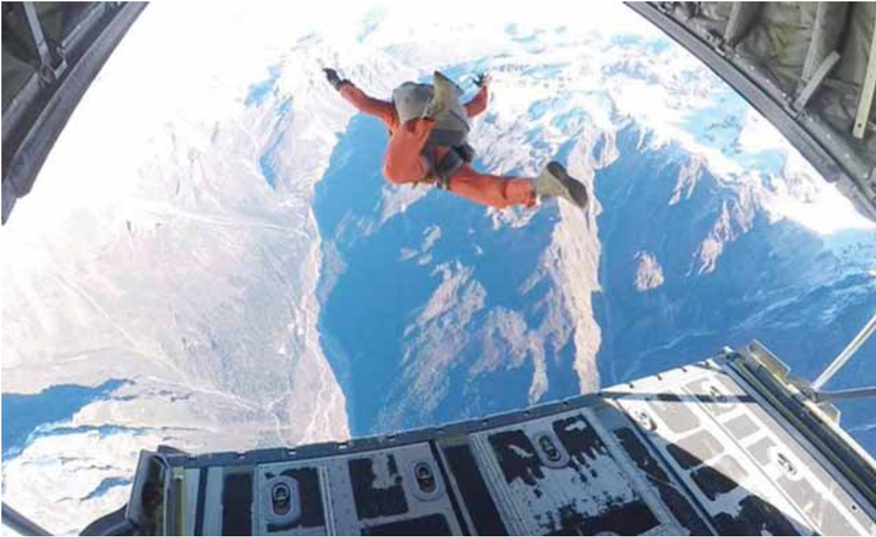
As a part of a joint Indian Air Force and Indian Army exercise, a high altitude Combat Free Fall mission was successfully carried out by commandos of Army Para Special Forces and Garuds from a C-130J aircraft in the Eastern sector

This, the EC stated, would include officers who happened to be posted in their home district, had completed three years in a district during the last four years or would be completing three years on, or before, January 31, 2023 in the case of Himachal Pradesh and February 28, 2023 in case of Gujarat.