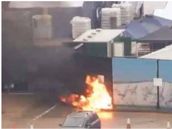
Dover is the arrival point for many migrants who cross the English Channel from

A news photographer at the scene said a man drove up and threw three gas bombs at the facility before driving to a nearby gas station and killing himself. Police said only that "the suspect has been identified and located."