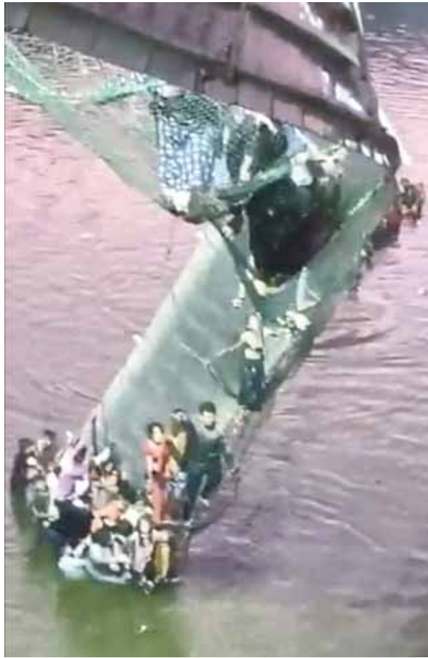
The collapsed portion of an old suspension bridge over the Machchhu River, in Morbi district on Sunday

"We are carrying out rescue work using boats. There are around 40-50 people in the