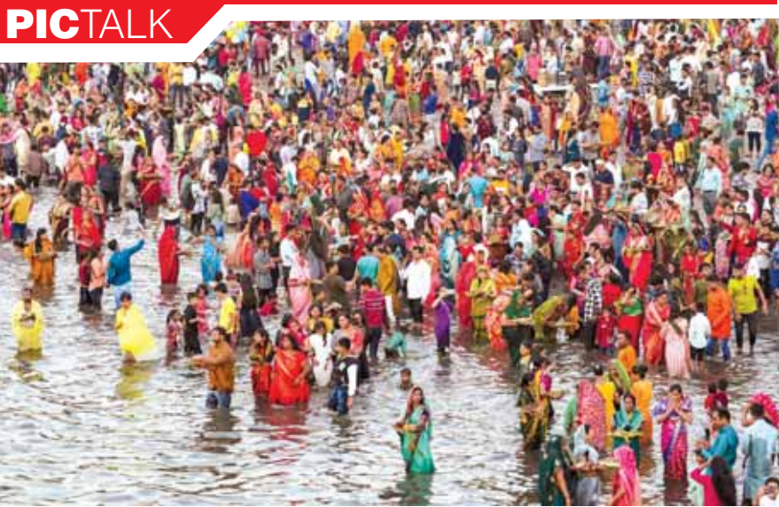
Devotees offer prayers to the Sun god on the occasion of Chhath Puja, at Dadar Beach in Mumbai