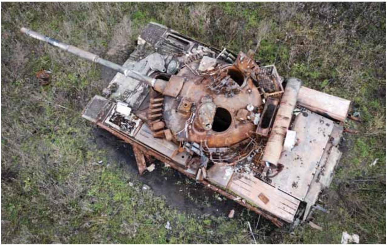
A Russian tank damaged in recent fighting is seen in the field near the recently retaken village of Kamianka, Kharkiv region, Ukraine, on Sunday.