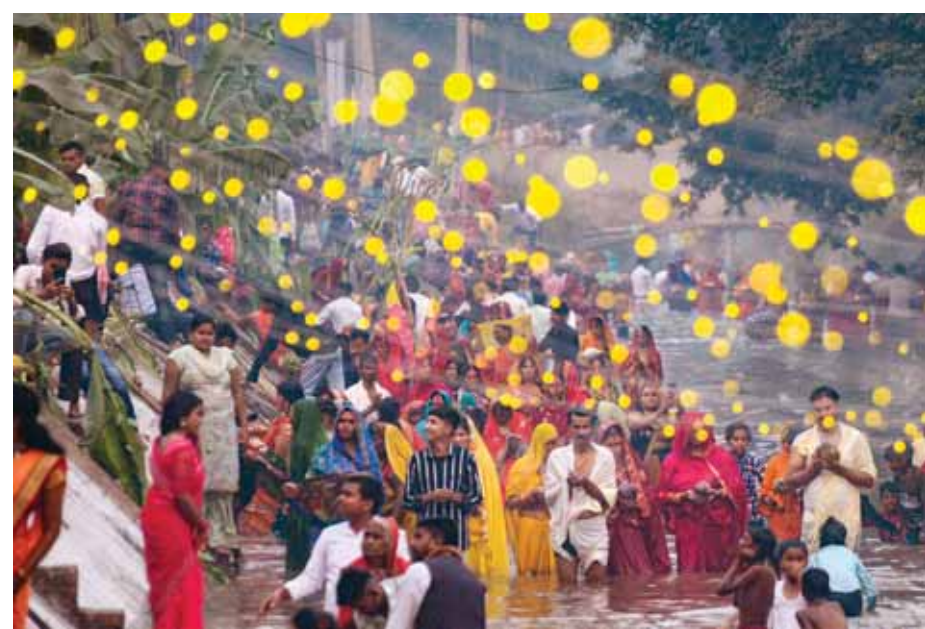
Devotees perform rituals of Chhath Puja festival in a canal in Jalandhar on Sunday

Before Telangana, nine other States that have withdrawn consent to the CBI are namely Meghalaya, Maharashtra, Punjab, Rajasthan, West Bengal, Jharkhand, Chhattisgarh, Kerala and Mizoram.