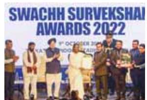
has been ranked at 11th in the latest report compared to its 9th position in the 2021 survey report.

The New Delhi Municipal Council area was ranked first in the "country's cleanest small city" category, having a population between 1 lakh and 3 lakh. The NCR city of Noida