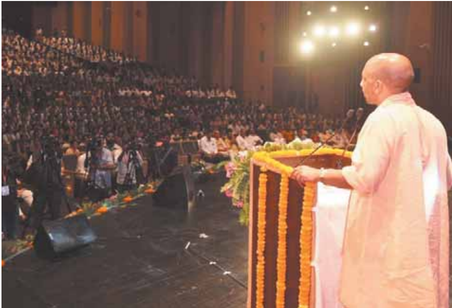
CM Yogi Adityanath addressing the gathering at Rudraksh Convention Centre on the virtual launching of 5G services.

Referring to the dialogue 'Main Samay Hoon' appeared at the beginning of television serial "Mahabharat", the CM said that the person who walk with the time, succeed in each field of life and added that we all witnessed the power of technology during the COVID-19 pandemic. The people were directly benefitted by depositing the money in their accounts through DBT and moreover, the students studied almost for two hours through online digitally mobile, he said, adding that the works in the government, semi-government and