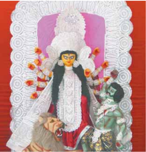
Goddess Durga idols at Boys' Anglo-Bengali Inter College (left) and at Latouche road pandal