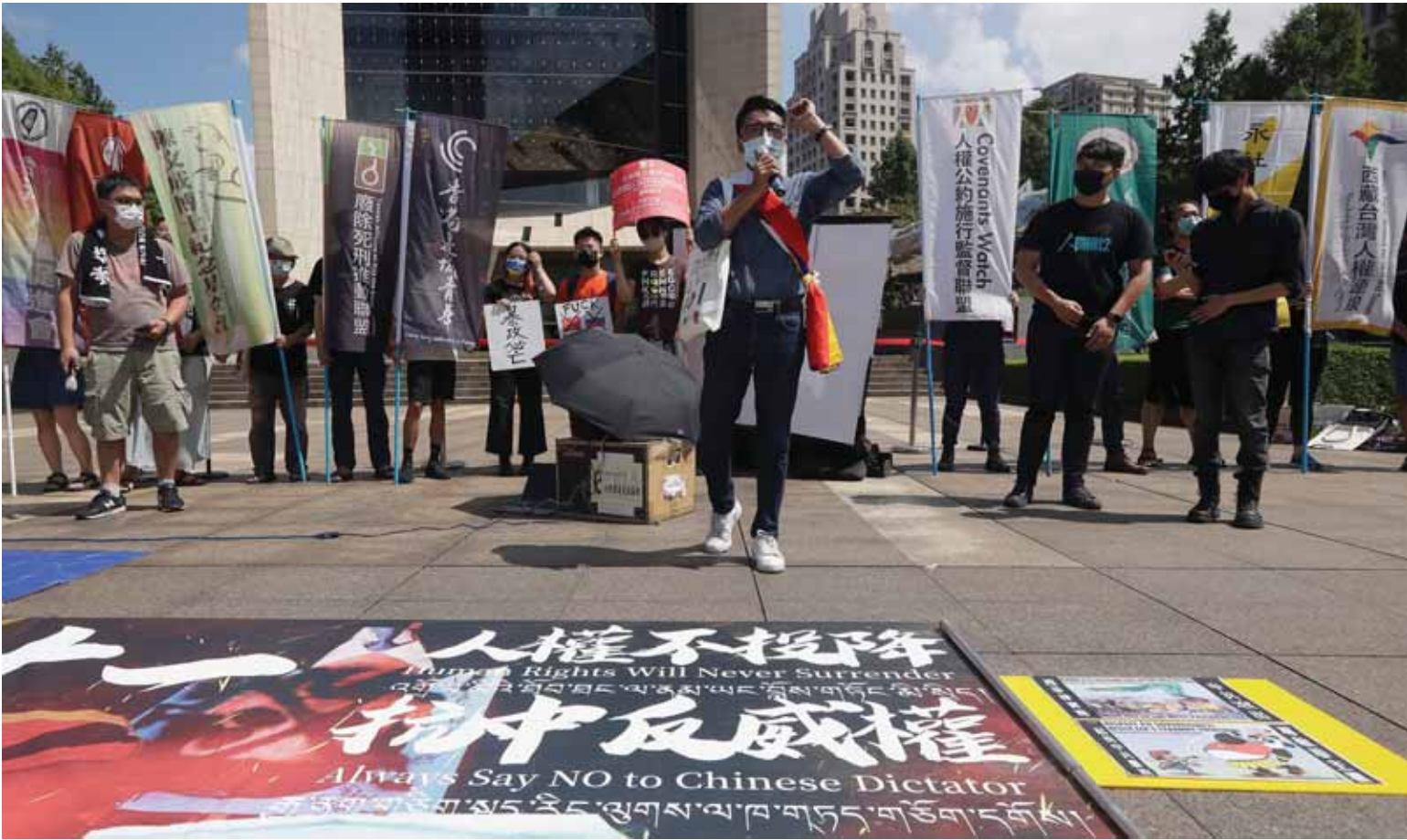
People gather to protest against China on human rights on the eve of China's National Day in front of the Bank of China in Taipei, Taiwan, on Friday

The proposal on China is for a simple debate, with no consistent monitoring of the