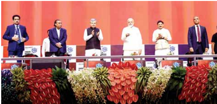
Prime Minister Narendra Modi with Union Minister for Communications and Electronics & Information Technology Ashwini Vaishnaw, Aditya Birla Group chairman Kumar Mangalam Birla, Reliance Industries Ltd chairman Mukesh Ambani, and Bharti Enterprises chairman Sunil Bharti Mittal during the launch of 5G services in India at the 6th India Mobile Congress, at Pragati Maidan in New Delhi on Saturday

"This means that poor and middle-income people are sav-