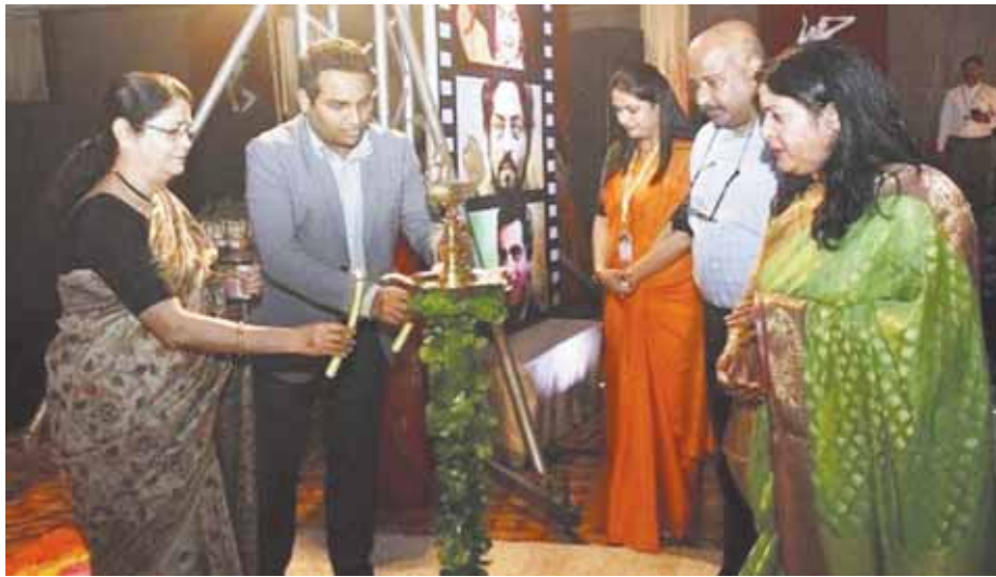
Grandparents Day being celebrated at Seth AR Jaipuria School on Saturday.