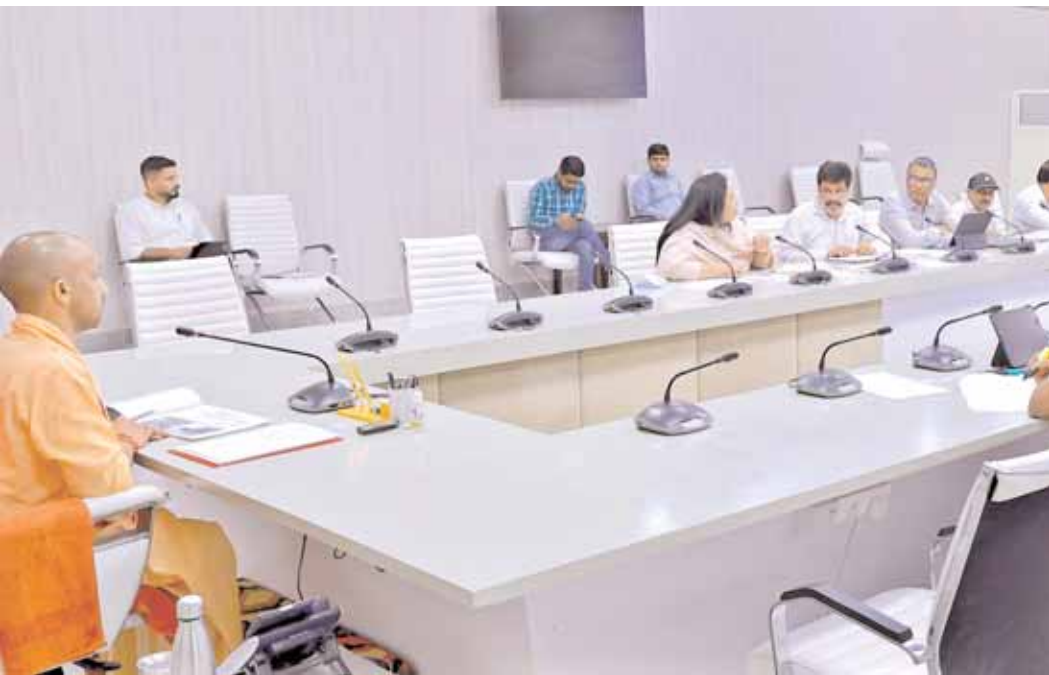
Chief Minister Yogi Adityanath chairing a review meeting with the Food Safety and Drug Administration Department

"Daily monitoring of these works should be done by posting a