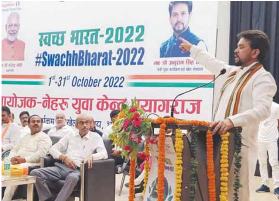
Union Youth and Sports Minister Anurag Thakur addressing the gathering

All these views were expressed by Union Minister of Youth Affairs and Sports and Ministry of Information and