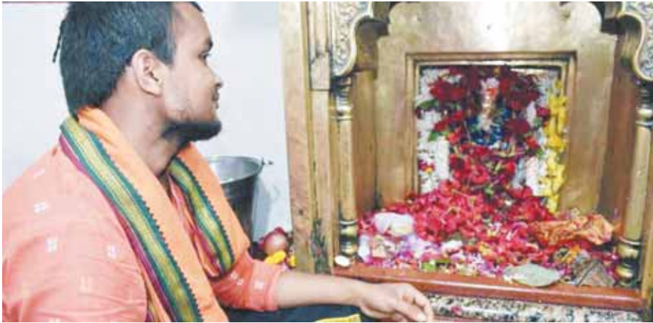
Idol of diety Katyayini.

Barricading was made at the temple of deity Katyayini to