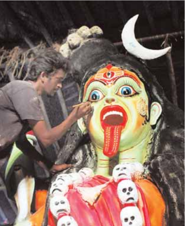
An artist gives final touches to an idol of Goddess Kali ahead of the Navratri festival in Bhopal on Saturday.