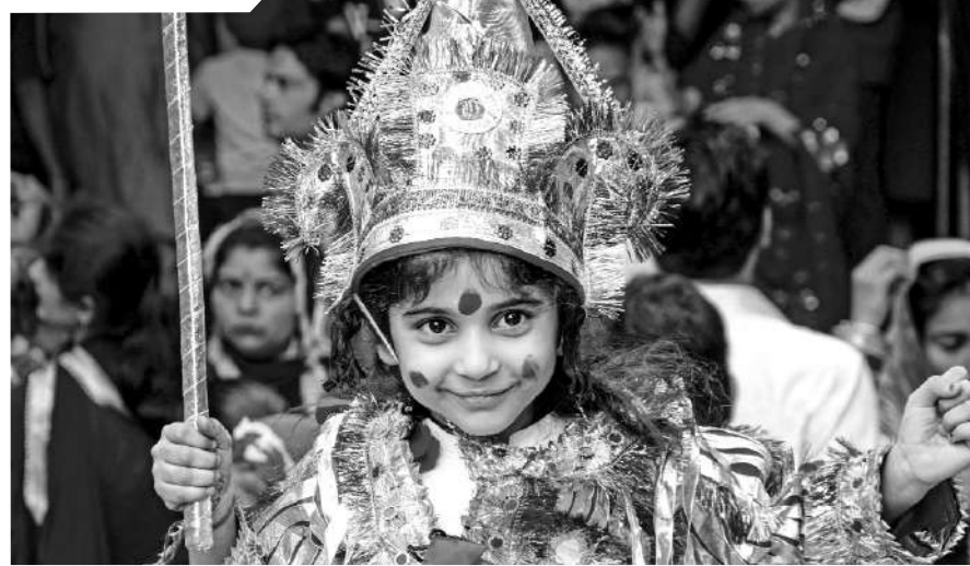
A young devotee pays obeisance at Durgiana Temple on the first day of 'Navratri' festival, in Amritsar