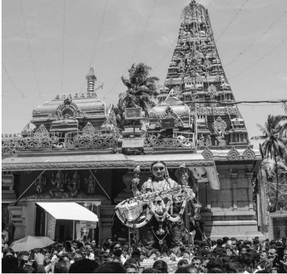
Devotees participate in a religious procession to install an idol of Goddess Sharada at Kudroli Sri Gokarnanatheshwara Temple on the first day of 'Navratri' festival, in Mangaluru on Monday.

On January 5, 2014 India successfully flew GSLV-D5 with a cryogenic engine (made by ISRO through private industries) and became the sixth country in developing cryogenic engines. Space exploration in the future is mostly dependent upon cryogenic technology.