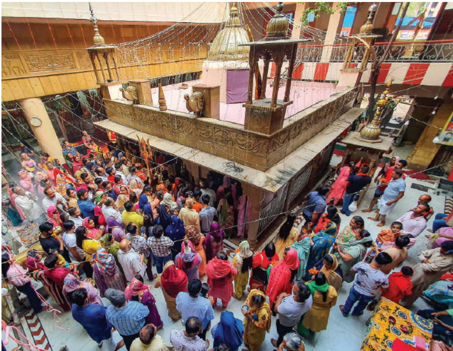
Devotees offer prayers at the Mata Longa Wali Devi Temple on the first day of 'Navratri' festival, in Amritsar on Monday