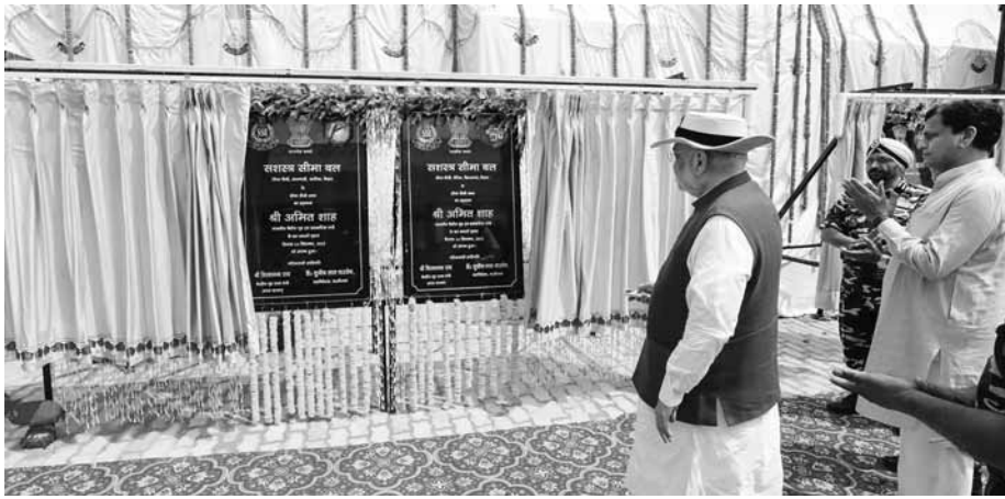
Union Minister for Home Affairs and Cooperation Amit Shah during inauguration of five Border Outposts of 'Sashastra Seema Bal', in Fatehpur, Bihar, on Saturday

Rajnath said country's goal is not only to make items for its needs, but also to export defence items to other countries. "I can say we are moving fast towards fulfilling dreams of Pandit Deendayal Upadhyay," he said.