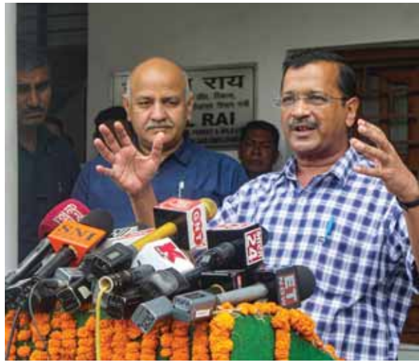
Delhi CM Arvind Kejriwal speaks to the media as Deputy CM Manish Sisodia looks on, after the Special Session of the Assembly in New Delhi on Thursday

He further listed out two demands: The BJP should stop