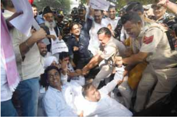
Aam Aadmi Party workers being detained during a protest outside Delhi L-G's residence, in New Delhi on Thursday

some work L-G sahab, pay attention to the law and order situation of Delhi," they shouted. The agitating MLAs listed out recent incidents of crime in the city including the Sangam Vihar shooting, and accused the L-G of being ignorant of his responsibility of maintaining law and order. The Delhi Police urged the MLAs to vacate the spot as prohibitory orders under Section 144 of the CrPC were in force in the area. When the agitating MLAs refused to relent, 30 AAP workers were detained by the police and released later. Meanwhile, Delhi Chief Minister Arvind Kejriwal on Thursday said his