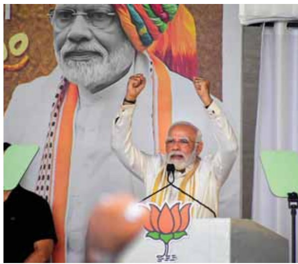
Prime Minister Narendra Modi addresses a public meeting in Kochi on Thursday

Modi said the nation is on a new path of progress and development. "The NDA Government at the Centre is setting up medical colleges in each district of the country. This would help the youth of