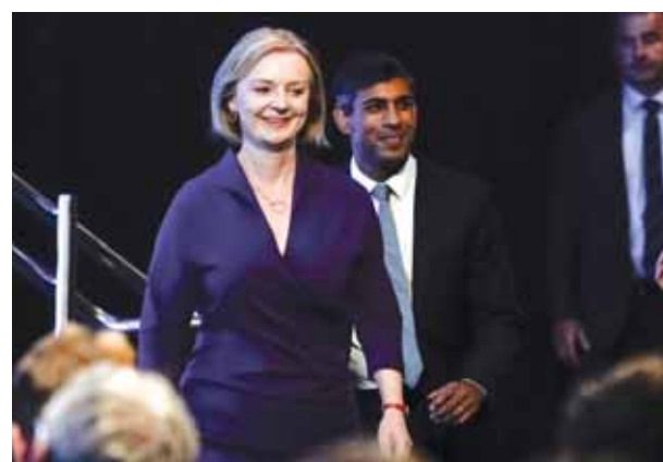
Liz Truss, left, and Rishi Sunak arrive for the announcement of the result of the Conservative Party leadership contest at the Queen Elizabeth II centre in London on Monday