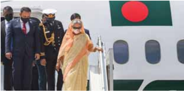
Prime Minister of Bangladesh Sheikh Hasina upon her arrival at AFS Palam in New Delhi on Monday

On the first day of her state visit, External Affairs Minister S Jaishankar called on the