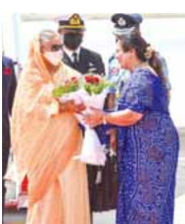
Prime Minister of Bangladesh Sheikh Hasina being received by Minister of State Darshana Jarosh upon her arrival at AFS Palam in New Delhi on Monday

Kabul: A suicide bombing outside the Russian Embassy in the Afghan capital of Kabul on Monday killed two members of the embassy staff and at least one Afghan civilian in what Moscow denounced as an "unacceptable terrorist act."