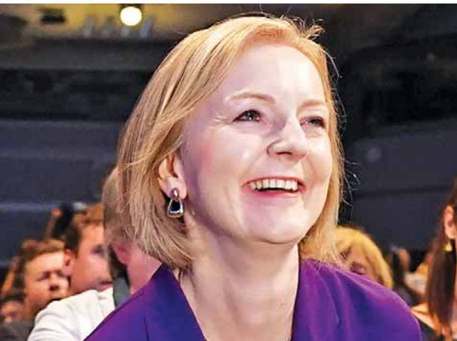
Britain's Conservative Party has chosen Foreign Secretary Liz Truss as the party's new leader, putting her in line to be confirmed as Prime Minister. Truss's selection was announced Monday in London after a leadership election in which only the 180,000 dues-paying members of the Conservative Party were allowed to vote