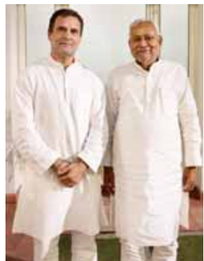
Bihar Chief Minister Nitish Kumar meets Congress leader Rahul Gandhi at the latter's residence in New Delhi on Monday

Nitish's deputy and the major alliance partner RJD's Tejashwi Yadav had already met Congress chief Sonia Gandhi as well as CPI general secretary Sitaram Yechury and CPIM general secretary D Raja.