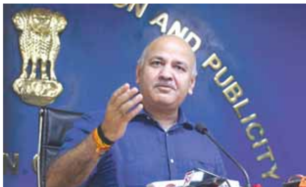
Delhi Deputy CM Manish Sisodia addresses a Press conference at Delhi Secretariat on Monday