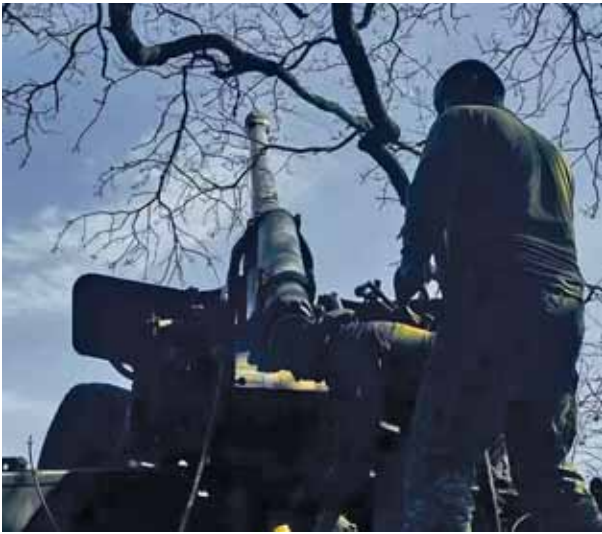
KYIV

At least four civilians were killed and seven others were wounded by Russian shelling in the past 24 hours across several regions of Ukraine, Ukraine's presidential office said Monday.