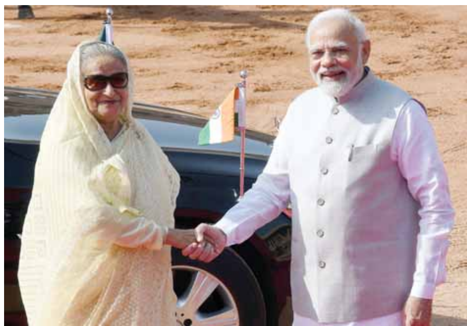
Prime Minister Narendra Modi with his Bangladeshi counterpart Sheikh Hasina during her ceremonial reception at the Rashtrapati Bhavan in New Delhi on Tuesday