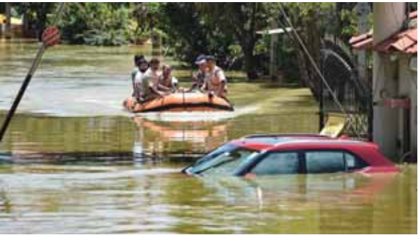
PTI ■ BENGALURU

Karnataka Chief Minister Basavaraj Bommai on Tuesday blamed the previous Congress Governments’ “mal-administration” and unprecedented rains in the capital city for the deluge.