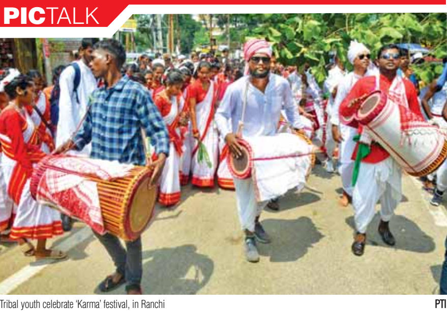
Tribal youth celebrate 'Karma' festival, in Ranchi

Third woman Prime Minister after Thatcher and Theresa May, Truss has promised to cut taxes and deal with a growing energy crisis. A massive economic crisis greets Truss, with inflation at 13 per cent, the highest in four decades, and projected by Goldman Sachs to climb to 22 per cent. Deutsche Bank has warned of the risk of a balance of payment crisis. The fiscal situation is also tight. Against this backdrop, Truss' insistence on no new taxes and less regulation will help, because it will help the economy. From India's perspective, her term should be good. She is likely to soon sign the comprehensive free trade agreement (FTA) with India. India is convinced of that. Commerce Secretary BVR Subrahmanyam said the "Diwali deadline is not going to be missed. Mark my words." Also, Truss is quite tough on China. In a speech earlier this year, she said, "China and Russia have spotted an ideological vacuum and they're rushing to fill it. They are emboldened in a way we haven't seen since the Cold War. As freedom-loving democracies, we must rise up to face these threats. As well as Nato, we are working with partners like Australia, India, Japan, Indonesia and Israel to build a global network of liberty." Such an attitude will help India counter a bellicose China better. In a nutshell, we can expect that Truss' premiership will benefit us.