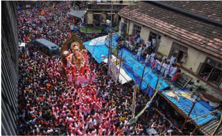
Devotees take Lalbaughcha Raja for immersion in the Arabian Sea, in Mumbai on Friday. The immersion marks the end of the ten-day-long Ganesh Chaturthi festival that celebrates the birth of Lord Ganesha.

He added that the Central and the state governments under the leadership of Prime Minister Narendra Modi, worked to save lives and livelihoods during COVID-19, and also implemented the National Education Policy (NEP) to ensure that the youth became capable of practical and technical knowledge. “Fifty-six per cent of our state’s population belongs to the working class and the government is working its best to give a platform to talent and energy to youth through NEP, the establishment of new universities, colleges, Abhyudaya scheme and more,” he said.