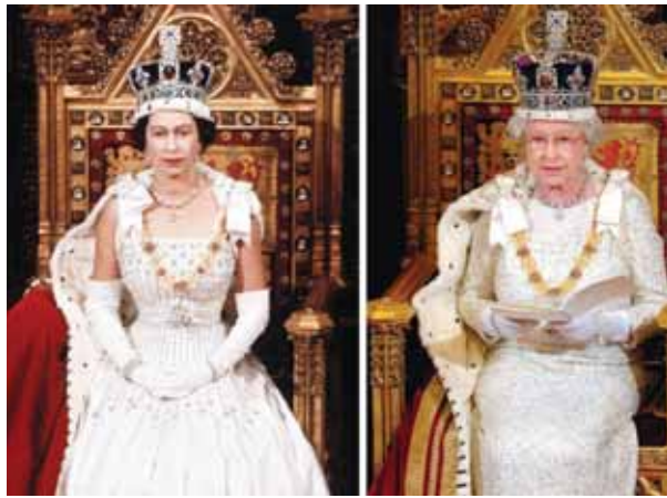
This photo combo shows Queen Elizabeth II during the State Opening of Parliament in April 1966; and Nov 15, 2006 (right)

Three trumpeters announce the proclamation with a fanfare. The proclamation is read out from a balcony at St James's Palace in London, then across the country. Charles will hold audi-