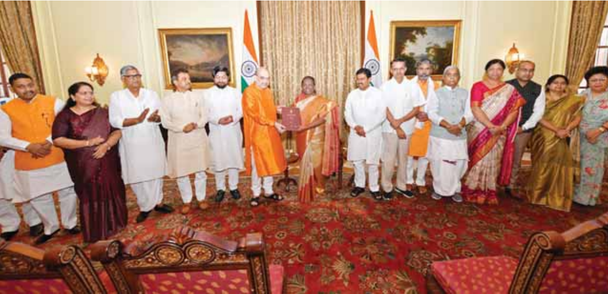
Union Home Minister and Chairman of the Parliamentary Committee on Official Language Amit Shah, along with the members of the Committee, calls on President Murmu and presents the 11th volume of the report of the Parliamentary Committee on Official Language