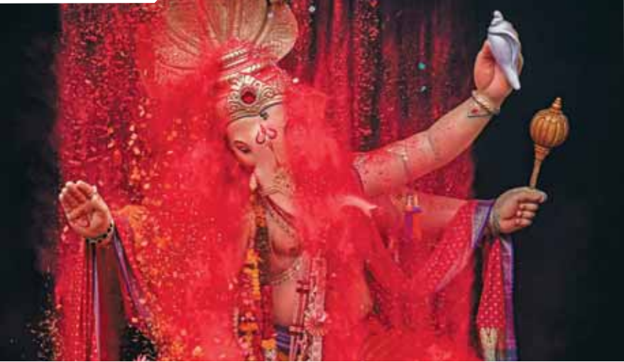
Flower petals and coloured powder being showered on an idol of Lord Ganesha during immersion procession, in Mumbai