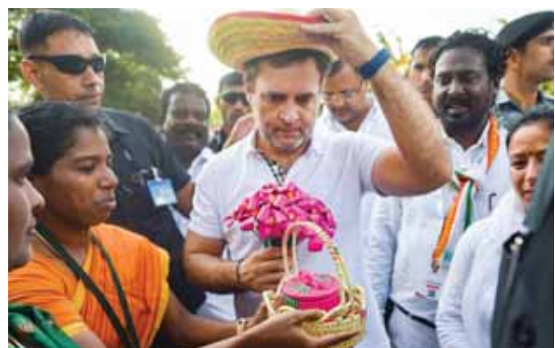
Congress leader Rahul Gandhi being greeted by party workers during the 'Bharat Jodo Yatra' in Kanyakumari district on Friday