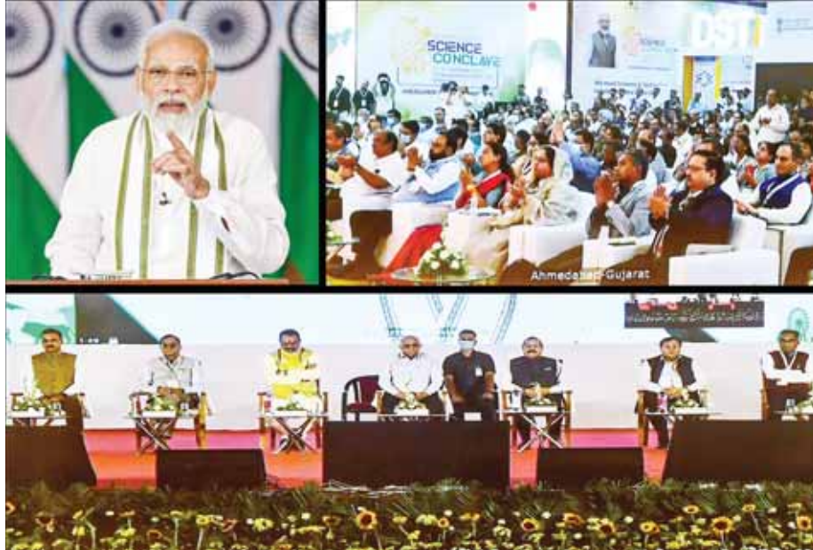
Prime Minister Narendra Modi during the inauguration of the 'Centre-State Science Conclave' in Ahmedabad, through video conferencing from Delhi on Saturday

His Jharkhand counterpart Hemant Soren is embroiled in a mining contro-