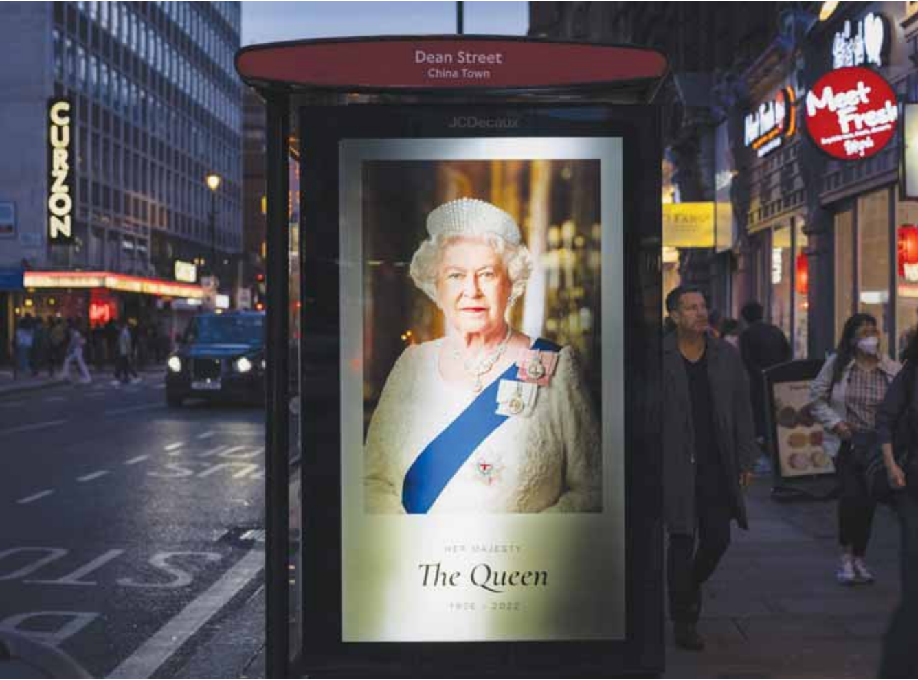
A tribute to Queen Elizabeth II on a bus stop in London's West End

The Queen was the head of the 56-member Commonwealth nations around the world. Her Commonwealth leadership though purely ceremonial spanned across all the five continents covering a population of almost 2.5 billion. Today, the Commonwealth is proud that during her tenure as the Head of the organisation, she travelled to almost all the nations of the bloc. Between 1971 and 2018, the Queen missed only one Head of Government Meeting. Her awesome sense of duty and responsibility as the head of the group was always reflected in her actions. She was both a generous host and a consummate diplomat. The last message she sent out for the Commonwealth described the nations as “a modern, vibrant and connected Commonwealth that combines a wealth of history, and tradition with great social, cultur-