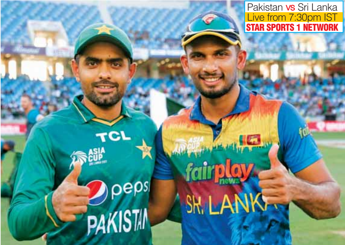
Pakistan vs Sri Lanka Live from 7:30pm IST STAR SPORTS 1 NETWORK

But in Sri Lanka, they have an opposition that could be more than handful and a team that has certainly redeemed itself in a format where they had become world champions back in 2014.