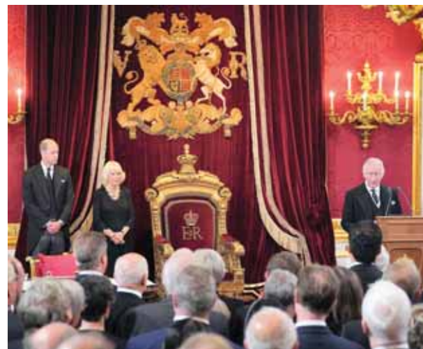
From left, Britain's Prince William, Camilla, the Queen Consort and King Charles III, before Privy Council members in the Throne Room during the Accession Council at St James's Palace, London on Saturday