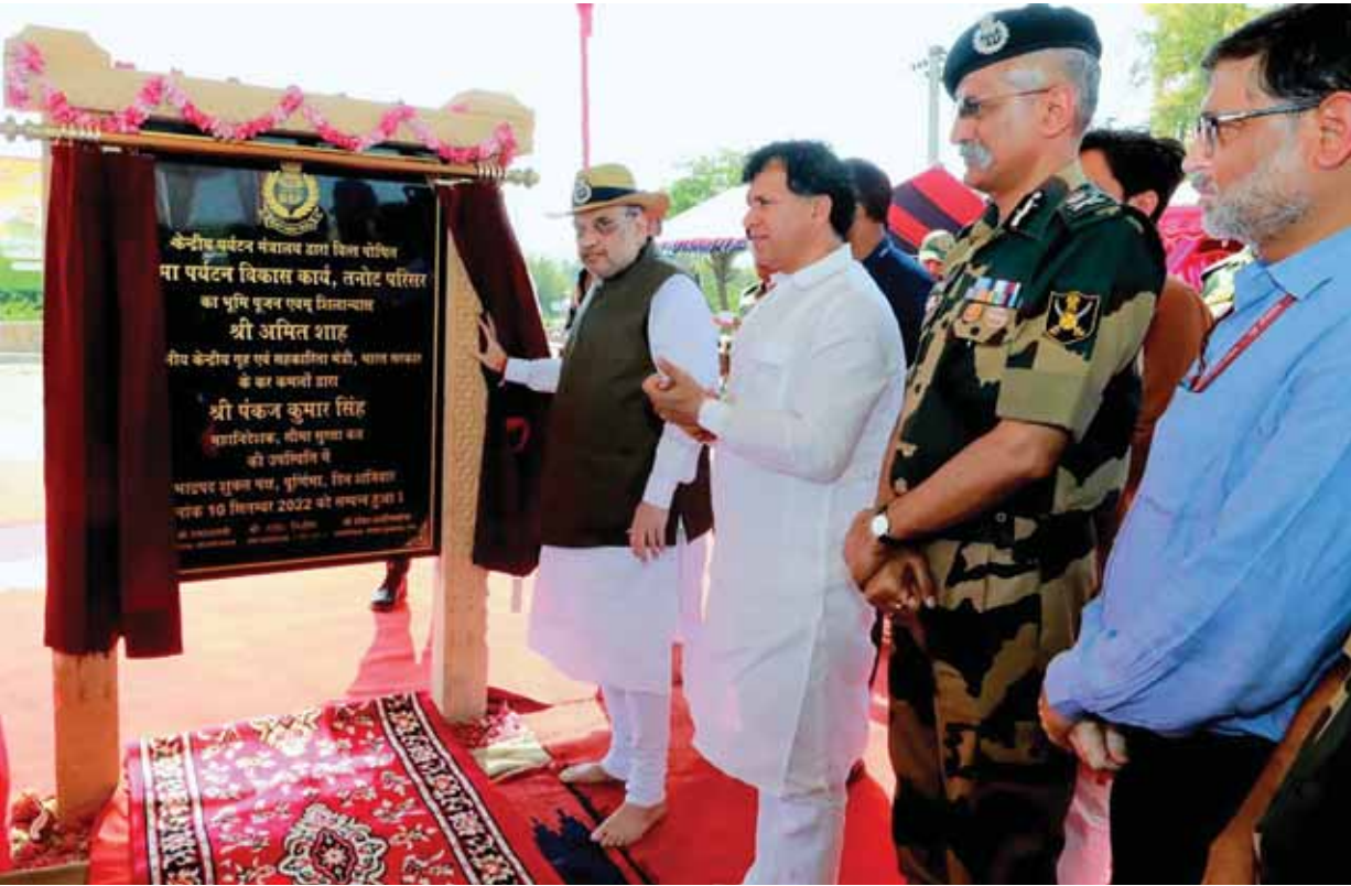
Union Home Minister Amit Shah inaugurates 'Shri Tanot Mandir Complex' project under Border Tourism Development Work, on the premises of the Tanot Mata temple, in Jaisalmer

A majestic life size mural of the General was also unveiled. The event was witnessed by citizens of Kibithu and Walong. The dedication ceremony has further synergized Civil – Military relations and is a befitting tribute to the first CDS