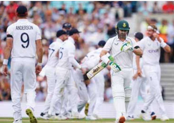
Brendon McCullum took charge at the start of this season.

Victory would mean England had won six of their seven Tests since a new leadership duo of Stokes and coach