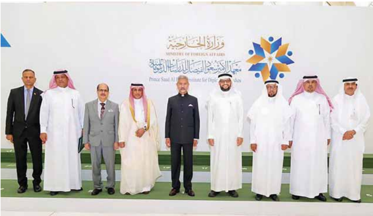
External Affairs Minister S Jaishankar during his visit to the Prince Saud Al Faisal Institute of Diplomatic Studies in Riyadh, Saudi Arabia

Defence Minister Rajnath Singh tweeted in Hindi, "Dwarka peeth Shankaracharya Swami Swaroopanand Saraswati ji's death has caused a feeling of anguish in me. Besides making India's cultural and religious traditions prosper, he also worked for social welfare. My deepest condolences to his followers from the bottom of my heart."