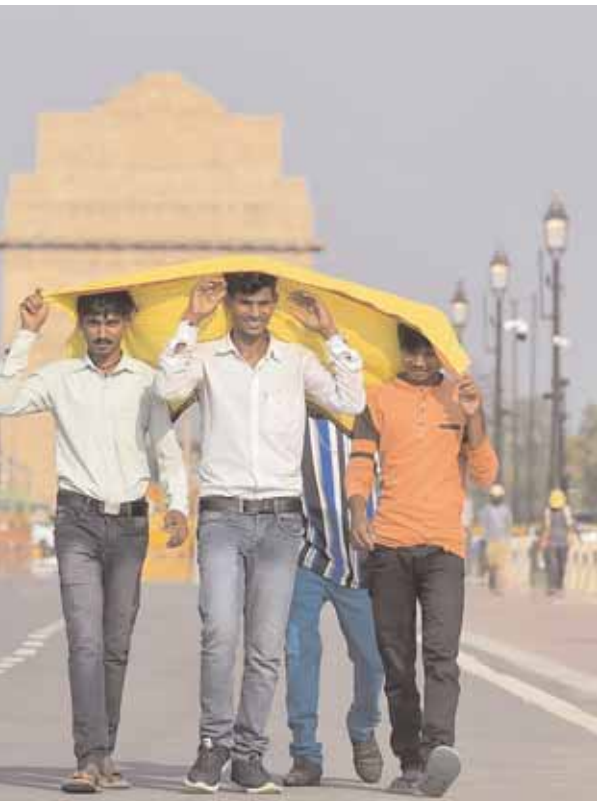
Tourists use a cloth to shield themselves from the heat as they visit India Gate, in New Delhi on Sunday