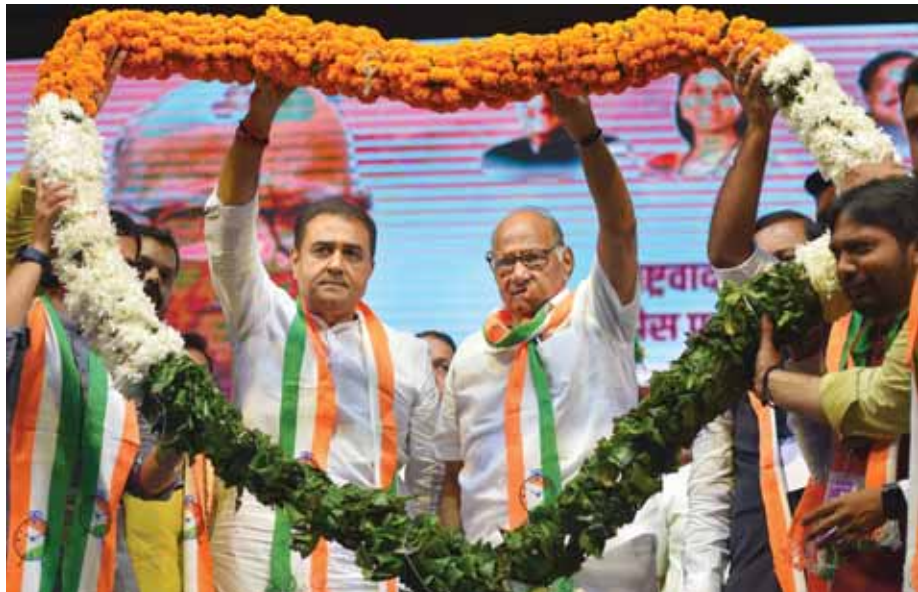
NCP president Sharad Pawar being felicitated by party leader Praful Patel and others a day after he was unanimously re-elected as the party chief, during the party's national council meeting in New Delhi on Sunday

Bihar Chief Minister Nitish Kumar, who was in Delhi recently met Pawar and discuss ways to unite the Opposition.