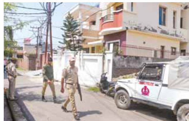
Police personnel deployed during a search by CBI officials in connection with alleged irregularities in the recruitment process of sub-inspectors in the Union Territory, in Jammu on Tuesday