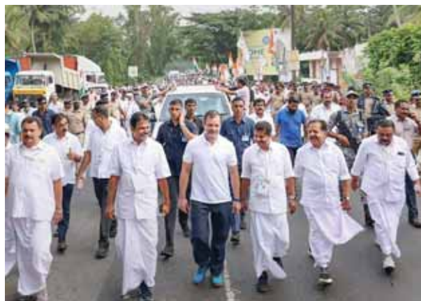
Congress leader Rahul Gandhi with party leaders and workers during the Bharat Jodo Yatra in Thiruvananthapuram district on Tuesday

The CPI(M) "ridiculed" Rahul's yatra for excluding cru-