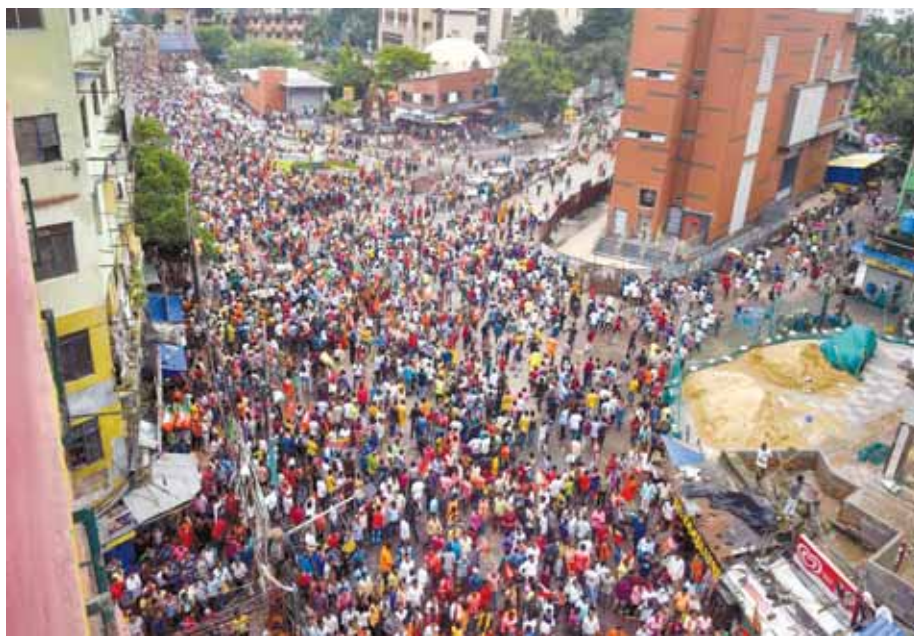
BJP supporters during their 'Nabanna Abhiyan' (March to Secretariat) to protest against alleged corrupt practices of the TMC Government, in Howrah district on Tuesday

The skirmish was more fierce in Kolkata where a section of the third chapter of the