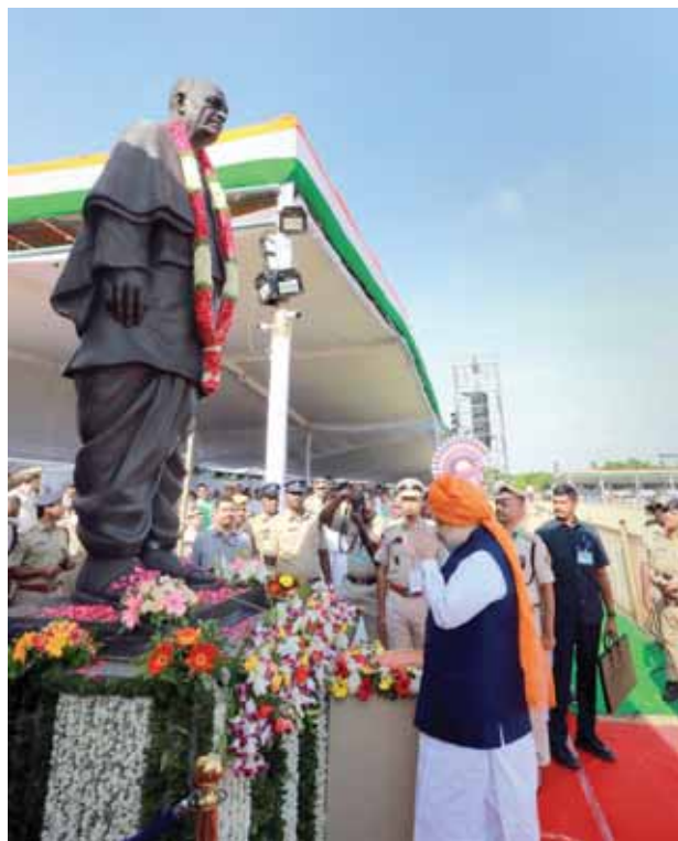
Union Home Minister Amit Shah during celebrations of 'Hyderabad Liberation Day' at Parade Ground in Hyderabad on Saturday; (R) Chief Minister K Chandrasekhar Rao pays tributes at the Telangana Martyrs Memorial on the occasion of 'Telangana National Integration Day' in Hyderabad on Saturday

"The time has arrived! It's 10 am and the #PMMementosAuction2022 is now open & live! Head to HYPERLINK "http://pmmementos.Gov.In" pmmementos.Gov.In to register & participate in the auction in which exclusive gifts received by Prime Minister @NarendraModi have been listed," Union Culture Minister G Kishan Reddy tweeted.