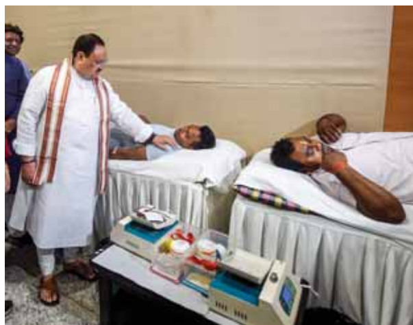
BJP president JP Nadda during inauguration of a 15-day blood donation drive 'Raktdaan Amrit Mahotsav' in New Delhi on Saturday