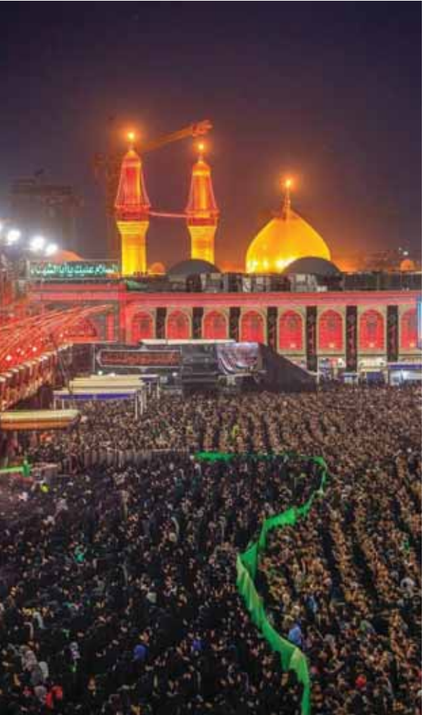
Shia pilgrims participate in the Arb'een pilgrimage in Iraq