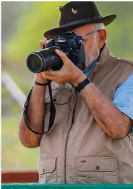
Prime Minister Narendra Modi clicks photographs of one of cheetahs released inside a special enclosure of the Kuno National Park. (Left) A cheetah inside the enclosure of the park in Madhya Pradesh on Saturday