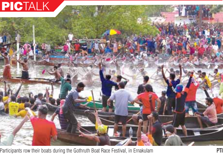
Participants row their boats during the Gothruth Boat Race Festival, in Ernakulam

Instead of highlighting such real issues, the GOP gets distracted by the events organised by the government and the BJP. Also, Congress leaders have the propensity to respond to every statement made by BJP spokespersons. What happens in the process is that the agenda gets determined by the BJP, with the Congress reduced to responding to it. It means playing on a pitch prepared by the saffron party. Unfortunately for GOP supporters, this has been happening for a very long time. The Rajiv Gandhi government, in order to assuage the feelings of the Hindus in the wake of its disastrous Shah Bano decision, allowed the opening of the Ram Temple at Ayodhya in 1986. While the Shah Bano decision had offended the Hindus, the opening angered the Muslims and cost the Congress dear—a cost that the GOP is still paying. In the run-up to the last general elections, senior Congress leader Rahul Gandhi tried to flaunt his Hinduness; he was presented as a janeudhari Brahmin. Both gambits failed, indeed boomeranged. The reason was simple: the Congress was playing a game it knew little about. Besides, if the Hindus have to vote on account of their faith, they would vote for a party which is unabashedly Hindu, which is the BJP. Apparently, the Congress has not learnt many lessons from its mistakes; it still furthers the BJP agenda by responding to it.