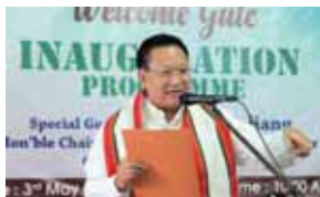
United Democratic Alliance Chairman TR Zeliang

Nagaland's United Democratic Alliance Chairman T R Zeliang claimed that the National Socialist Council of Nagalim-Isak Muivah (NSCN-IM) has agreed to resume peace talks with the Centre to try to resolve irritants to the Naga peace talks. Zeliang, who is also the co-chairman of the State Government's core committee on the Naga political issue, said an NSCN-IM delegation is likely to leave for Delhi on Monday. Negotiations between the Centre and the National