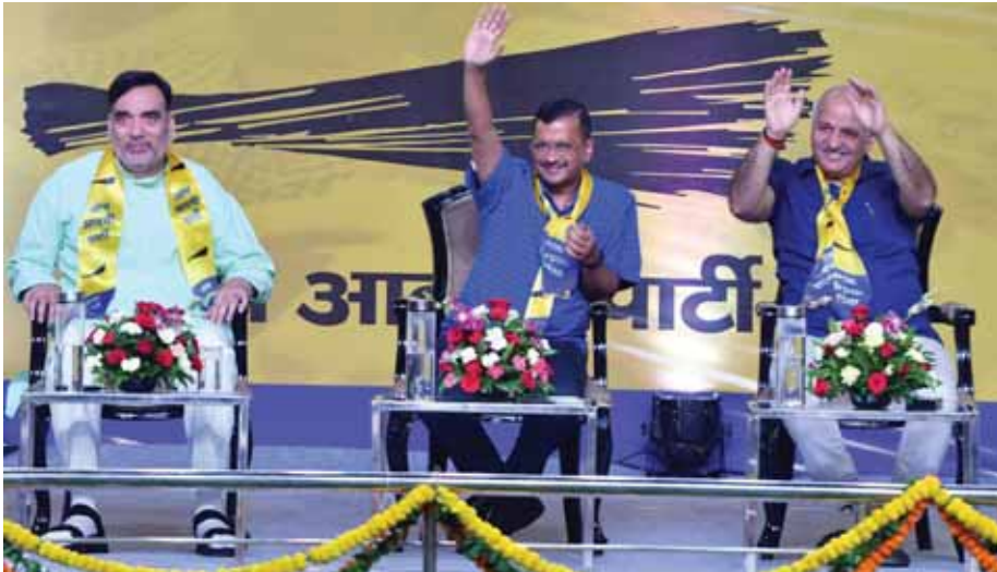
Delhi Chief Minister Arvind Kejriwal, Deputy Chief Minister Manish Sisodia and Delhi Environment Minister Gopal Rai at the AAP's national convention, in New Delhi on Sunday.

The six-point agenda includes better healthcare facilities for all, five years to alleviate poverty in India, employment for every youth, security and equal opportunity for women, world-class infrastructure and full prices for crops for farmers.