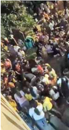
Students on a dharna outside their university in Punjab.

However, the claim by the cops that only one girl's video was leaked by her boyfriend on social media was rejected by the irate students, who described it as a "cover up". Even as Chief Minister Bhagwant Mann ordered a probe into the matter, the university authorities claimed that no such incident took place. Continued on Page 2