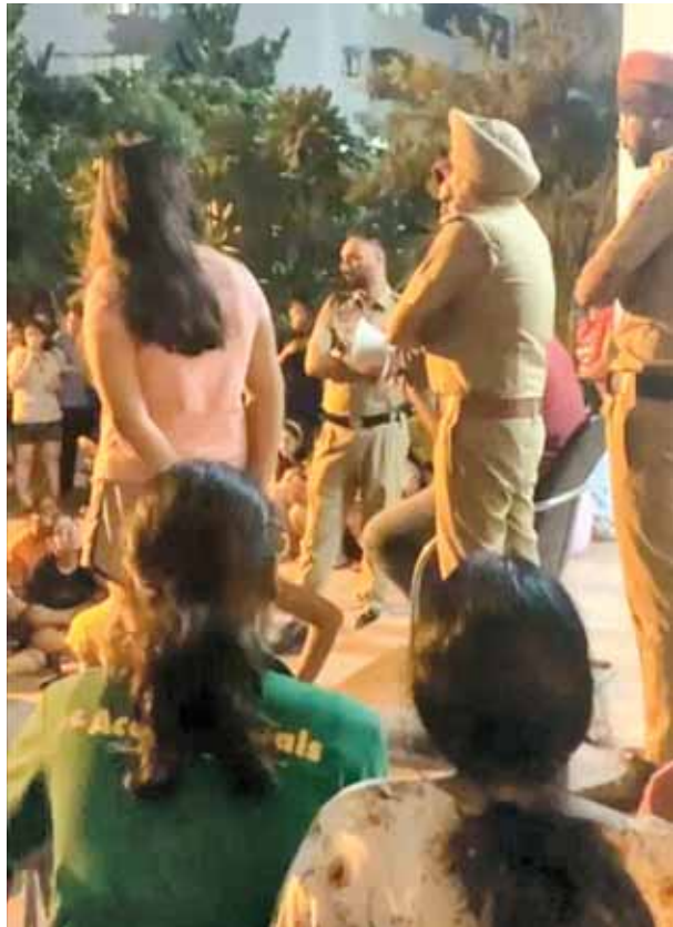
Police talking to the protesting students and assuring them of action against the accused.

The protests continued even as the management and the Punjab Police assured them that the accused girl, who was promptly arrested by the police, had only shared her personal raunchy video with a male friend in Shimla, Himachal Pradesh. The youth was also arrested for sharing the "objectionable videos" of girl students on social media. His arrest