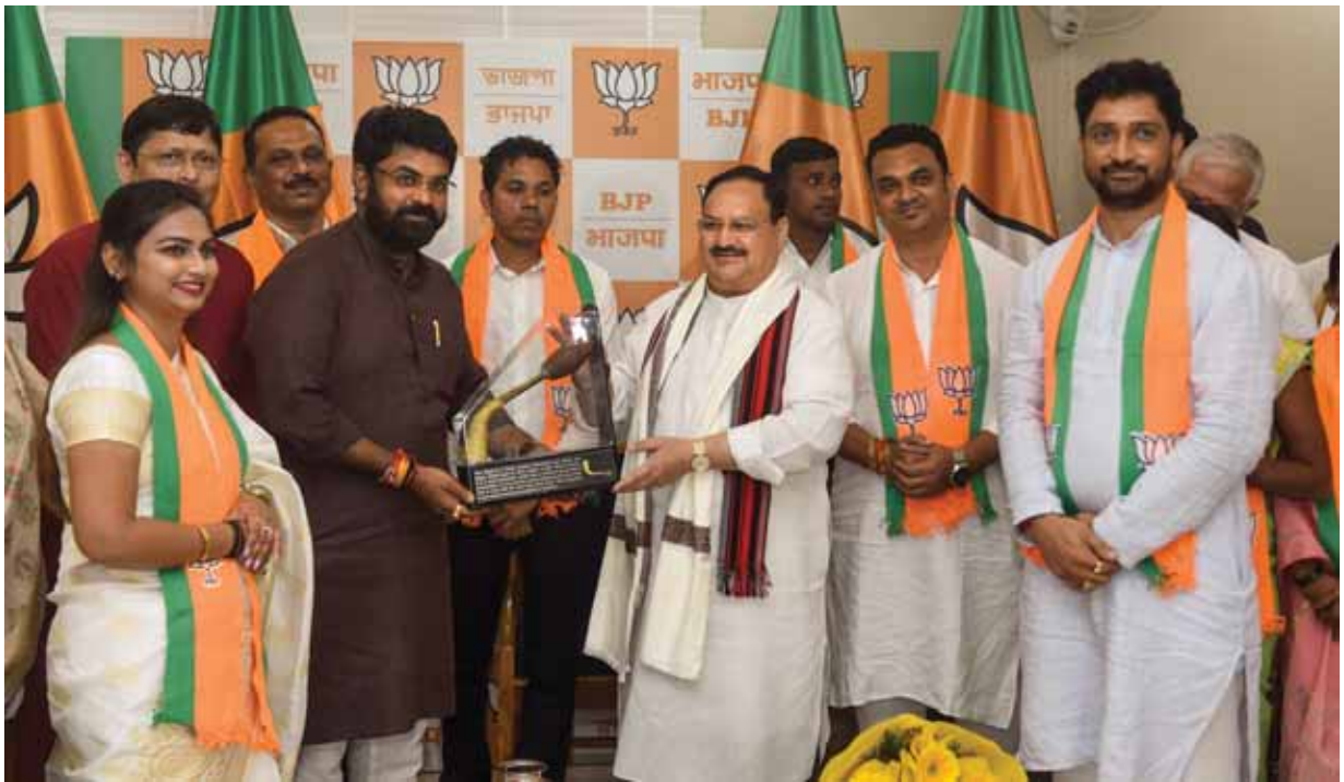
BJP national president JP Nadda during a felicitation event to mark the joining of 15 district panchayat members of JD(U) Daman and Diu unit, in New Delhi on Sunday

Ramesh said the Yatra was not aimed at state elections in the run-up to the Lok Sabha polls. When told that the Congress is speaking of "Bharat Jodo" when the party itself is in disarray, Ramesh said the outfit is trying to fix its internal issues.