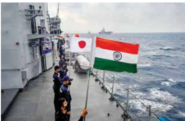
Sixth edition of the Japan India Maritime Exercise 2022 JIMEX 22 hosted by the Indian Navy concluded in the Bay of Bengal with a customary steam past on Sunday