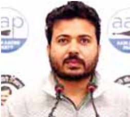
STAFF REPORTER ■ NEW DELHI