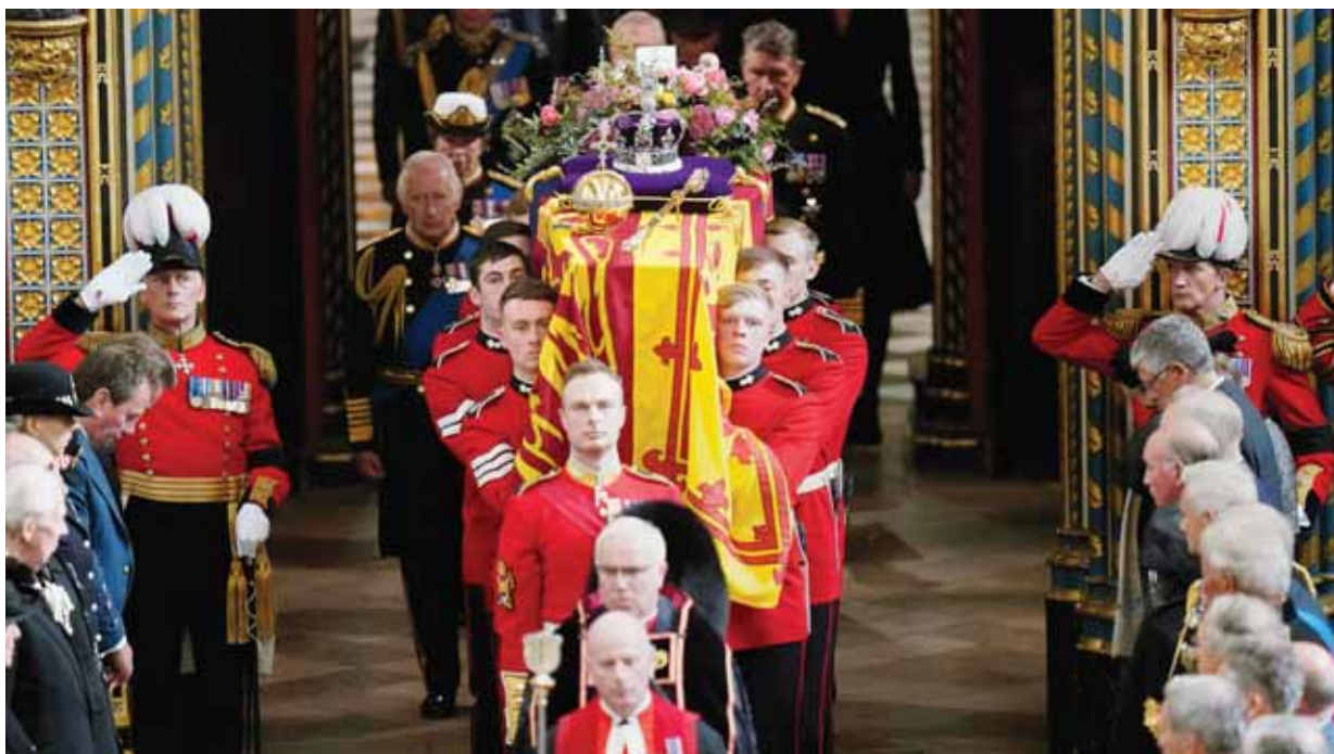
King Charles III and members of the Royal family follow behind the coffin of Queen Elizabeth II, draped in the Royal Standard with the Imperial State Crown and the Sovereign's orb and sceptre, as it is carried out of Westminster Abbey after her State Funeral, in London, on Monday. The Queen, who died aged 96 on September 8, was buried at Windsor alongside her late husband, Prince Philip, who died last year