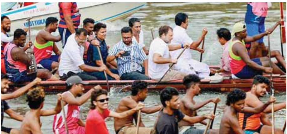
Congress leader Rahul Gandhi participates in a snake boat race exhibition in Punnarnada Lake of Kerala, on Monday. Rahul is in Kerala for the Bharat Jodo Yatra