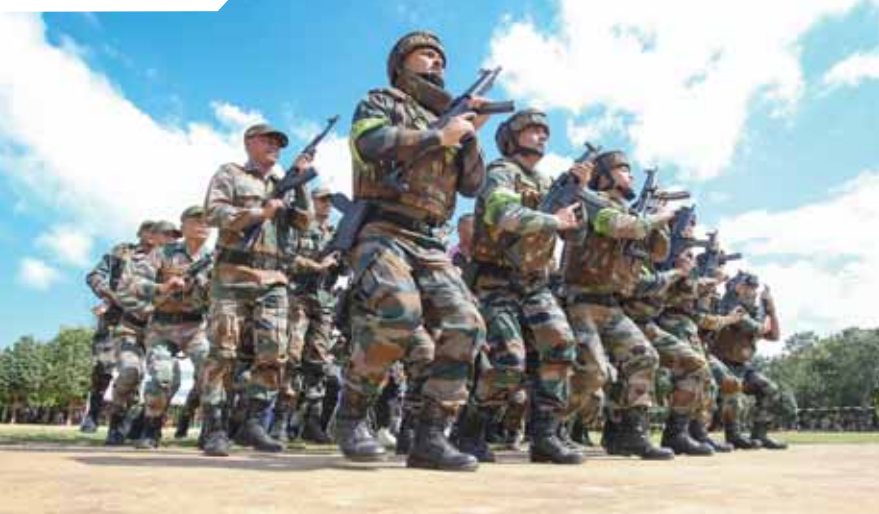
The commandos of 2nd Battalion, Tripura State Rifles, march on their 32nd Raising Day, in Agartala