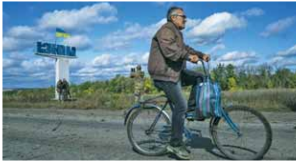
■ IZIUM

The school was a shattered mess. Its six-month life as a Russian base and mechanic shop ended in August with a Ukrainian missile strike. Its years educating Izium's youth were over, but it had one last gift for the residents who needed so much: the wood that made up its lattice work, its chalkboards, its furniture and beams. A handful of elderly residents — some prepared with gloves, sturdy woven bags, and hand tools — came by Monday to salvage firewood from the rubble. It will be months, if not longer, before meaningful electricity, gas and running water are restored, and a chill is already settling in. This city in far eastern Ukraine was among the first taken by Russian forces after the war started on Feb. 24, and it became a command center for them. By early March, Izium was isolated — no cell phones, no heat, no power. Residents didn't know what was going on in the war, whether their relatives were alive, whether there was still a Ukraine. They were liberated in a swift counteroffensive on Sept. 10 that swept through the Kharkiv region, and that continues in the south, near Kherson. But residents are still