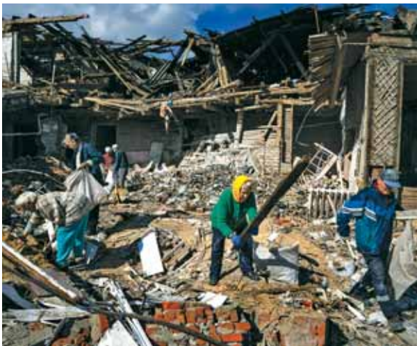
AP ■ KYIV