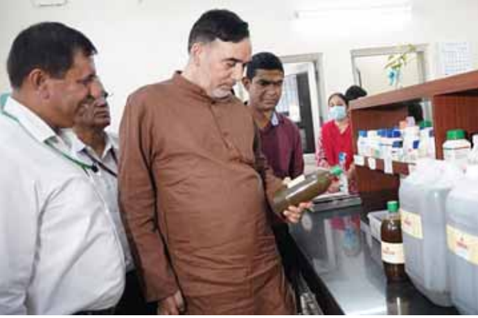
Environment Minister Gopal Rai visits IRAL Pusa to see the production facilities for the bio-decomposer being made at Pusa Institute in New Delhi on Tuesday.

"On September 20, at least 10 cases of stubble burning were reported, there were 18 cases on