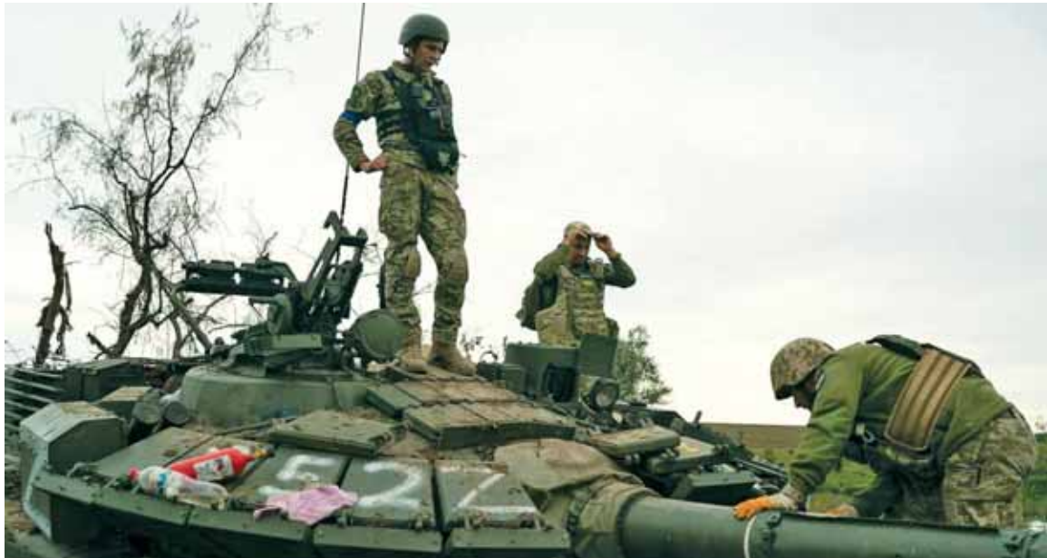
AP ■ KYIV

Ukraine is now deploying captured Russian tanks to solidify its gains in the northeast amid an ongoing counteroffensive, a Washington-based think tank said Tuesday, as Kyiv vowed to push further into territories occupied by Moscow. The Institute for the Study of War, citing a Russian claim, said that Ukraine had been using left-behind Russian T-72 tanks as it tries to push into the Russian-occupied region of Luhansk. "The initial panic of the counteroffensive led Russian troops to abandon higher-quality equipment in working order, rather than the more damaged