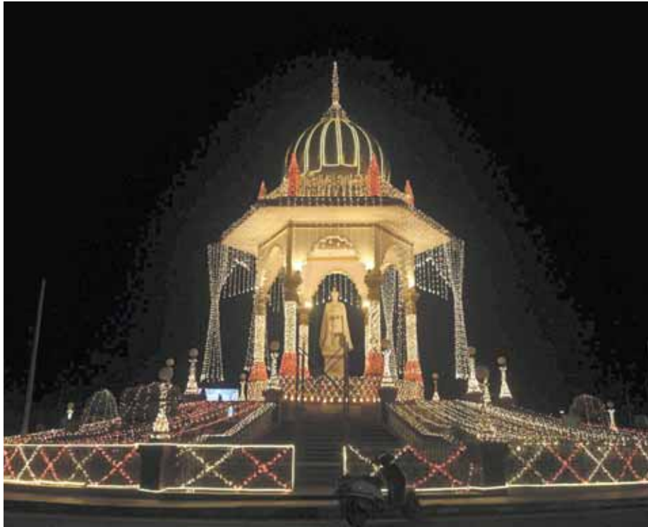
A roundabout illuminated as part of preparations for Dasara celebrations, in Mysuru on Tuesday.