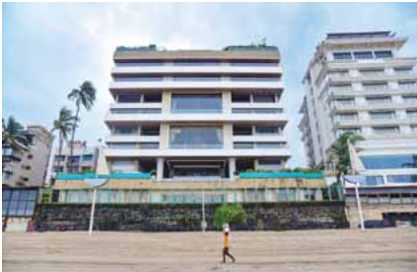
Bungalow of Union Minister for Micro, Small and Medium Enterprises Narayan Rane, at Juhu in Mumbai