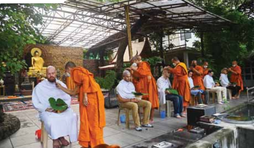
Six students from the US get ordained as Buddhist monks at the Royal Thai Monastery, in Bodhi Gaya