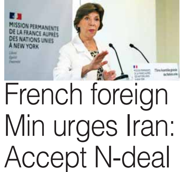
AP ■ UNITED NATIONS

France's foreign minister is urging Iran to take the last offer on the table to revive the 2015 nuclear deal with the United States and key powers, saying the window of opportunity "is about to close." In a wide-ranging press conference on the sidelines of this week's gathering of world leaders at the UN General Assembly, Catherine Colonna also accused Russia of waging unjustified aggression against Ukraine "in a very brutal way" with shelling of civilian targets, violent acts, "rapes, torture and forced liquidation". "All of these are war crimes," she said. Colonna said France will be convening a meeting Wednesday with UN nuclear chief Rafael Grossi on the precarious state of the Zaporizhzhia nuclear plant in southeastern Ukraine, Europe's largest, is occupied by Russia. She said she spoke to Russian Foreign Minister Sergey Lavrov Monday morning on the need for Ukraine, Russia, and all countries in the world "to avoid a nuclear catastrophe". She said Lavrov seemed to be "open to listening to some detailed proposal" by Grossi who has called for a "nuclear safety and security protection zone" around the Zaporizhzhia plant. Colonna also called on China to stop its "very aggressive" behaviour toward Taiwan. She stressed that "the status quo must not be questioned by China and not by using means that are not peaceful."