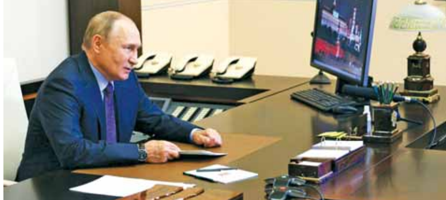
MOSCOW

Russian President Vladimir Putin on Tuesday blasted what he described as US efforts to preserve its global domination and ordered officials to boost weapons production amid the fighting in Ukraine. Speaking while receiving credentials from foreign ambassadors to Moscow, Putin said "the objective development toward a multipolar world faces resistance of those who try to preserve their hegemony in global affairs and control everything — Latin America, Europe, Asia and Africa." He added that "the hegemon has succeeded in doing so for quite a long time, but it can't go on forever ... Regardless of the developments in Ukraine." Putin has repeatedly cast his decision to send troops into