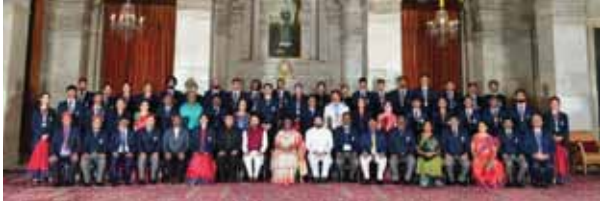
President Droupadi Murmu in a group photograph with awardees at the presentation of the National Service Scheme (NSS) Awards for 2020-21 to universities, NSS units and NSS volunteers at Rashtrapati Bhavan, in New Delhi on Saturday

New Delhi: The President of India, Droupadi Murmu, presented the National Service Scheme Awards for the year 2020-2021 at Rashtrapati Bhavan today.