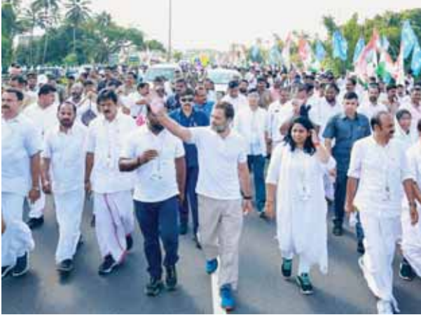
Congress leader Rahul Gandhi during the 17th day of party’s ‘Bharat Jodo Yatra’ in Thrissur, Kerala

The Congress’ Bharat Jodo Yatra will cover 3,570 km in 150 days. It started from Kanyakumari in Tamil Nadu on September 7 and will conclude in Jammu and Kashmir.