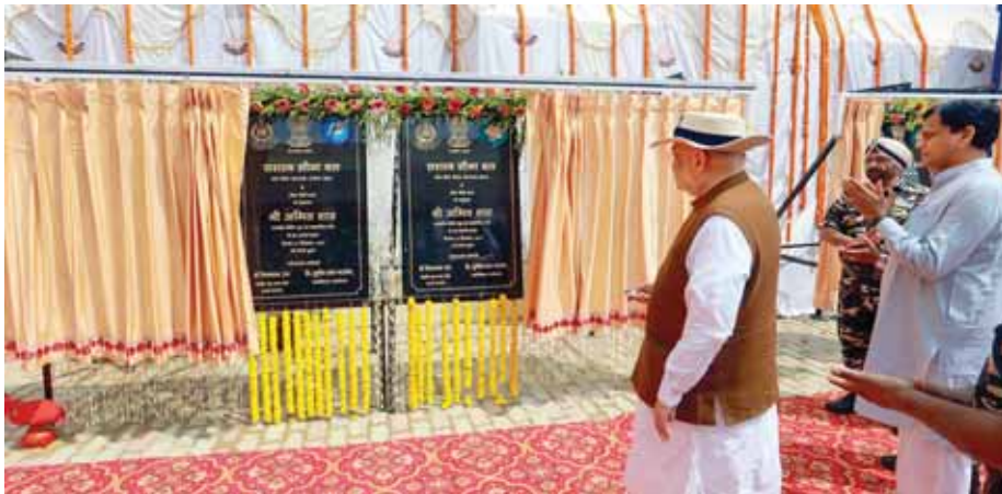
Union Minister for Home Affairs and Cooperation Amit Shah during inauguration of five Border Outposts of 'Sashastra Seema Bal', in Fatehpur, Bihar, on Saturday

Rajnath said country's goal is not only to make items for its needs, but also to export defence items to other countries. "I can say we are moving fast towards fulfilling dreams of Pandit Deendayal Upadhyay," he said.