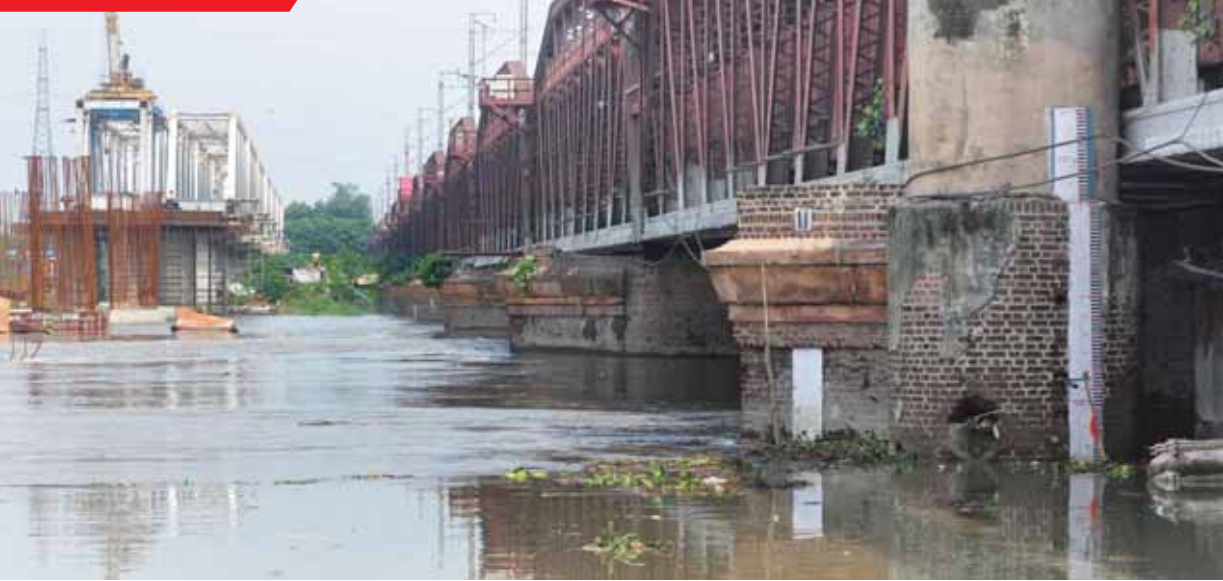
The water level rises in the Yamuna River in New Delhi on Monday. It is expected to rise further owing to rain in catchment areas