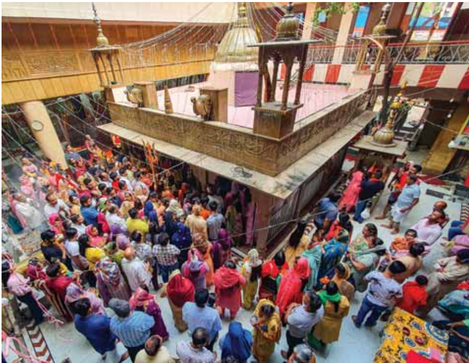
Devotees offer prayers at the Mata Longa Wali Devi Temple on the first day of 'Navratri' festival, in Amritsar on Monday