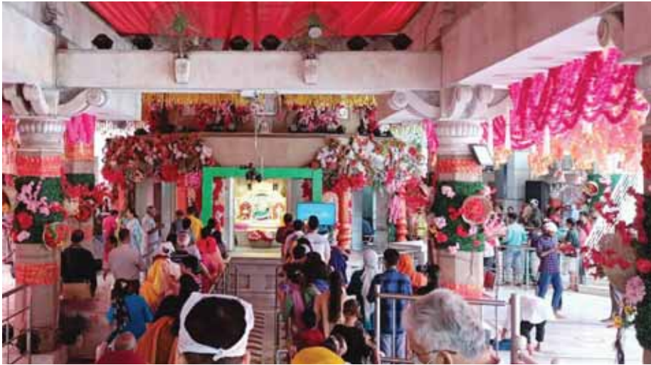
Devotees offer prayers at the Jhandewalan Temple on the first day of Navaratri festival, in New Delhi on Monday.

These areas include the Netaji Subhash Marg, Nishad Raj Marg, JLN Marg, Ambedkar Nagar, Sarojini Nagar, Greater Kailash, South Avenue, Sadar Bazar in Delhi Cantonment, Sector 5 in RK Puram, Dwarka South, Dwarka North, Uttam Nagar, Punjabi Bagh, Kirti Nagar, Hari Nagar, Vikasपुरi, Nairana, Jalebi Chowk in Sultanpuri, NSP Lala Jagat Narayan Marg, Keshav Puram, Near Kushal Cinema in Jahangirpuri, Shalimar Bagh,