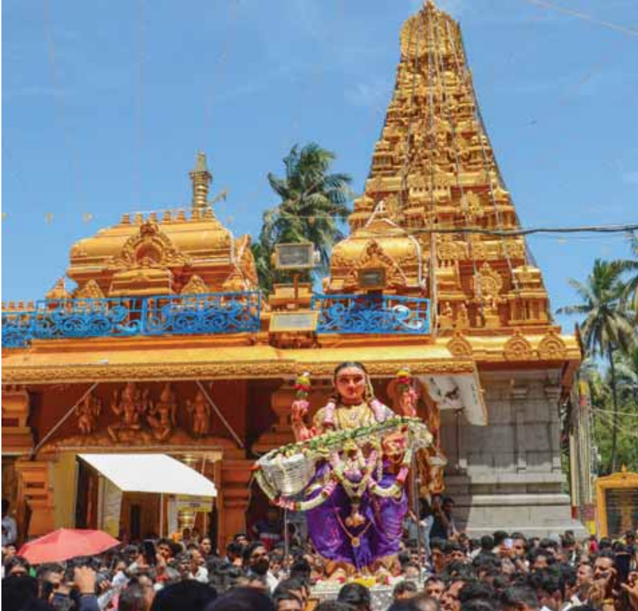
Devotees participate in a religious procession to install an idol of Goddess Sharada at Kudroli Sri Gokarnanatheshwara Temple on the first day of 'Navratri' festival, in Mangaluru on Monday.

On January 5, 2014 India successfully flew GSLV-D5 with a cryogenic engine (made by ISRO through private industries) and became the sixth country in developing cryogenic engines. Space exploration in the future is mostly dependent upon cryogenic technology.