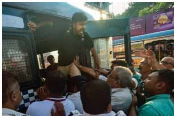
Association for Protection of Democratic Rights (APDR) and Bandi Mukti Committee members being detained by police during a protest against the ban on PFI and its affiliate organisations, in Kolkata on Thursday