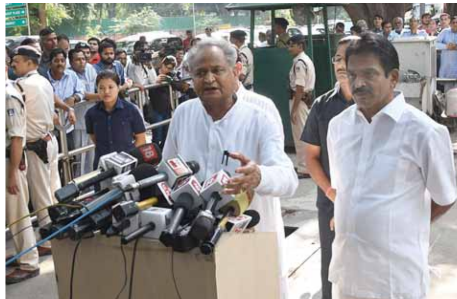
Rajasthan Chief Minister Ashok Gehlot addressing media persons after a meeting with party interim President Sonia Gandhi, at 10 Janpath in New Delhi on Thursday

Gehlot echoed the same view. Asked if he will continue as Chief Minister, Gehlot said Gandhi will decide on the issue. "I have apologised to Sonia ji because a simple resolution, which is our tradition and which we always pass could not be passed as a situation emerged. I, as a CLP leader, whatever the reasons, could not get the resolution passed," he said.