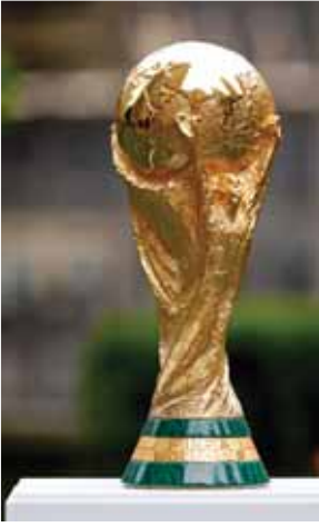
DOHA

Coronavirus vaccinations will not be mandatory for the million-plus fans going to the World Cup in Qatar this year, the Gulf state said Thursday. But players and match officials may be forced into a secure "bio-bubble" if Covid-19 cases take off again, with the threat of expulsion from the tournament for those who breach the secure environment, the health ministry said. The 29-day tournament will be the first major global sporting event with fans since the eruption in December 2019 of the Covid pandemic, which has since killed more than six million people. Qatari organisers, who have predicted that more than one million people will pack Doha for the matches, and football's governing body, FIFA, have said they want the event to be a sign the world is getting over the devastating pandemic. But Qatar's health ministry warned in its World Cup guidelines that special measures would be ordered "in the event of a worsening pandemic situation in the country", such as the emergence of a threatening new variant. With Covid-19 currently considered under control, "there will be no vaccination requirement for participants and visit-