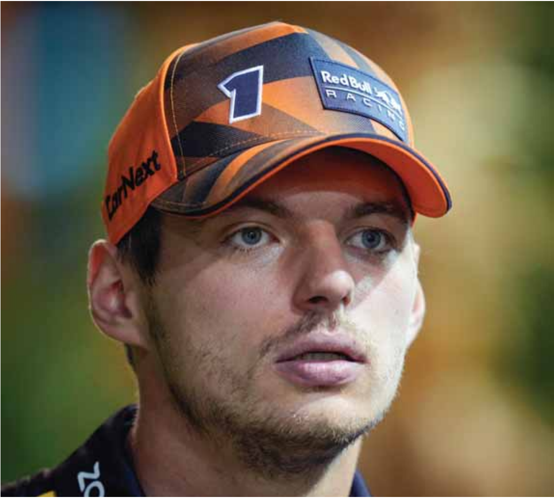
■ SINGAPORE

Max Verstappen on Thursday said he thinks he is "quite a long shot" to retain his Formula One world championship at this weekend's Singapore Grand Prix, even though it is mathematically possible. Red Bull driver Verstappen, who will celebrate his 25th birthday on Friday, is running away with the title battle but must win Sunday's race and then depend on his closest rivals faltering, or the fight will move on to Japan the following week. "I don't really think about the championship," said the dominant Dutchman, who has won 11 of 16 races in 2022 and the last five in a row. "It's quite a long shot and I just want to enjoy the weekend and of course try to win it," he told