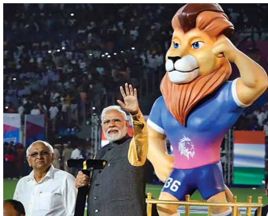
Prime Minister Narendra Modi during the inauguration of 36th National Games in Ahmedabad on Thursday