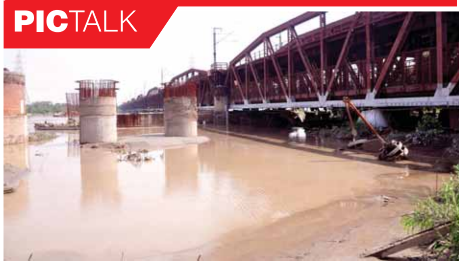
The water in Yamuna River receded slightly on Thursday but it is still above the danger mark of 205.33 metres and the affected people will have to wait for a few more days before they can return to their homes in low-lying areas along the river in Delhi.

The Excise department was learnt to be in favour of allowing sale of stock of liquor brands registered under excise policy implemented from September 1. "A decision about stock of those brands that were yet not re-registered is yet to be taken," said officer. If the stock is not allowed to be sold, then it will require to be destroyed as liquor can not be sold without a legitimate license, officials said.