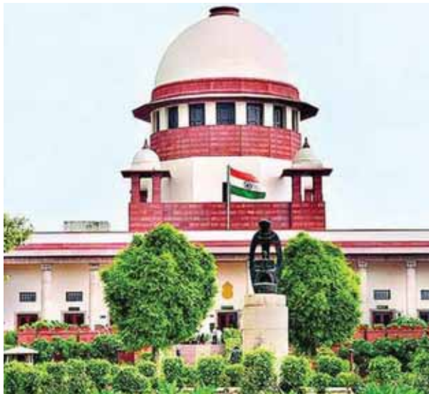
THE CATEGORIES OF WOMEN MENTIONED IN RULE 3B OF THE MTP RULES FRAMED BY THE CENTRAL GOVERNMENT

Under the MTP Act provisions, the upper limit for the termination of pregnancy is 24 weeks for married women,