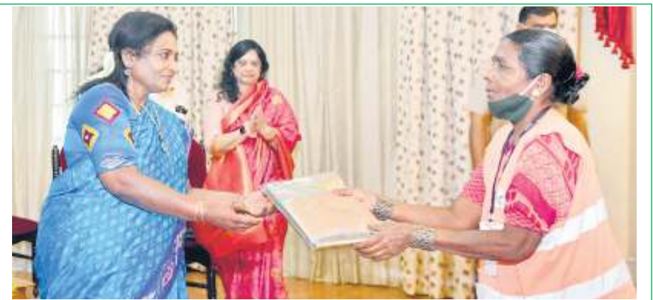
Governor Tamilisai Soundararajan distributing saris to Raj Bhawan parivar in Hyderabad on Saturday