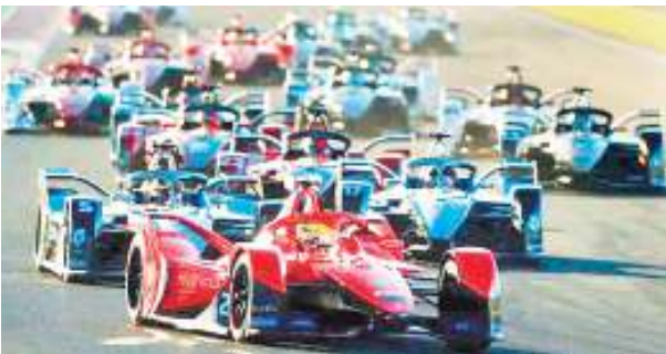
For representation purpose only

At 0 to 62 kmph in under three seconds, potential top speeds of 280 kmph, and hair-raising cornering, the Formula