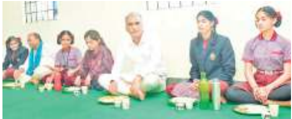
Minister for Finance T Harish Rao having lunch with schoolchildren in Zaheerabad in Sangareddy district on Saturday

the TRS government under the leadership of Chief Minister K Chandrashekar Rao had established a number of Gurukul schools. There were just 91 schools before the formation of the State, he said. The schools were upgraded to facilitate that children can continue their education up to Intermediate. Apart from Gurukul School, the government has also established 20 Girijan Residential Schools in the State. There are now 980