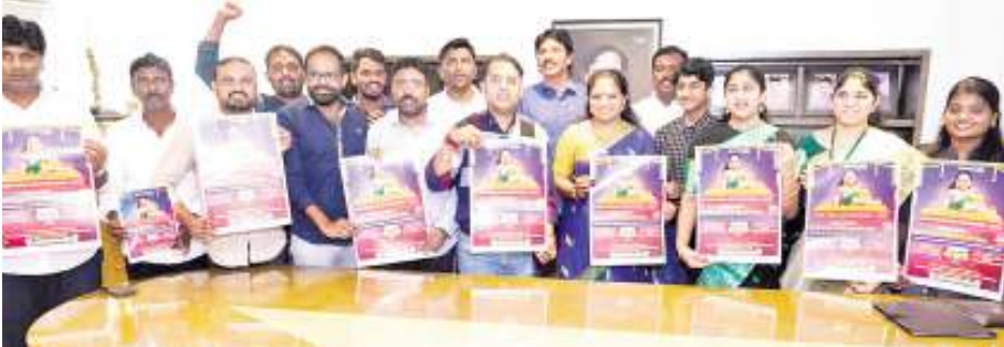
TRS MLC K Kavitha, along with members of Telangana Jagruthi, unveiling Jagruthi global celebration poster in Hyderabad on Saturday

The Chief Minister said that the Telangana government recognised Bathukamma as State festival and accorded a big importance to the Telangana