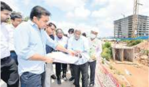
Minister for Municipal Administration K T Rama Rao inspecting the progress of works at Neopolis, the greenfield workspace township, at Kokapet in Hyderabad on Saturday

He suggested a few modifications in the plan for roads, recreation facilities and cycle