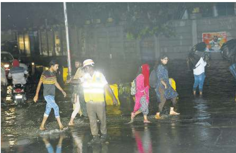
Heavy rains lashed parts of Hyderabad on Monday evening. The commuters who were returning from their work had to face a lot of problems due to water-logging at many places