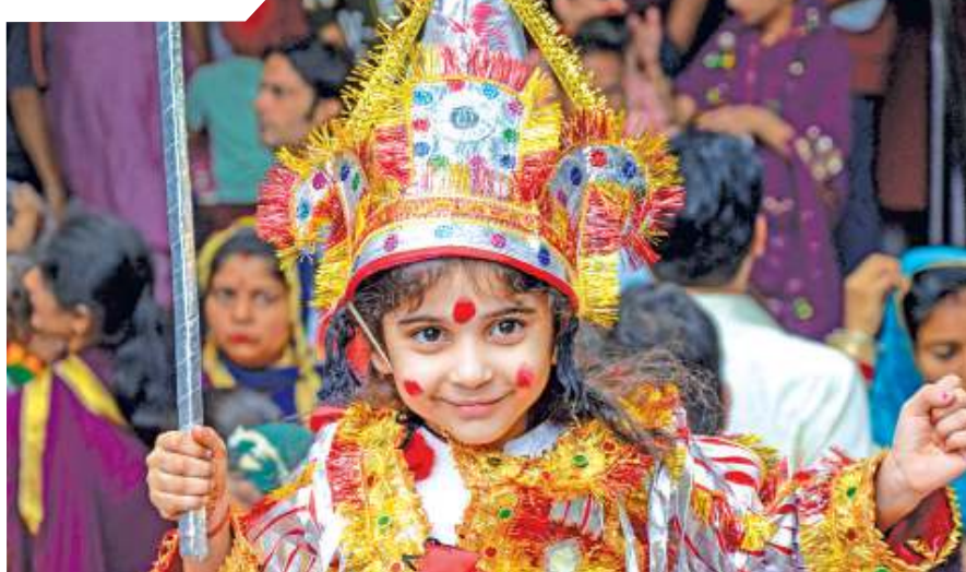
A young devotee pays obeisance at Durgiana Temple on the first day of 'Navratri' festival, in Amritsar