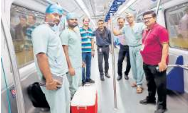
A panel of doctors, along with medicos, carry the harvested heart on the Metro Rail

This activity coincided with the handling of special metro train services beyond the business hours of September 25, for the return