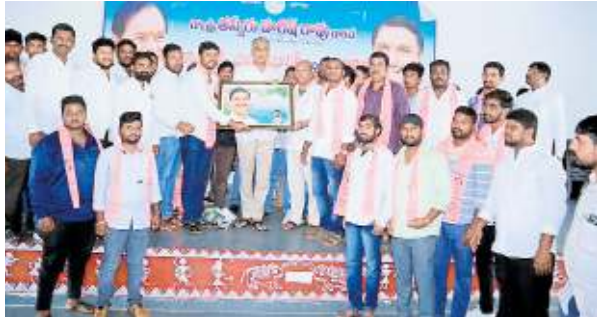
Minister for Finance T Harish Rao welcoming the Congress and BJP leaders and activists into TRS fold at a function in Siddipet on Monday

Speaking on the occasion, Harish Rao said Mission Bhagiratha and Mission Kakatiya had become a role model for the entire nation. The unprecedented development in Siddipet district attracted the attention of everyone. The successive governments had in the past failed to make differences to the lives of the poor. The successive governments had in the past even