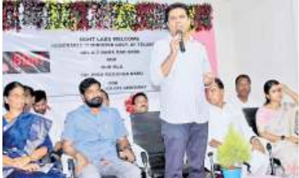
Minister for Municipal Administration K T Rama Rao speaking at BNDT Labs in Adilabad on Monday

The Minister was interacting with NTT Data Solutions and BDNT Labs here. He expressed his happiness over the promoters choosing the backward district to set up software companies. The district had been left high and dry in erstwhile Andhra Pradesh. The Adilabad district witnessed rapid strides towards progress after TRS under the leadership of Chief Minister K Chandrashekar Rao came to power. The Chief Minister's leadership has given a fresh impetus to the development of the district, he said.