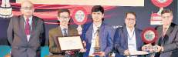
GMR-led Hyderabad International Airport members receive the National Energy Leader and Excellent Energy Efficient Unit awards

GMR-led Hyderabad International Airport Limited (GHIAL) has won National Energy Leader and Excellent Energy-Efficient Unit awards at the 23rd National Award Ceremony for Excellence in Energy Management organised by the Confederation of Indian Industry (CII) and Godrej Green Business Centre (GBC) during the 21st edition of Energy Efficiency Summit. Over the last three years, GHIAL operations have led to a substantial energy saving of around 5.41 MU (4,426 tonnes of carbon emissions reduction) owing to its sustainable