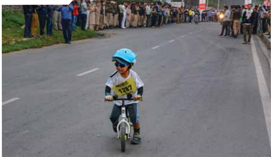
A child participates in the 'Pedal For Peace' cycle race organised by Jammu and Kashmir Police, in Srinagar