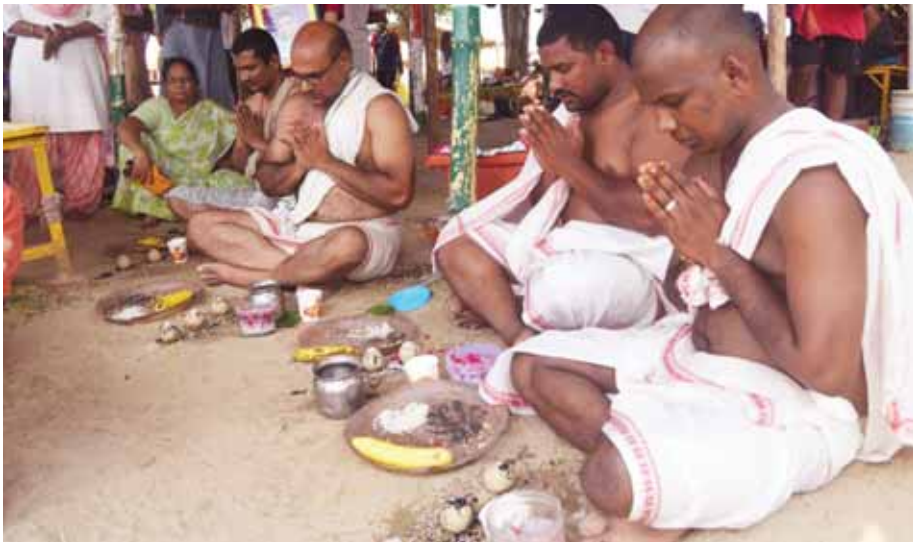
Devotees perform 'Pind Daan' for their ancestors after taking a holy dip in Ganga during Pitru Paksha at Sangam in Prayagraj