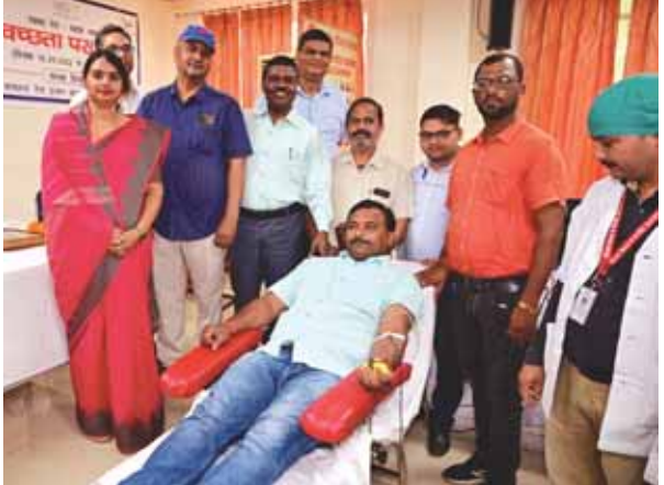
Blood donation camp being held at BLW in Varanasi on Friday