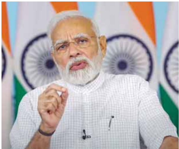
Prime Minister Narendra Modi digitally addresses the National Conference of Environment Ministers being held in Ekta Nagar, Gujarat, on Friday

Pointing to the "complications" involved in getting environmental clearance, the Prime Minister said the development