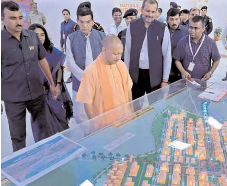
Chief Minister Yogi Adityanath at the National Urban Planning and Management Conclave in Lucknow on Friday