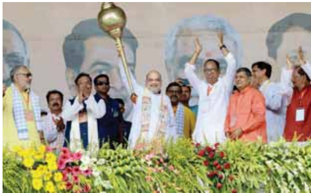
Union Home Minister Amit Shah during BJP's 'Jan Bhavna' rally, in Purnea on Friday

He, however, refrained from joining issue with the contention of Kumar's JD(U)