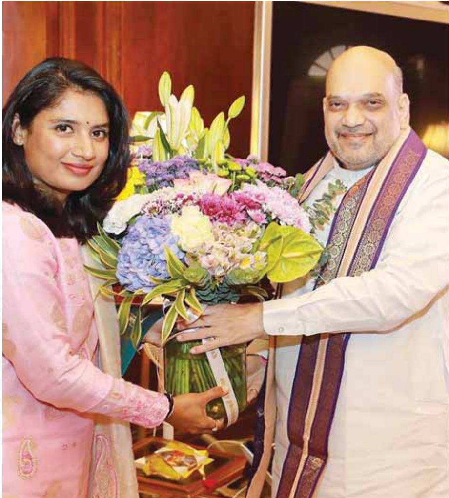
Union Home Minister Amit Shah with former captain of India women's national cricket team Mithali Raj, during a meeting