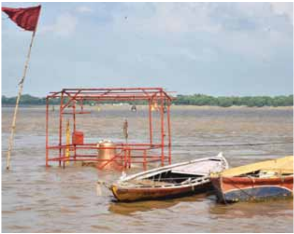
Water level of Ganga continues to rise in Varanasi on Friday.

As per the report of Middle Ganga Division-III of Central Water Commission (CWC), the river rising trend has continued right from upstream Phaphamau to downstream Ballia, including Prayagraj, Mirzapur, Varanasi and