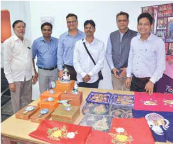
GeM 'Seller Samvad' being held in Varanasi on Friday.