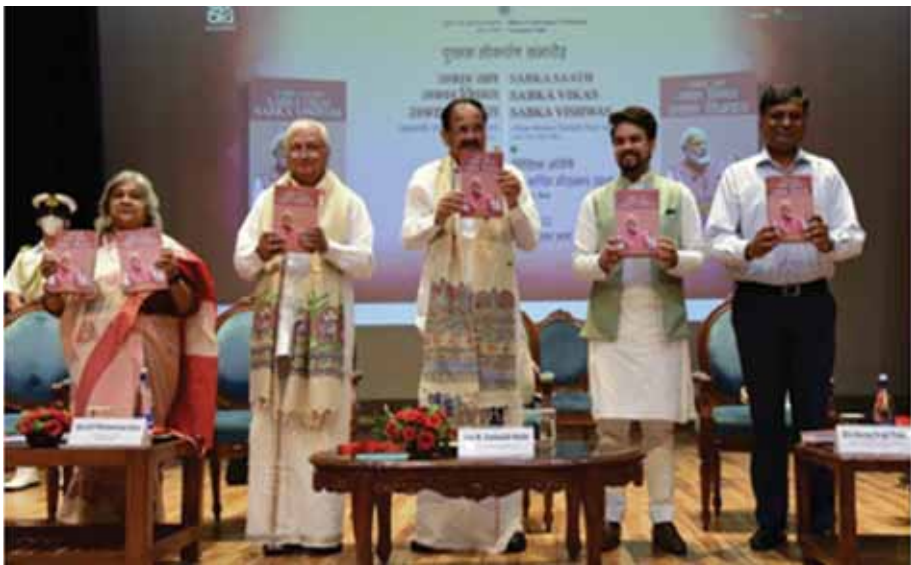
Prime Minister for his achievements across diverse sectors

Former Vice-President M Venkaiah Naidu on Friday said Prime Minister Narendra Modi should meet more often with the political leadership from all sides which may help clear some "misunderstandings" the Opposition parties might have about his methods. Speaking at the launch of a book on the Prime Minister's speeches, Naidu praised the