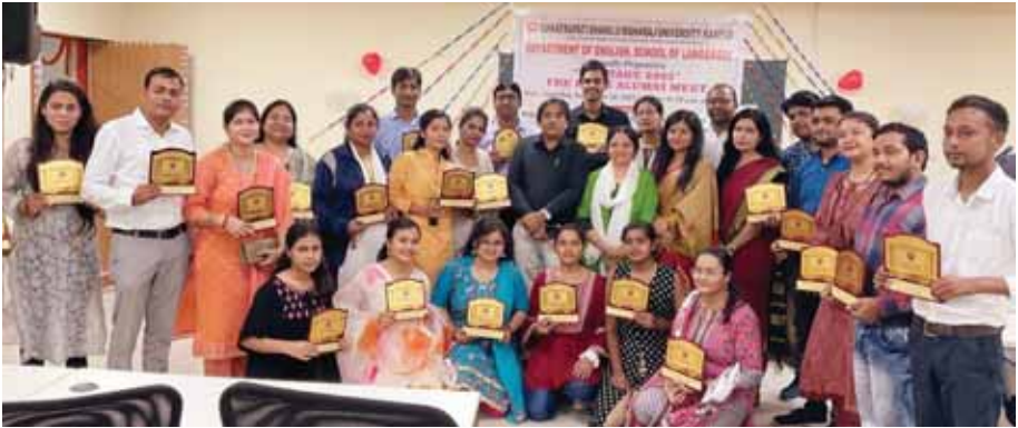
Alumni Meet of Department of English, CSJM University, organised on Saturday.