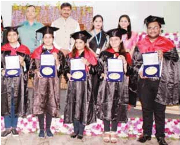
Virendra Swarup Institute of Computer Studies organised a felicitation ceremony of the outstanding students on Saturday.