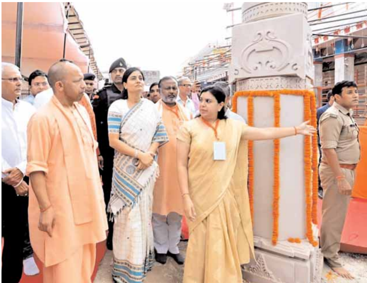
Chief Minister Yogi Adityanath during the inspection of Vindhya corridor in Mirzapur on Saturday