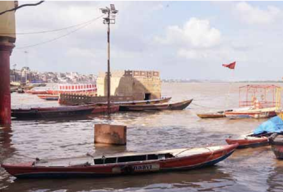
Water level of river Ganga continues to rise in Varanasi on Saturday.

During the last 24 hours most of the places of the region received brief spells of rains and it is expected that in the coming couple of days, the region will also receive more rains. If there will be heavy rains like some parts of north India and