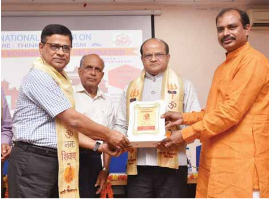
Seminar on tourism being held at BHU in Varanasi on Tuesday.