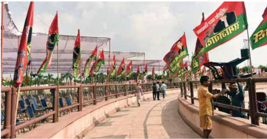
Preparations are in full swing for the Samajwadi Party's national convention at Ramabai rally ground on Tuesday

Akhilesh had first taken over as SP's national president after replacing his father