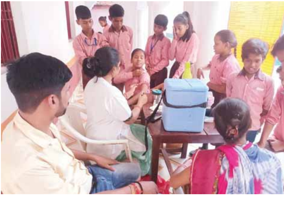
Regular immunisation being held at a school in Varanasi on Monday.