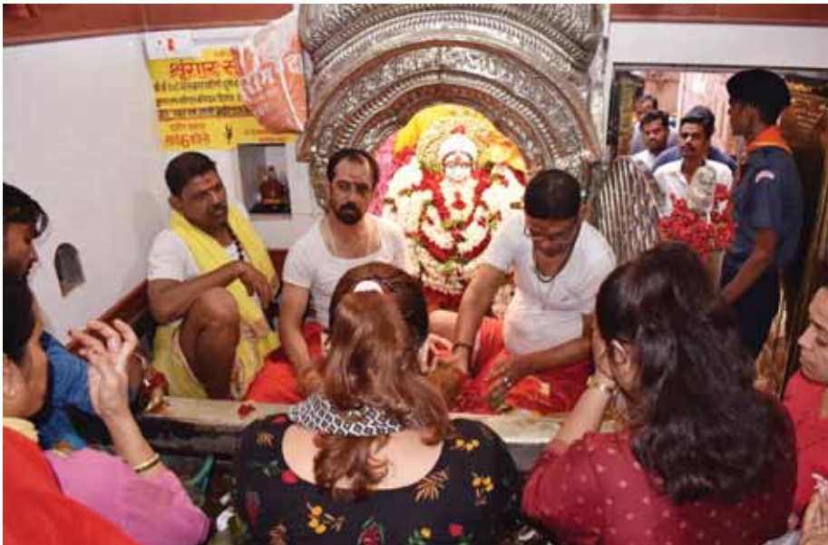
Devotees offering prayers at Brahmarini Devi temple on second day of Navratri in Varanasi on Tuesday

Heavy rush of devotees was also seen throughout the day at the famous Durga Mandir (Durga Kund) as usual. Rush was also seen at some other temples of goddesses. This holy city is a rare place where there are separate temples of all the nine Gauris and Devis where the devotees reach