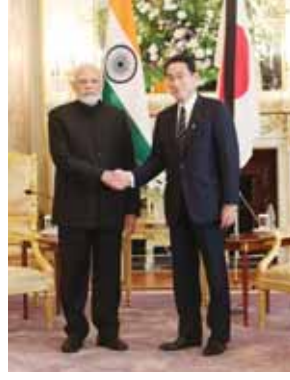
Prime Minister Narendra Modi with Japanese Prime Minister Fumio Kishida in Tokyo

"When I was in Tokyo earlier this year, little did I imagine I would be back for the solemn programme of