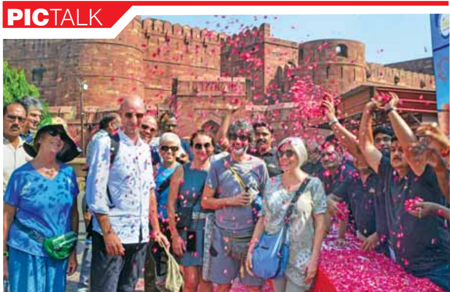
Tourists being welcomed with flower petals at the Agra Fort on World Tourism Day, in Agra

Without producing a shred of evidence, they accused Saxena of laundering nearly ₹1,400 cr of demonetized currency in 2016 allegedly by putting pressure on employees of the Khadi and Village Industries Commission, when Saxena was its chairman. The fact remains that Saxena had ordered an inquiry into the laundering of around ₹17lakhs by the KVIC treasurer and another employee. It is incomprehensible how AAP leaders arrived at the figure of ₹1,400 cr and flung it without a second thought at a constitutional functionary. Saxena not only rubbished the charges but also approached the Delhi HC against this mudslinging at him by AAP, its leaders Atishi Singh, Saurabh Bharadwaj, Durgesh Pathak, Sanjay Singh, and Jasmine Shah. Saxena has also sought damages and compensation of ₹2.5 crore along with interest from the political party and its five leaders. Saxena had earlier sent a legal notice to AAP and its leaders asking them to issue a press release "directing all members of the party and all persons associated with it, whether directly or indirectly, to cease from spreading and circulating false, defamatory, malicious and unsubstantiated statements". Now that the HC has ruled in his favor, AAP leaders may have a tough legal battle on their hands against the LG.