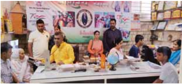
Patients being examined at Arogyadham Homoeopathic Clinic, Gwaltpoli on Tuesday.