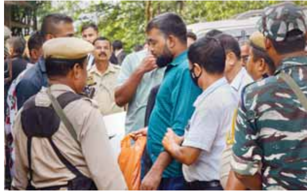
A member of Popular Front of India (PFI) arrested by Assam Police being produced before a court in Guwahati on Tuesday

The searches were mostly conducted by State police teams spread across Uttar Pradesh, Karnataka, Gujarat, Delhi, Maharashtra, Assam