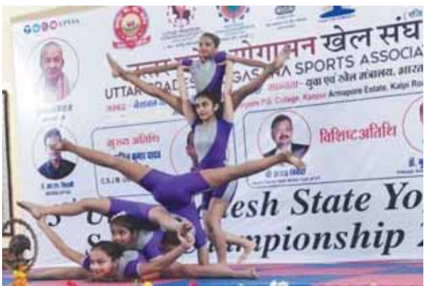
Students of Armapore Degree College perform yoga asanas at the UP State Level Yogasan Sports contest on Wednesday.

He said a student needed to be healthy. He said students who practice yoga regularly were bound to have a positive