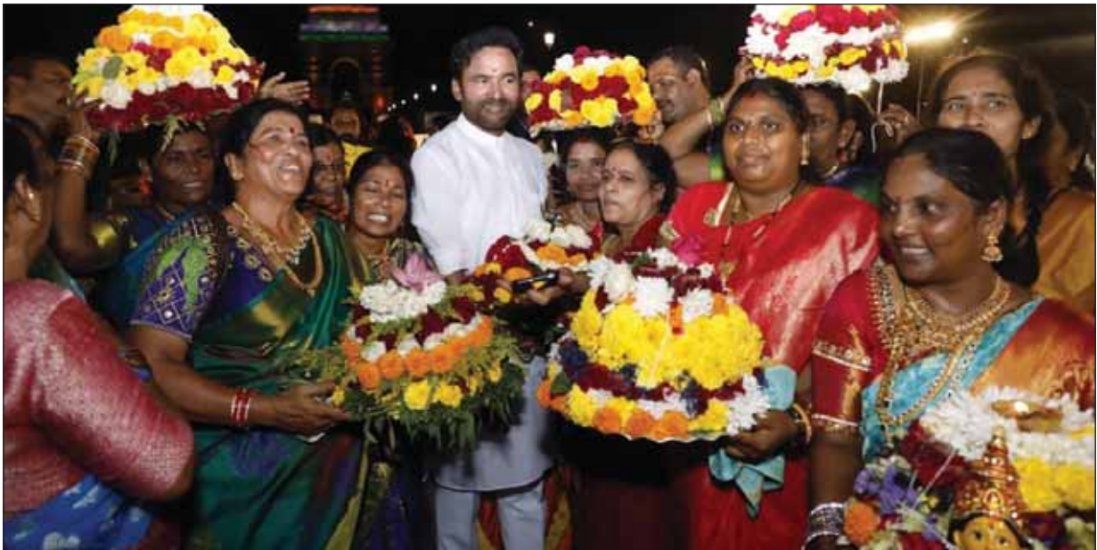
Union Minister for Culture, Tourism and Development of North Eastern Region G Kishan Reddy celebrating Bathukamma flower festival at Kartavya Path in New Delhi on Tuesday

Therefore, the appeals are allowed and the conviction and penalty are set aside. The appellant shall be released forthwith if not wanted in connection with any other case”, the bench said. The top court was critical of the approach of the High Court and the trial court and said, “Before wrapping up, it is necessary to say something about the approach adopted by the Sessions Court and High Court.