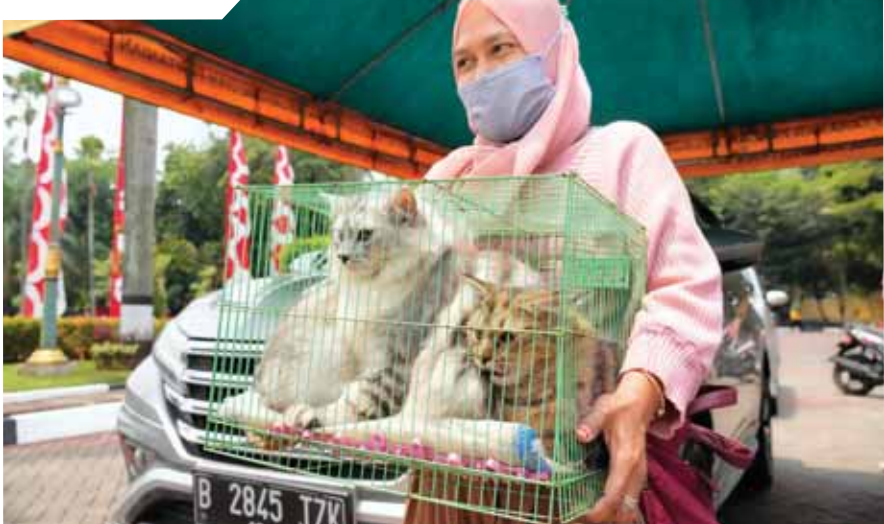
A woman carries her pet cats for vaccination on World Rabies Day in Jakarta, Indonesia