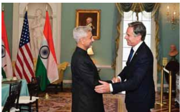
Foreign Minister Subrahmanya Jaishankar shakes hands with Secretary of State Antony Blinken during a press conference at the State Department in Washington on Tuesday