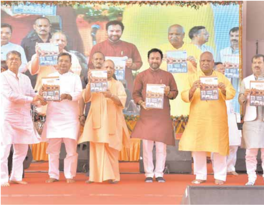
Chief Minister Yogi Adityanath releasing a book 'Sakshi' published by Ayodhya Shodh Sansthan in Ayodhya on Wednesday

The chief minister continued, "We must take forward the beautification work of Ayodhya in a time-bound manner so that as the under-construction grand Ram temple gets