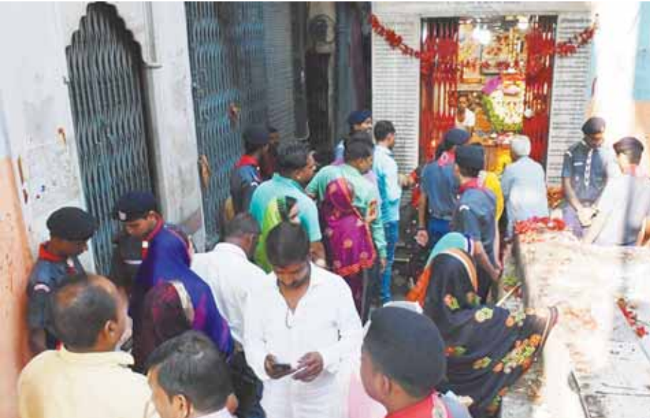
Devotees offering prayers at Chandraghanta Devi temple in Varanasi on Wednesday.

Heavy rush of devotees was also seen throughout the day at the famous Durga Mandir (Durga Kund) as usual. Rush was also seen at some other temples of goddesses. This holy city is a rare place where there are separate temples of all the nine Gauris and Devis where the devotees reach to offer prayers on different days during Basantik (Chaitiya) and Sharadiya Navratri respectively. Besides, hundreds of devotees rushed to Vindhyachal in Mirzapur district by Roadway buses or other vehicles to offer prayer on this auspicious occasion. Rush was also seen at Old Durga