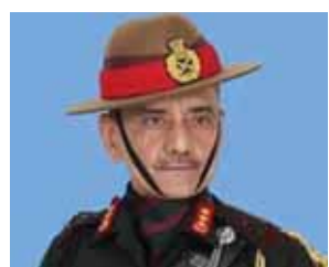
counter-insurgency operations in Jammu and Kashmir and North-East India.

In a career spanning over nearly 40 years, Chauhan held several command, staff and instrumental appointments and had extensive experience in