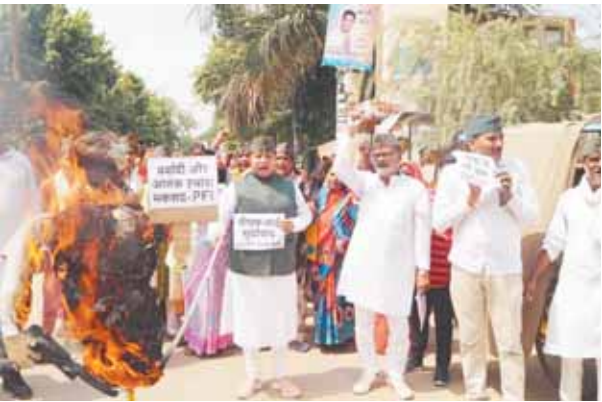
Effigy of PFI being burnt in Varanasi on Wednesday.

The activists gathered at Lamahi here and set the effigy of PFI afire to raise their protest against its national activities. This organisation is conspiring against the country and