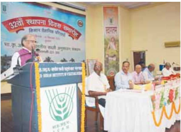
IIVR celebrating its Foundation Day in Varanasi on Wednesday.

He also highlighted the benefits being given to the farmers by extension programmes like Farmers First and Scheduled Tribe Sub Plan. In his address, he said that the seeds of varieties of vegetables are being produced by realising the concept of vegetable-village through farmers.