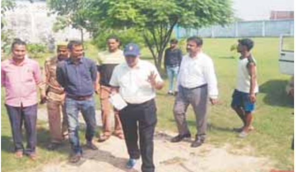
The team of Kesco and UP State Pollution Control Board sealing the units functional around the boundary wall of Air Force Chakeri.

The officials said these units were not only violating the pollution control norms but also were storing hazardous chemicals and waste