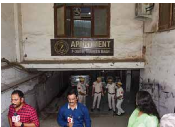
Police personnel deployed at Popular Front of India (PFI) office building, at Shaheen Bagh in New Delhi on Wednesday

With the ban, the PFI joins a dubious club of 43 proscribed outfits notified by the Union Home Ministry, including Communist Party of India (Maoists), Students Islamic Movement of India (SIMI), Pakistan-based Lashkar-e-Tayyaba and Jaish-e-