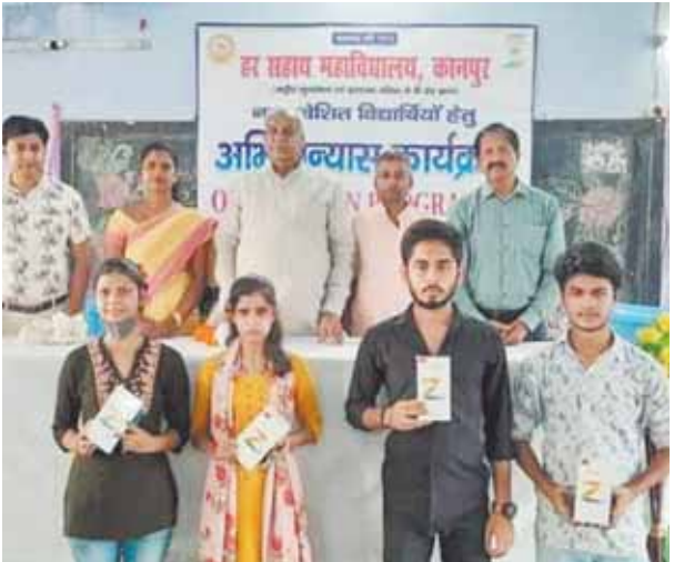
BJP MP Satyadev Pachauri (in the middle) with students with smartphones at the Harsahai PG College on Wednesday.