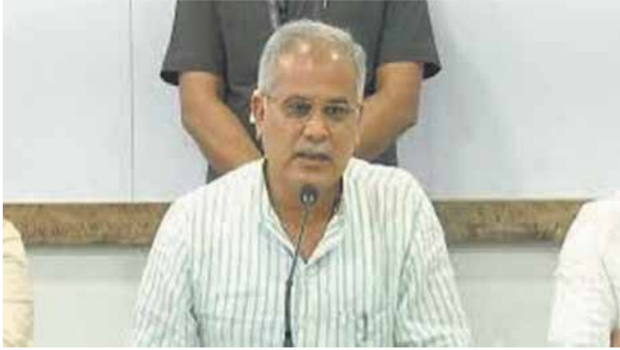
in these games, Baghel said, but they must be domiciles of Chhattisgarh. Gedi, pitthul, volleyball, hockey and tennis ball cricket have also been included in the games. Competition will be for males and females and at

Under the Chhattisgarhiya Olympics, competitions will be organized in various disciplines, from kabaddi and kho-kho to tennis and cricket, he said. Everyone can participate