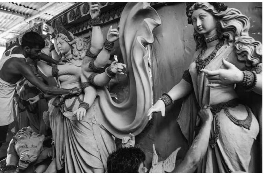
Artisans work on idols of Goddess Durga ahead of the upcoming festival of Durga Puja, in Guwahati on Tuesday

the Agricultural Defense Unit. A proposal to give a 50 per cent subsidy on storage units has also been approved for the safe storage of crops. It is worth noting that farmers suffer huge crop losses due to weeds, insects, pests, damage due to unsafe storage, and rats every year. To reduce the loss of farmers, the cabinet approved an assistance of Rs 192,57,75,000 for a period of five years from 2022-23 to 2026-27. The government will spend Rs 34.17 crore in the current financial year for the benefit of farmers.