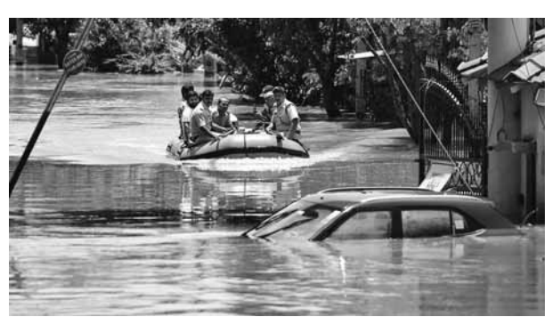
BENGALURU

Karnataka Chief Minister Basavaraj Bommai on Tuesday blamed the previous Congress Governments' "maladministration" and unprecedented rains in the capital city for the deluge. He said, despite all odds, his Government has taken it up as a challenge to restore the rain battered city, and make sure that such things don't recur in the future. Owing to the torrential downpour that lashed the state capital for the last couple of days, several areas are still under water with houses and vehicles partially inundated, there by affecting normal life. "Karnataka, especially Bengaluru has not received unprecedented heavy rain. For the last 90 years such rain has not been recorded. All the tanks are full and are overflowing, some of them have breached, and there have been