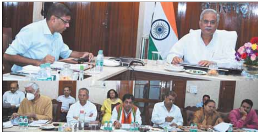
Gaurela-Pendra-Marwahi districts of Bilaspur division and districts in Bastar and Surguja divisions notified as Scheduled areas will not be

Also, people appointed on Grade III and IV in district-level and division-level posts in Korba and