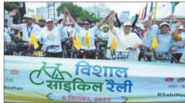
Bhedia also flagged off the Poshan Jagrukta Rath on the occasion and administered oath to people to achieve a malnutrition free society. The campaign was

The rally passed through various places before culminating at the starting point.