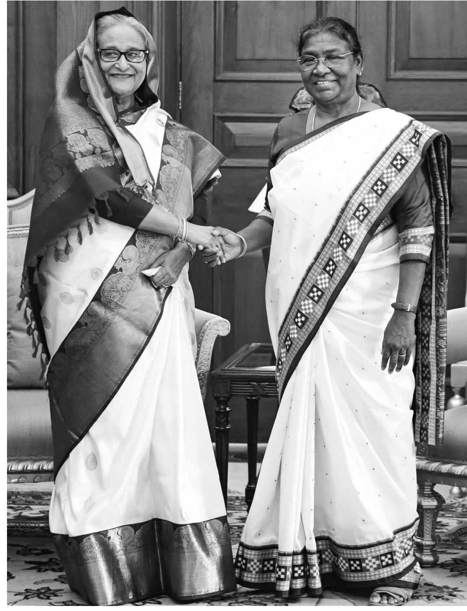
President Droupadi Murmu with Bangladesh Prime Minister Sheikh Hasina at Rashtrapati Bhavan in New Delhi on Tuesday.

The Hasina government had earlier honoured other Indian supporters of the freedom movement of Bangladesh, including writers and politicians. In the past, Hasina had also proposed to confer similar honours to those soldiers who laid down their lives to liberate the country. Hasina, who is on a four-day visit to India, also oversaw the signing of a memorandum of understanding (MoU) between Prasar Bharti and Bangladesh Television (BTV) on cooperation in broadcasting. PNS