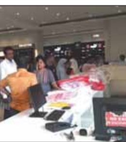
were seized from Sumeet Bazar showroom in New Rajendra Nagar. A penalty of Rs 50,000 was imposed.

A fine of Rs 500 each was imposed on seven shopkeepers.