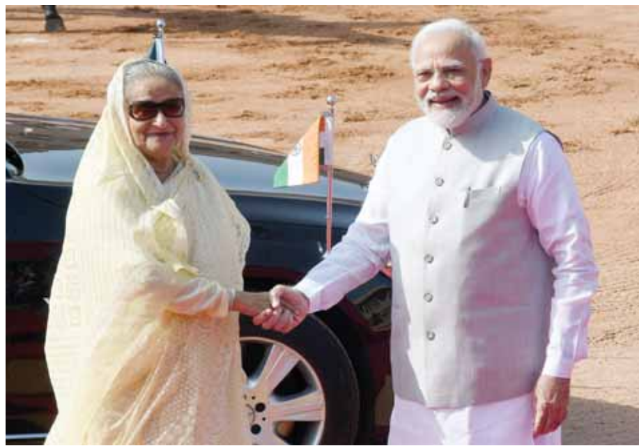
Prime Minister Narendra Modi with his Bangladeshi counterpart Sheikh Hasina during her ceremonial reception at the Rashtrapati Bhavan in New Delhi on Tuesday

agreement for Kushiyara river is the first such pact since the signing of the Ganga water treaty in 1996. The Ganga water pact for a period of 30 years was signed by then Prime Minister HD Deve Gowda and Hasina.