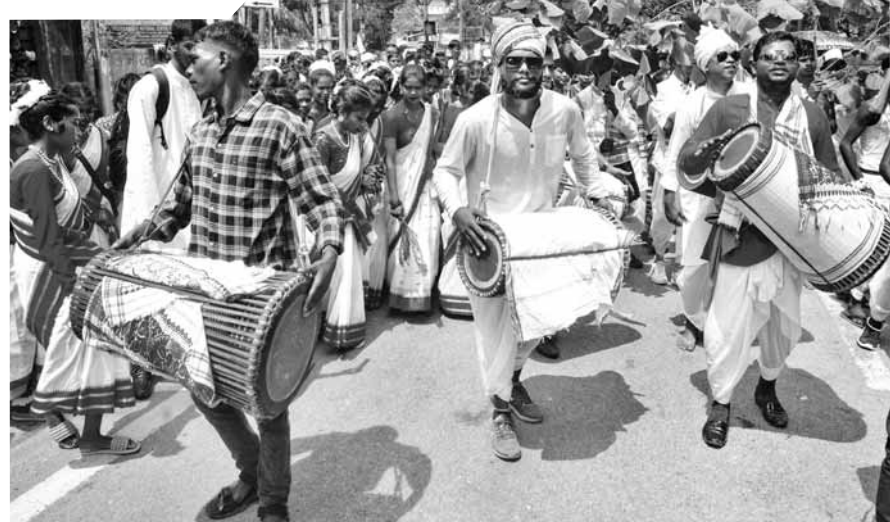
Tribal youth celebrate 'Karma' festival, in Ranchi