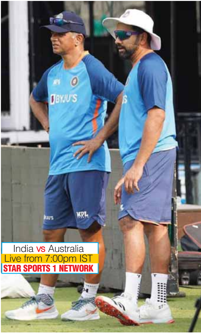
India vs Australia Live from 7:00pm IST STAR SPORTS 1 NETWORK

was shooed in as a like-for-like replacement of injured Ravindra Jadeja, has once again proved his worth with a three-wicket haul on Tuesday.