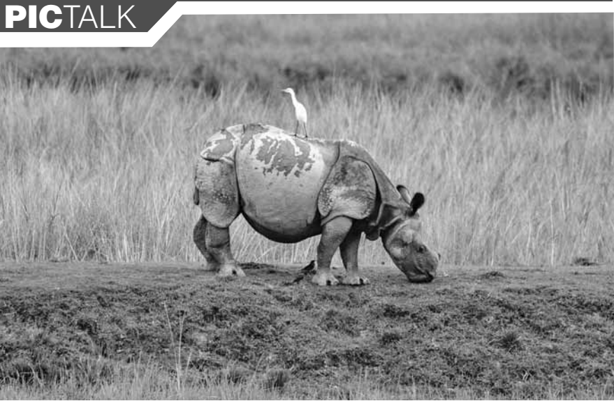
A one-horned rhino inside the Buraphar Range of Kaziranga National Park, on World Rhino Day