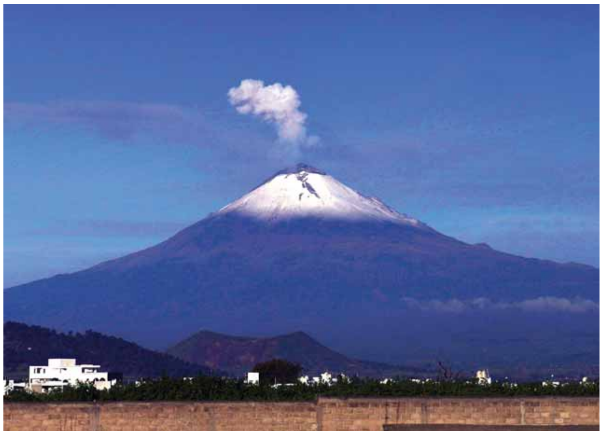
Popocatepetl volcano puffs ash, seen from Cholula, Mexico on Thursday

In 2018, when some Indian lenders sold the pledged shares of Fortis Healthcare to the Malaysia-based firm, Daiichi went to court alleging that the former promoters of Fortis had assured them that their shares in the Indian hospital chain will cover the arbitral award amount.