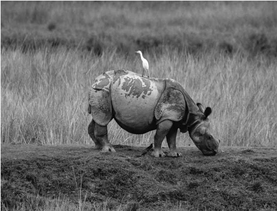
A one-horned rhino grazes inside the Burapahar Range of Kaziranga National Park, on World Rhino Day, in Nagaon district on Thursday.

The BSP chief said livestock was the backbone of self-sufficient rural life and for this reason the governments of other states along with the government of Uttar Pradesh must provide proper financial help to the affected people.