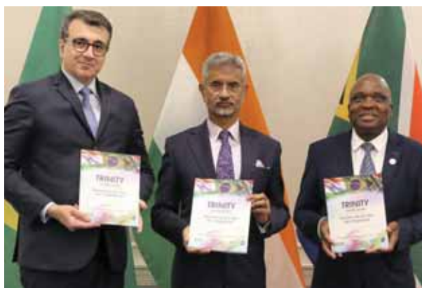
External Affairs Minister S Jaishankar with other dignitaries during the 10th India-Brazil-South Africa (IBSA) Trilateral Ministerial Commission Meeting, in New York, USA

The briefing, chaired by French Minister for Europe and Foreign Affairs Catherine Colonna, was held Thursday as