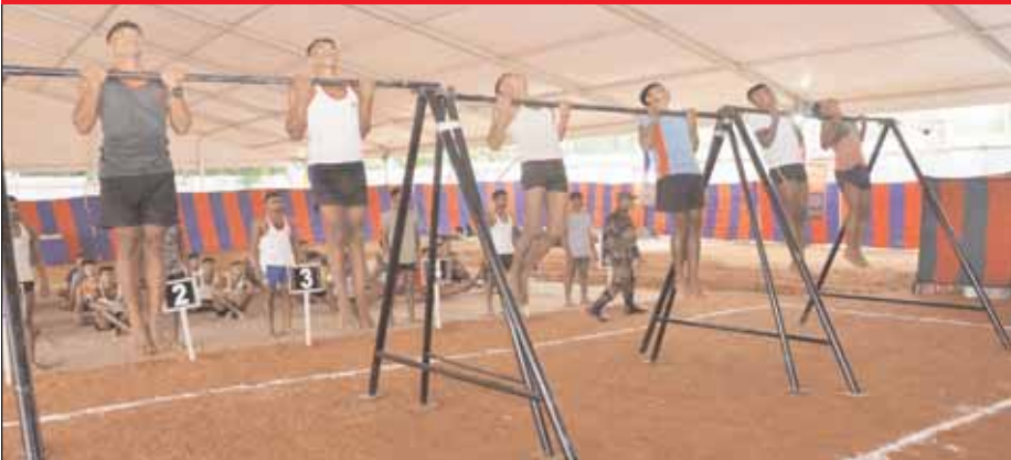
Youngsters undergo physical test as part of Indian Army recruitment 'Agniveer' programme at Morhabadi Ground in Ranchi on Thursday.