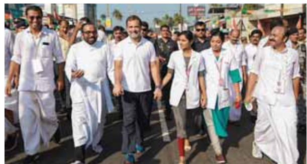
Congress leader Rahul Gandhi and others during the 15th day of party's 'Bharat Jodo Yatra' in Ernakulam, Kerala, on Thursday

He said the RSS chief also spoke to the children about the need to know more about the nation and stressed that while the modes of worship could be different, all religions must be respected.