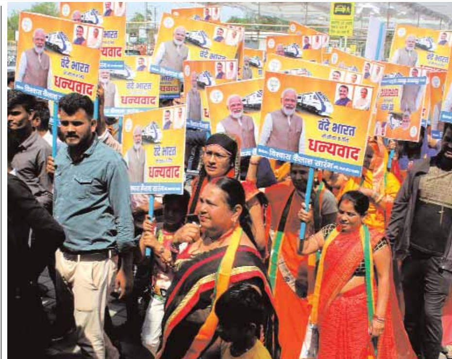
People offer thanks to Prime Minister Narendra Modi during the flagging off ceremony of the Vande Bharat Express train in between Bhopal to New Delhi, at Rani Kamalapati Railway station in Bhopal on Saturday.