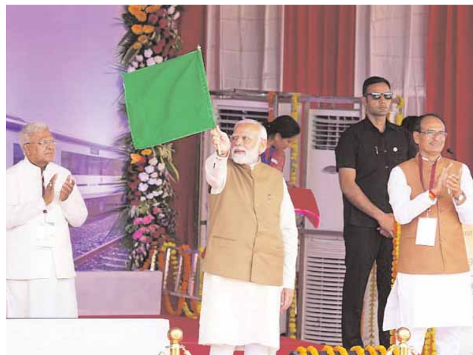
Prime Minister Narendra Modi flags off the Vande Bharat Express between Bhopal and New Delhi, in Bhopal on Saturday. Madhya Pradesh Governor Mangubhai Patel and Chief Minister Shivraj Singh Chouhan are also seen in pic.

Prime Minister Modi said that a record increase is being made in the budget of the Railways. Before the year 2014, the average railway budget of Madhya Pradesh used to be Rs.600 crores, which has now increased to Rs.13000 crores. 100 percent electrification of railway tracks has been achieved in 11 states of the country including Madhya Pradesh. The speed of electrification was 600 km per year before 2014, now it has increased to 6000 km per year.