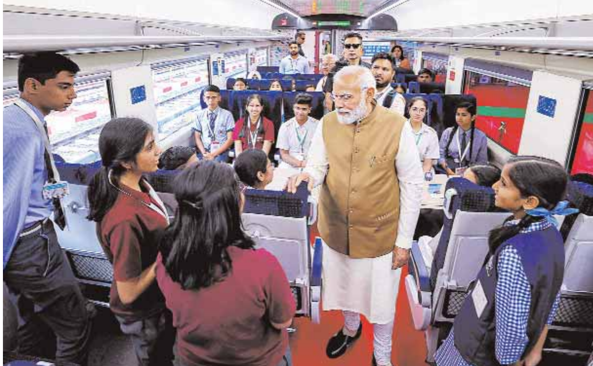
Prime Minister Narendra Modi interacts with students on Bhopal-Delhi Vande Bharat Express train after flagging off the semi-high speed train in Bhopal on Saturday. The train will run on all days except Saturday. It will depart from Rani Kamalapati station at 5.40am and reach Hazrat Nizamuddin station at 1.10pm. The Delhi-Bhopal leg of the train will start at 2.40pm and reach Bhopal at 10.10pm, officials said. The train is scheduled to halt at Gwalior and Agra enroute