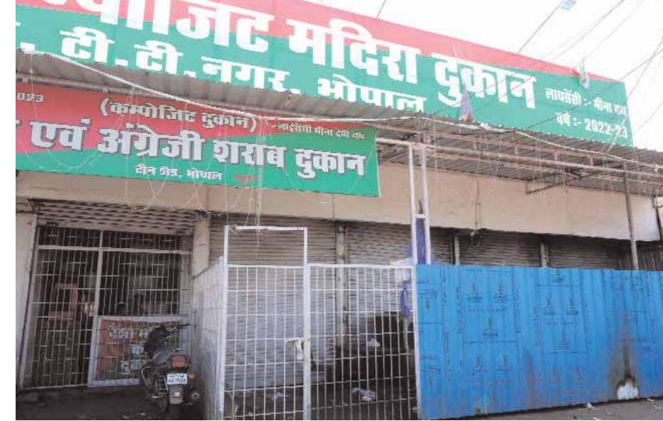
A view of closed Ahata after the State Government's order to close down all the ahatas beside liquor shops all over the State from Apr 1, in Bhopal on Saturday.