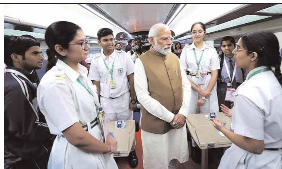
Prime Minister Narendra Modi interacts with students during the flagging off ceremony of Vande Bharat Express train at Rani Kamalapati Railway station in Bhopal on Saturday.

This multiple team involvement procedure is now possible in the Department of Surgical Oncology AIIMS Bhopal which may now become state of art centre for various complex and advanced cancer surgery for the people of Madhya Pradesh and whole of the country. With the further addition of endoscopy services under guidance and leadership of our visionary and committed Executive Director of the Institute, a new surgical facility of esophageal cancer surgery could be started in the Department of Surgical Oncology AIIMS Bhopal.