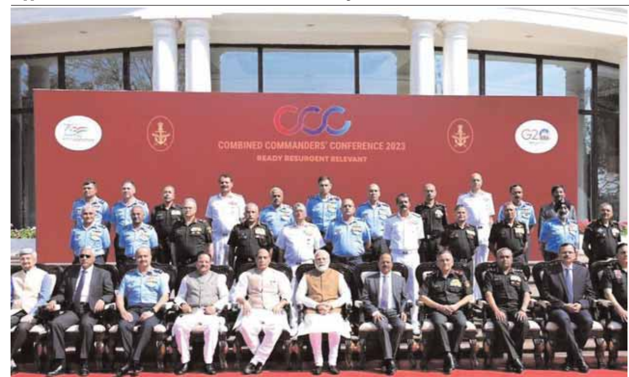
Prime Minister Narendra Modi and Defence Minister Rajnath Singh with defence staff and officials during Combined Commanders' Conference-2023 at Kushabhau Thackeray International Convention Center in Bhopal on Saturday.