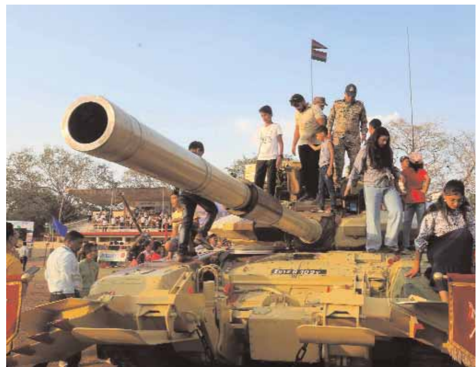
People visit Fauji Mela organised by the Indian Army at MVM Ground in Bhopal on Saturday.

There were allegations of the Delhi government favouring certain dealers while granting liquor licenses in lieu of bribes. Given the gravity of these allegations, the L-G recommended a Central Bureau of Investigation (CBI) probe, after which the Enforcement Directorate (ED) registered a case under the Prevention of Money Laundering Act (PMLA).