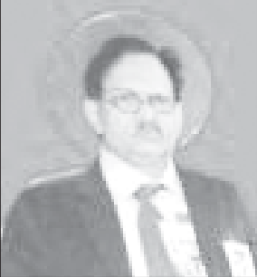
B RAMCHANDRA CST VOLTAIRE

PM Narendra Modi always describes the Indian democracy as a vibrant one. But the way Congress MP Rahul Gandhi was convicted in a Surat Court of defamation on March 23 for his Modi jibe in an election rally in 2019 and within the next 10 hours was "disqualified" as an MP of the Lok Sabha tells that Indian democracy is clearly in a deplorable shape The Freethought Party of India (FPI) is of candid opinion that neither Prime Minister Narendra Modi nor his business friend Gautam Adani is to be equated with India. Attack on anyone of them should never be construed as an attack on India. Fact is nobody in India is above criticism. The FPI disapproves of the mischievous conduct of BJP MPs in not allowing the Lok Sabha and Rajya Sabha to function as per the