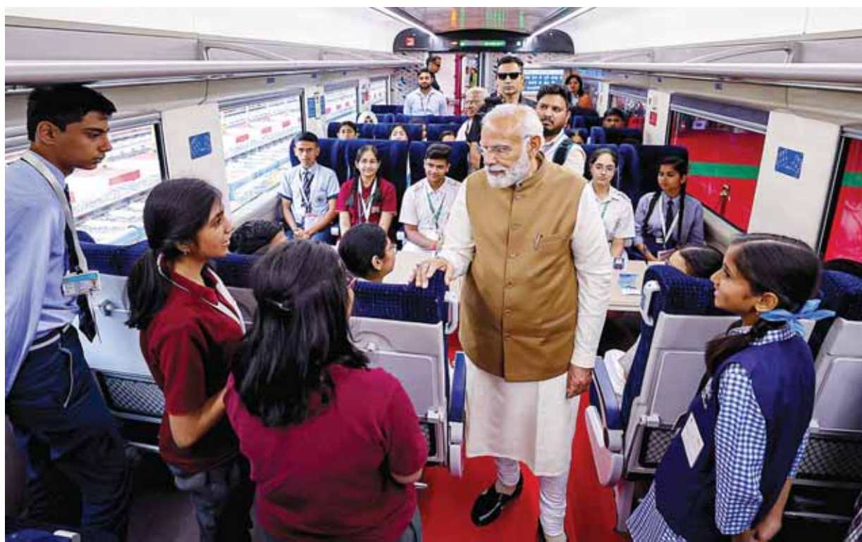
Prime Minister Narendra Modi interacts with students on Bhopal-Delhi Vande Bharat Express train after flagging off the semi-high speed train in Bhopal on Saturday. The train will run on all days except Saturday. It will depart from Rani Kamalapati station at 5.40am and reach Hazrat Nizamuddin station at 1.10pm. The Delhi-Bhopal leg of the train will start at 2.40pm and reach Bhopal at 10.10pm, officials said. The train is scheduled to halt at Gwalior and Agra enroute

Stating that there have been documented instances of hate crimes against Hindu-Americans over the last few decades in many parts of the country, the resolution said Hinduphobia is exacerbated and institutionalised by some in academia who support the dismantling of Hinduism and accuse its sacred texts and cultural practices of violence.